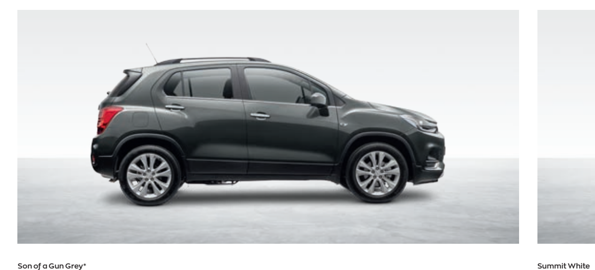
Son of a Gun Grey*