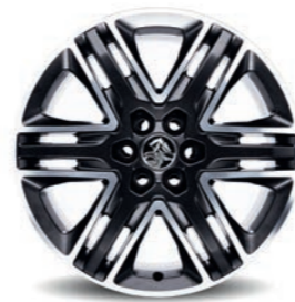
20" wheel in Satin Graphite (Also available in Silver) - LTZ-V only