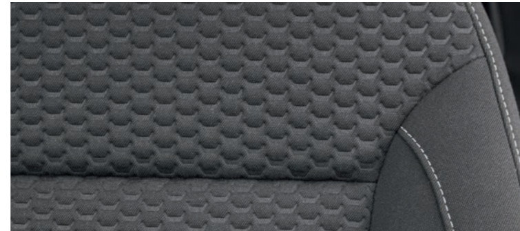
Jet Black cloth trim