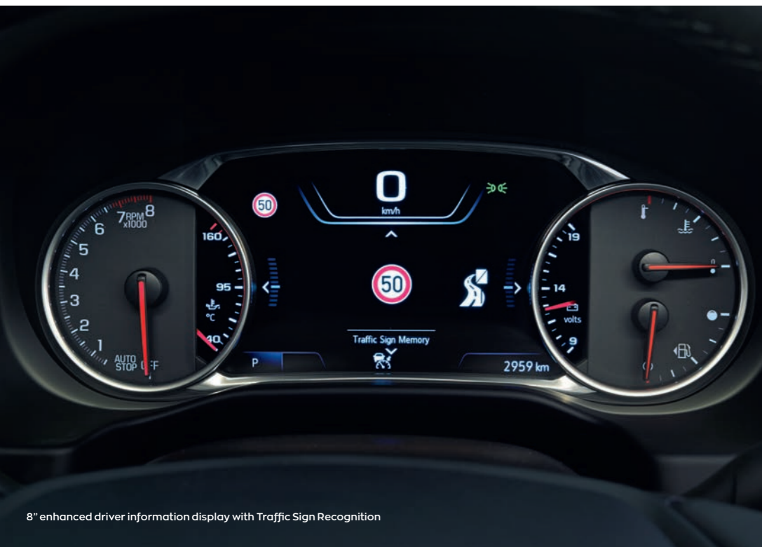
8" enhanced driver information display with Traffic Sign Recognition