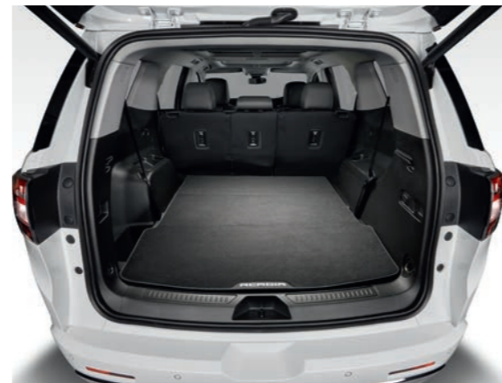
Boot liner - reversible carpet/rubber