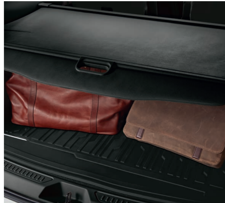
Cargo blind and cargo tray

Designed and engineered just for the Acadia, the Holden Genuine Accessories like carpet and all weather floor mats will take care of any muddy shoes, whilst a bonnet protector will stop rocks from chipping your precious paint. There's also a choice of alloy wheels to take you anywhere in style, locking wheel nuts for peace of mind and seat covers for all seven seats keeping that clean new look for longer.