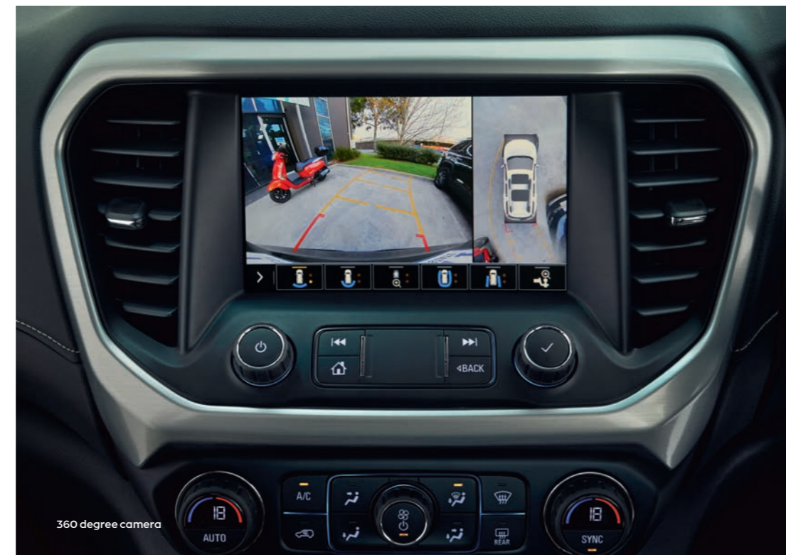
360 degree camera

FlexRide Adaptive Suspension ensures a smoother, controlled ride to maximise comfort by using sensors that tailor the suspension to the moment.