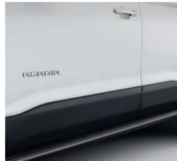
Side assist steps