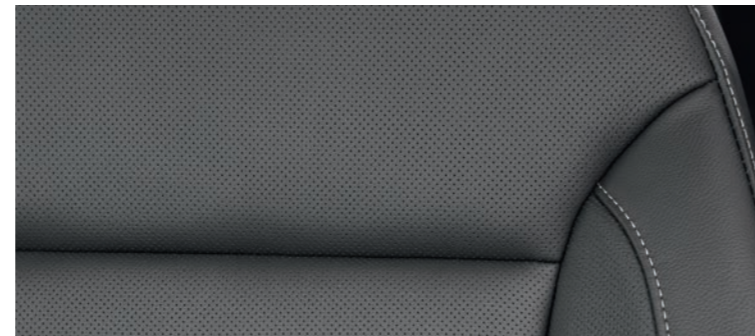
Jet Black perforated leather-appointed trim