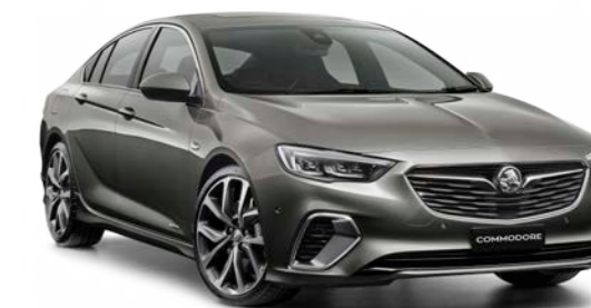
Liftback model shown.