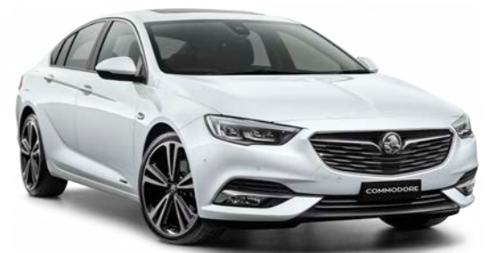
Liftback model shown.