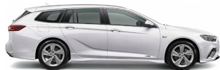
Sportwagon model shown.