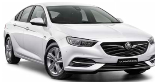
Liftback model shown.