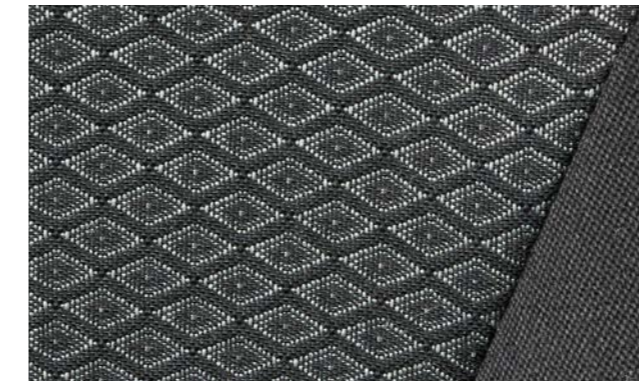
Jet Black cloth trim