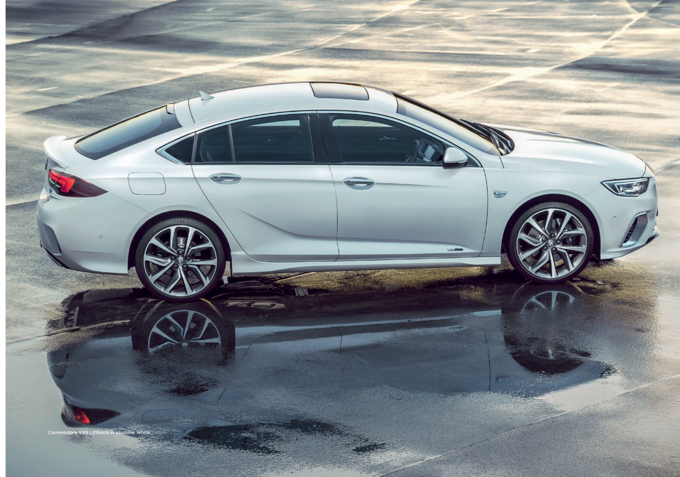
Commodore VXR Liftback in Abalone White