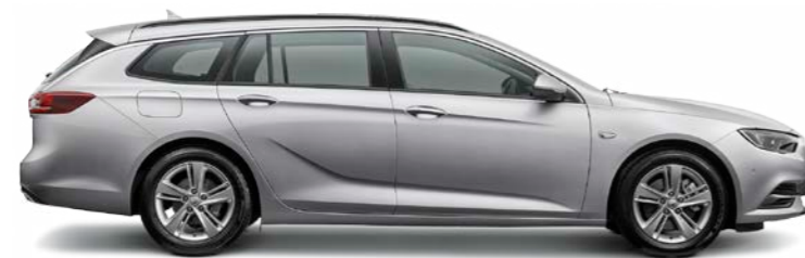
Sportwagon model shown.