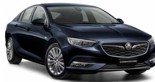
Liftback model shown.

^ Available via special order only *Requires a compatible device