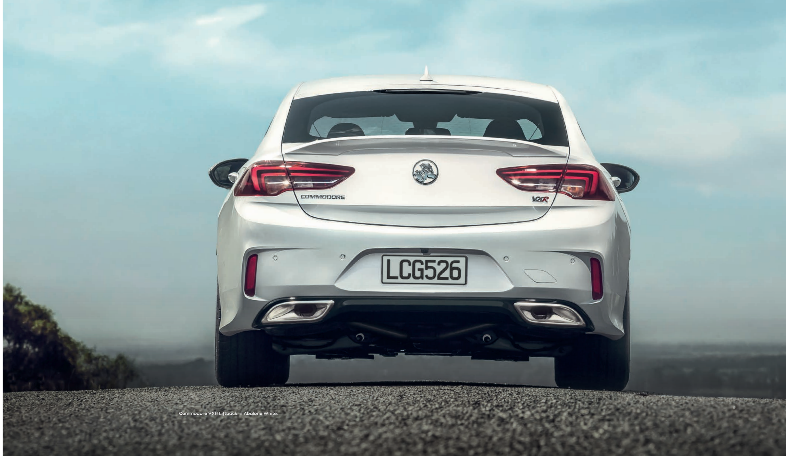
Commodore VXR Liftback in Abalone White.

With unprecedented levels of safety, a multitude of technological helping hands, and a driving experience that could only be described as no less than brilliant, this Commodore is for you, that's for sure.