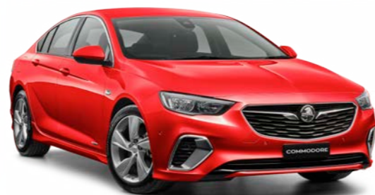
Liftback model shown.