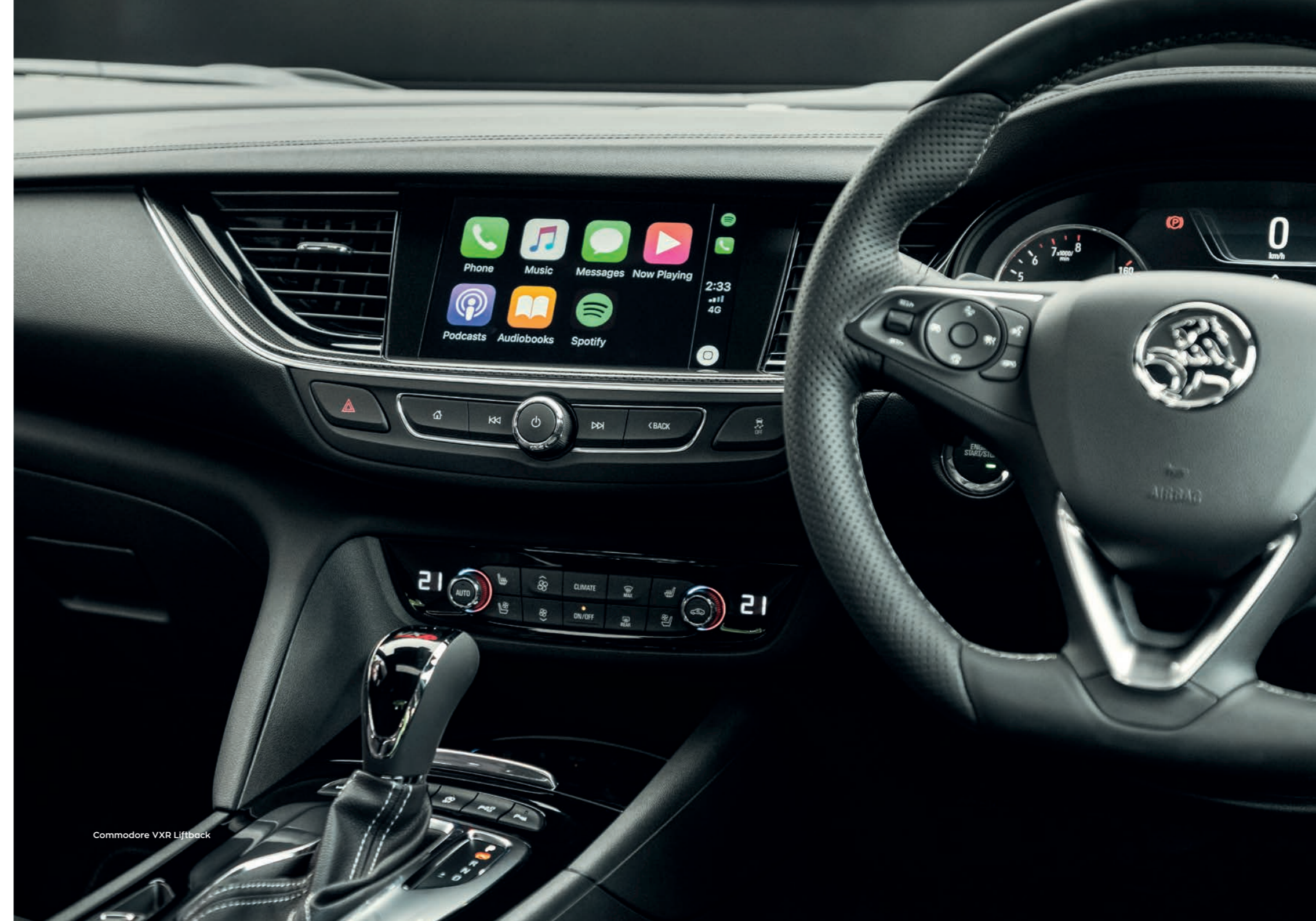
Commodore VXR Liftback