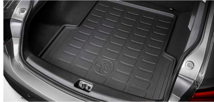
All Weather Boot Liner