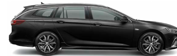
Sportwagon model shown.