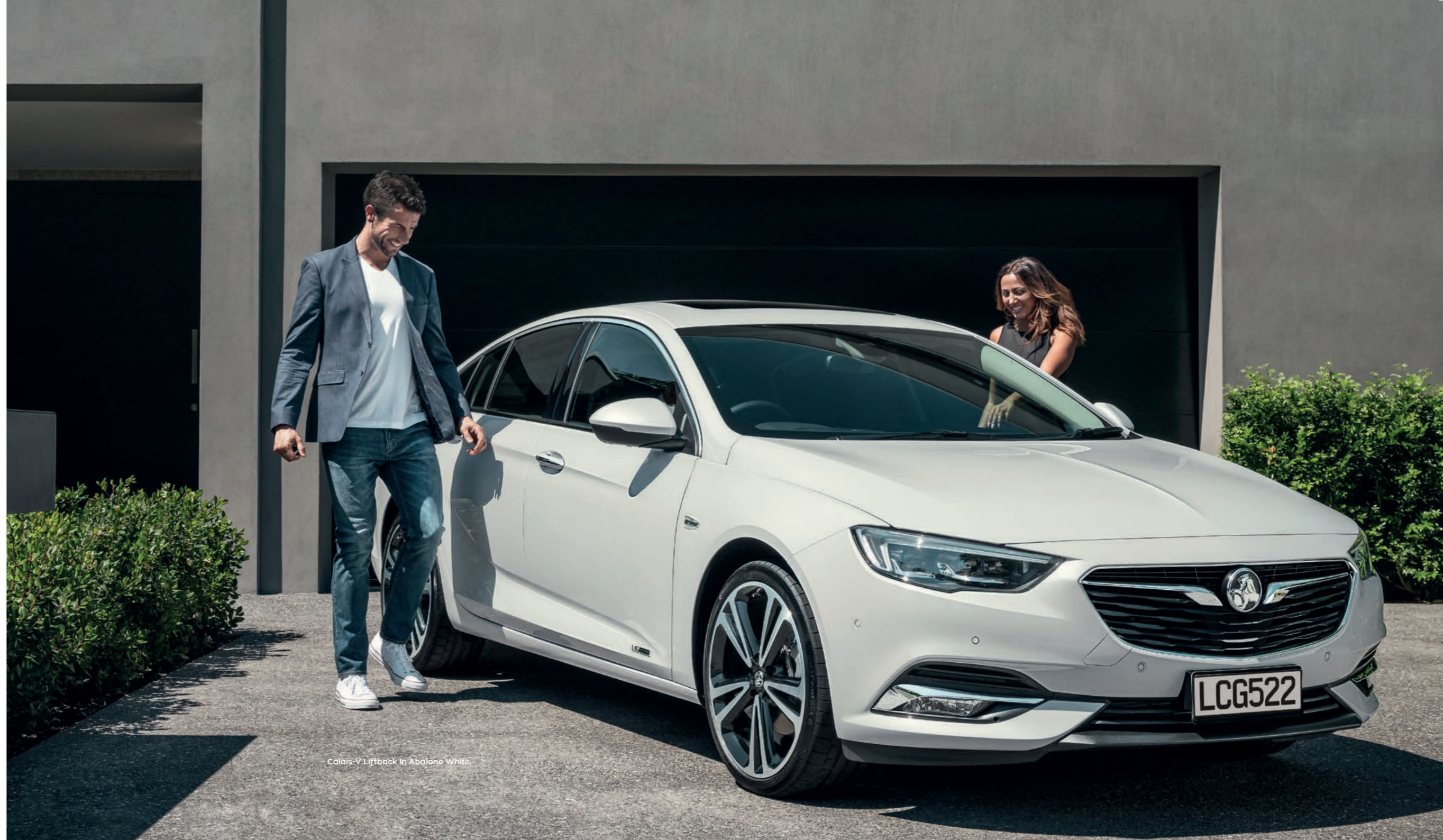
Calais-V Liftback in Abalone White.