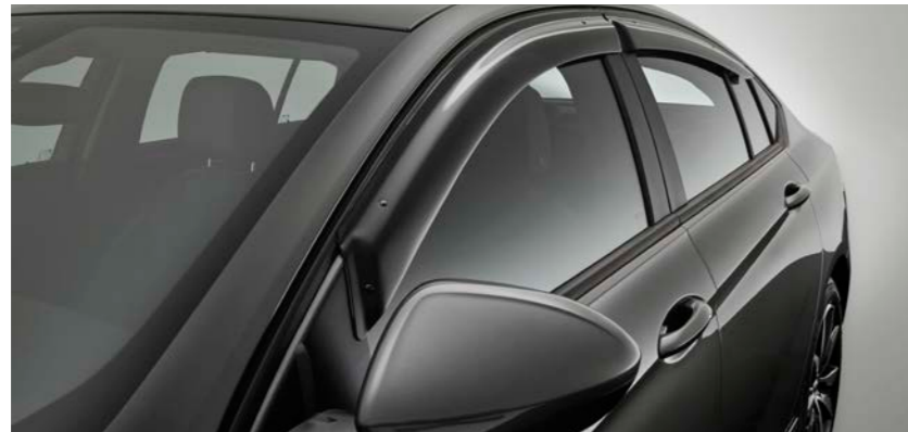
Slimline Weather Shield