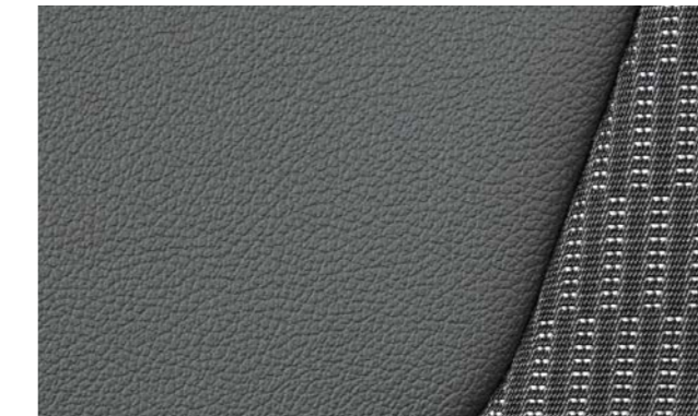
Jet Black cloth/Sportec trim