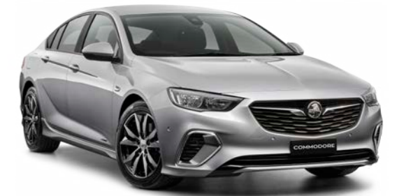
Liftback model shown.