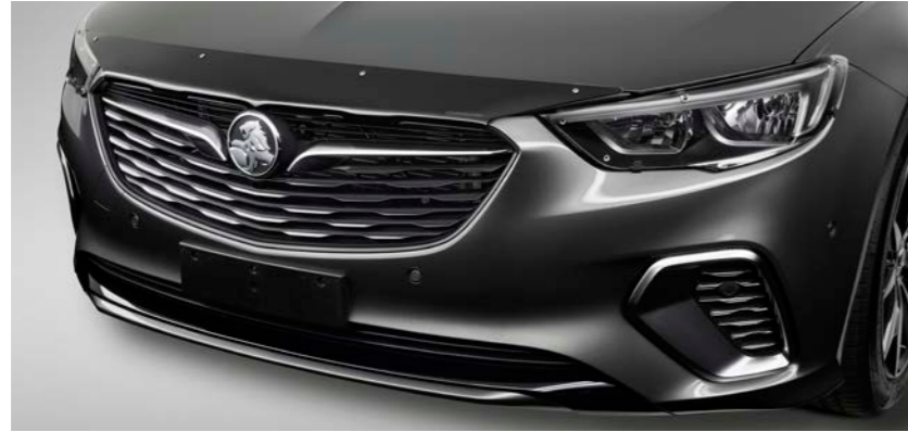
Smoked Bonnet Protector