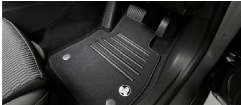
Front Floor Mats