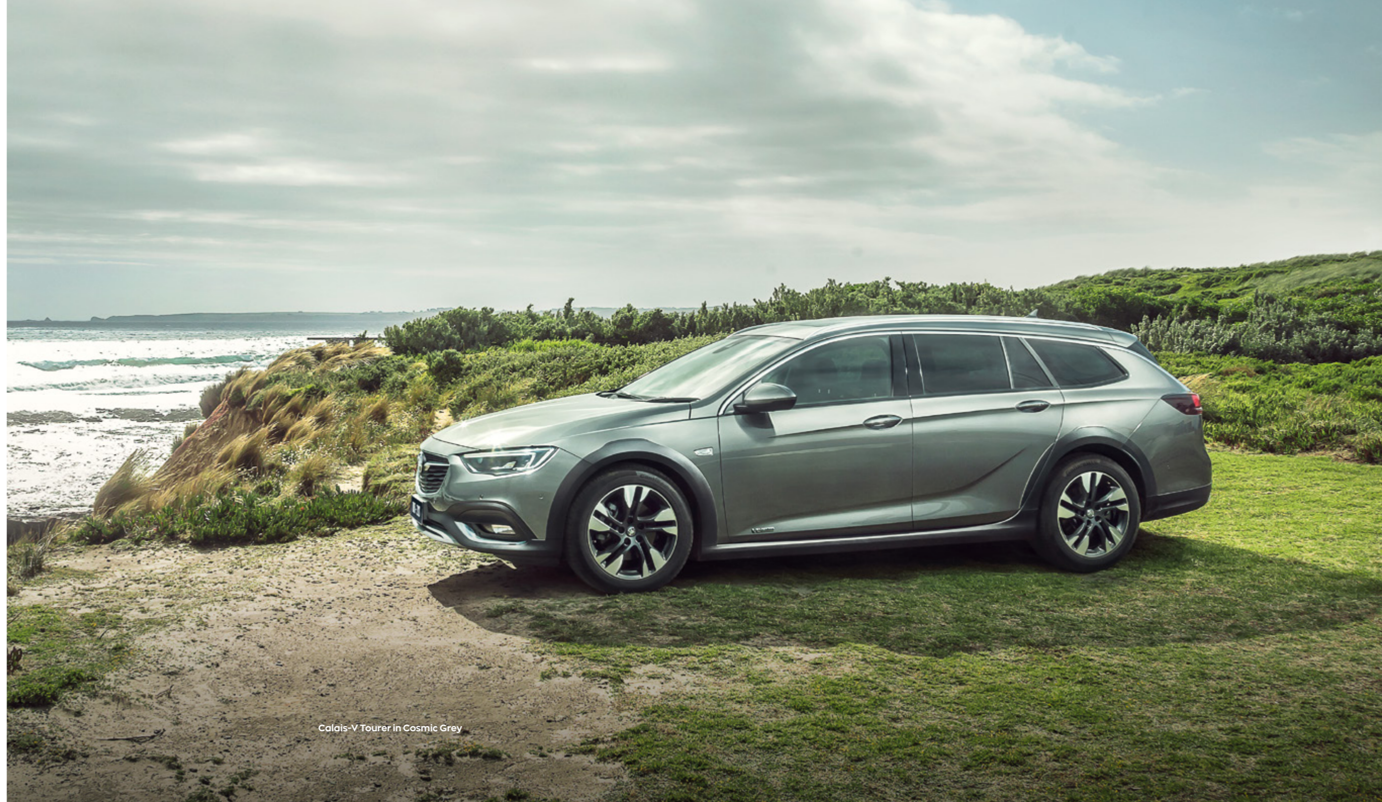
Calais-V Tourer in Cosmic Grey

All of this translates to more opportunities for adventure and more confidence. Especially when towing a caravan or trailer, both of which this Tourer can haul, up to a weight of just over 2 tonnes.