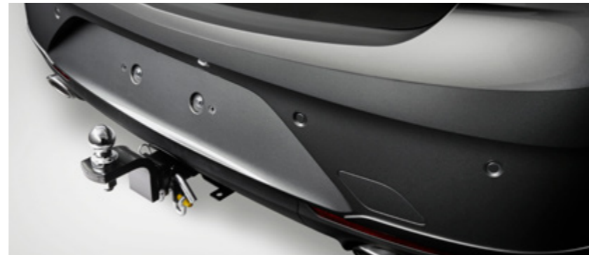
Tow Bar (Liftback model shown)

We're sure you'll want to keep your new Commodore in top condition. That's why every accessory has been meticulously designed and manufactured to specifically protect your vehicle.