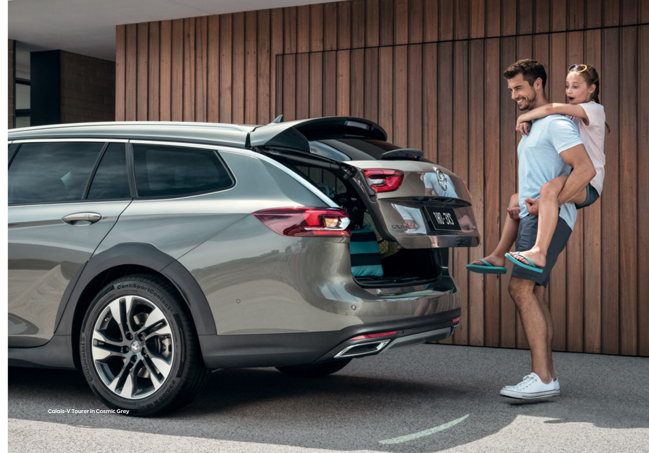
Calais-V Tourer in Cosmic Grey