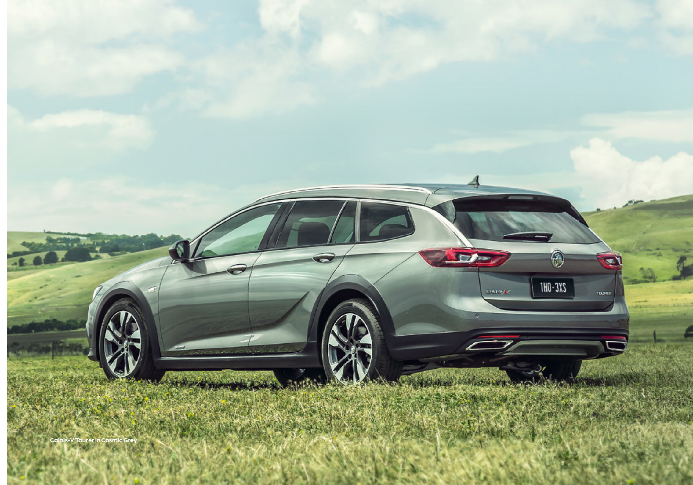
Calais-V Tourer in Cosmic Grey