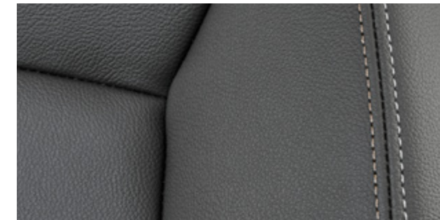
Jet Black leather-appointed trim