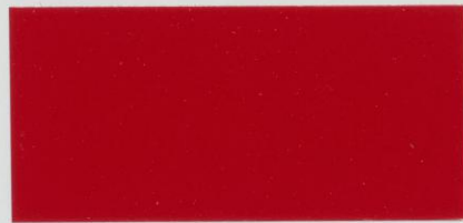
Radiant Red XR4Ti 0P