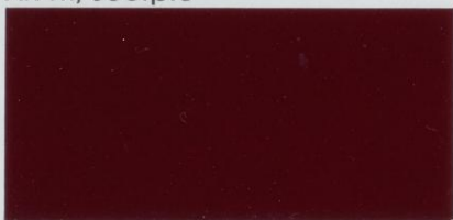
Magenta Red Clearcoat Metallic XR4Ti, Scorio 01