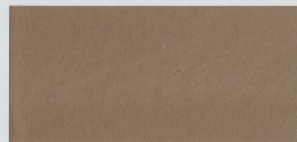
Tuscany Gold Clearcoat Metallic XR4Ti, Scorio 08