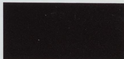
Brabazon Clearcoat Metallic Scorio A5