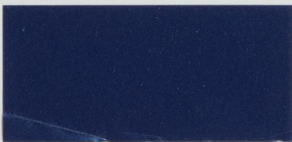
Gitane Blue Clearcoat Metallic XR4Ti, Scorio 0K