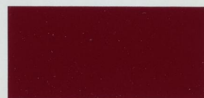
Burgundy Red Scorio 0E