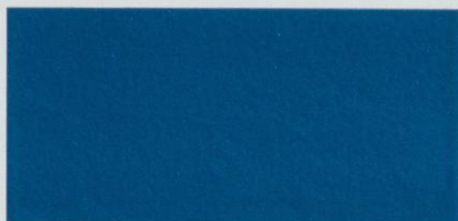
Matisse Blue Clearcoat Metallic XR4Ti A0