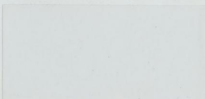
Diamond White XR4Ti, Scorio 0B