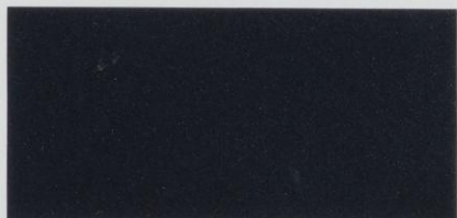
Nautilus-Gray Clearcoat Metallic Scorio AT