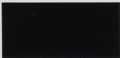
Black XR4Ti, Scorio 0A