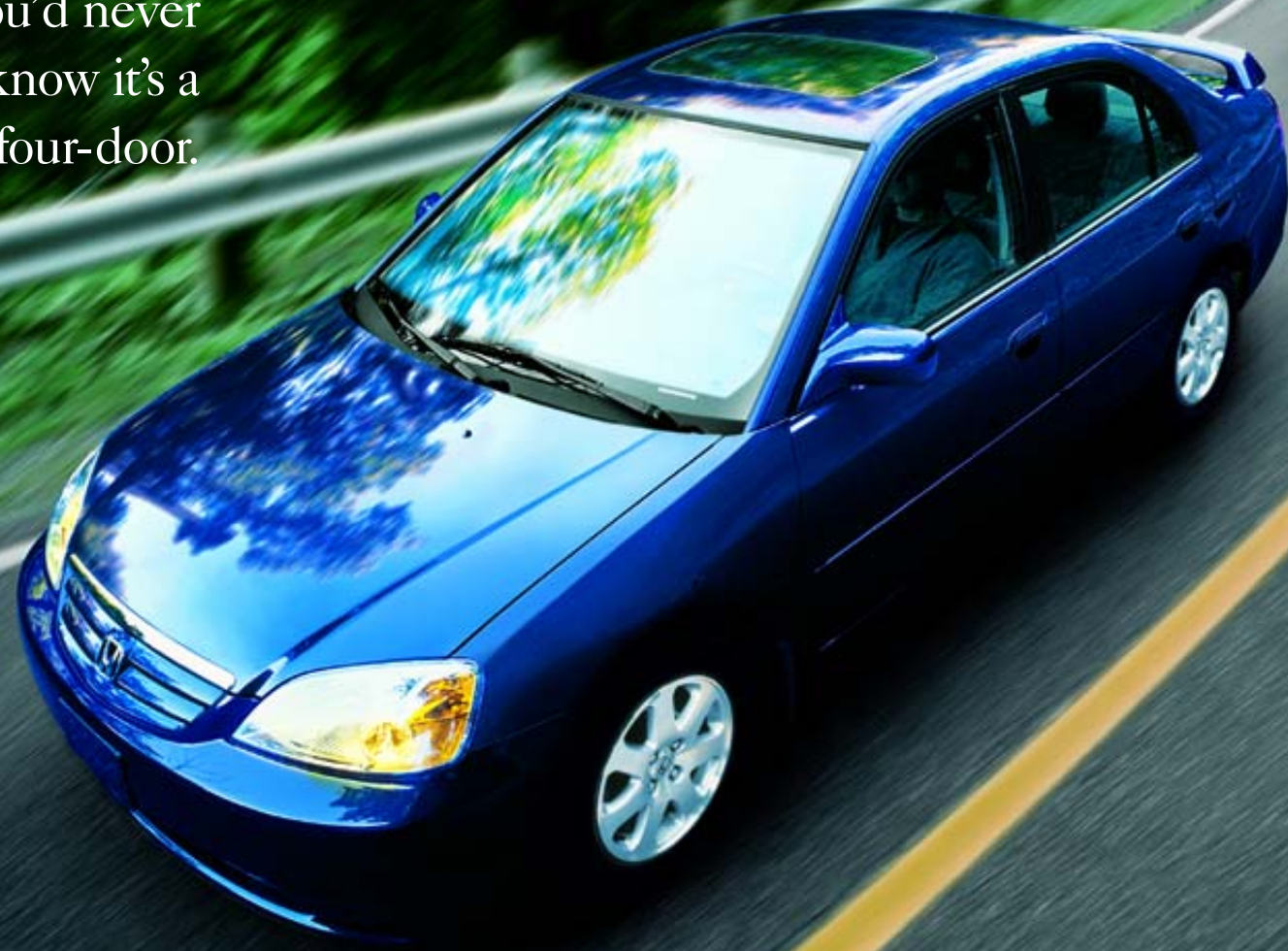
Civic LX-Sport Sedan shown in Eternal Blue Pearl.

From the driver's seat, you'd never know it's a four-door.