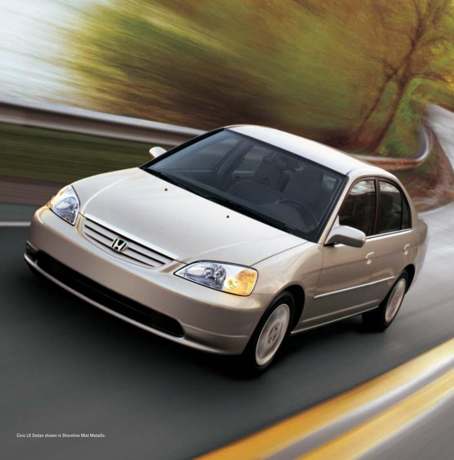
Civic LX Sedan shown in Shoreline Mist Metallic.