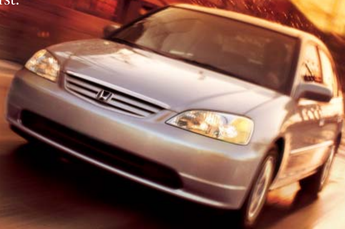
Civic LX Sedan shown in Satin Silver Metallic.