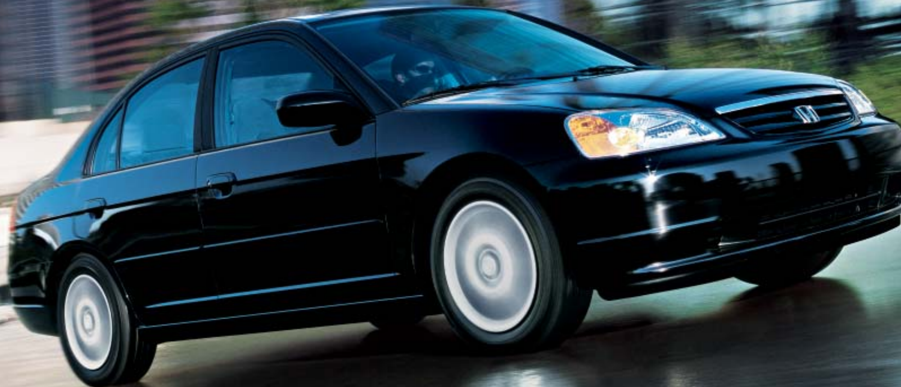
Civic LX Sedan shown in Nighthawk Black Pearl.

that you can count on to get you where you want to go.