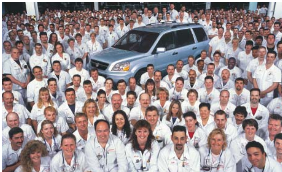
Honda of Canada Mfg. Associates at Pilot Line-Off Ceremony May 2002

WHAT MAKES A HONDA IS WHO MAKES A HONDA. You don't have to go far to find out why Civic Sedan has been the #1 choice of Canadians for four years in a row. The reason is right here in this country, with more than 4,200 world-class Associates and help from dedicated Canadian supplier companies. Today, we produce 390,000 vehicles per year and, since 1986 when we began manufacturing in Canada, we have produced more than two million vehicles. We've also exported our products all over the world, and invested more than 1.7 billion dollars in the Canadian economy, not to mention the significant investments made by our Canadian supplier companies. But most impressive of all, our Associates have earned a first-rate reputation for quality with our customers. That's why our innovative Pilot SUV is also being manufactured here for all of North America and Japan. And why there's one more star in the Honda family that's proud to call Canada "home".