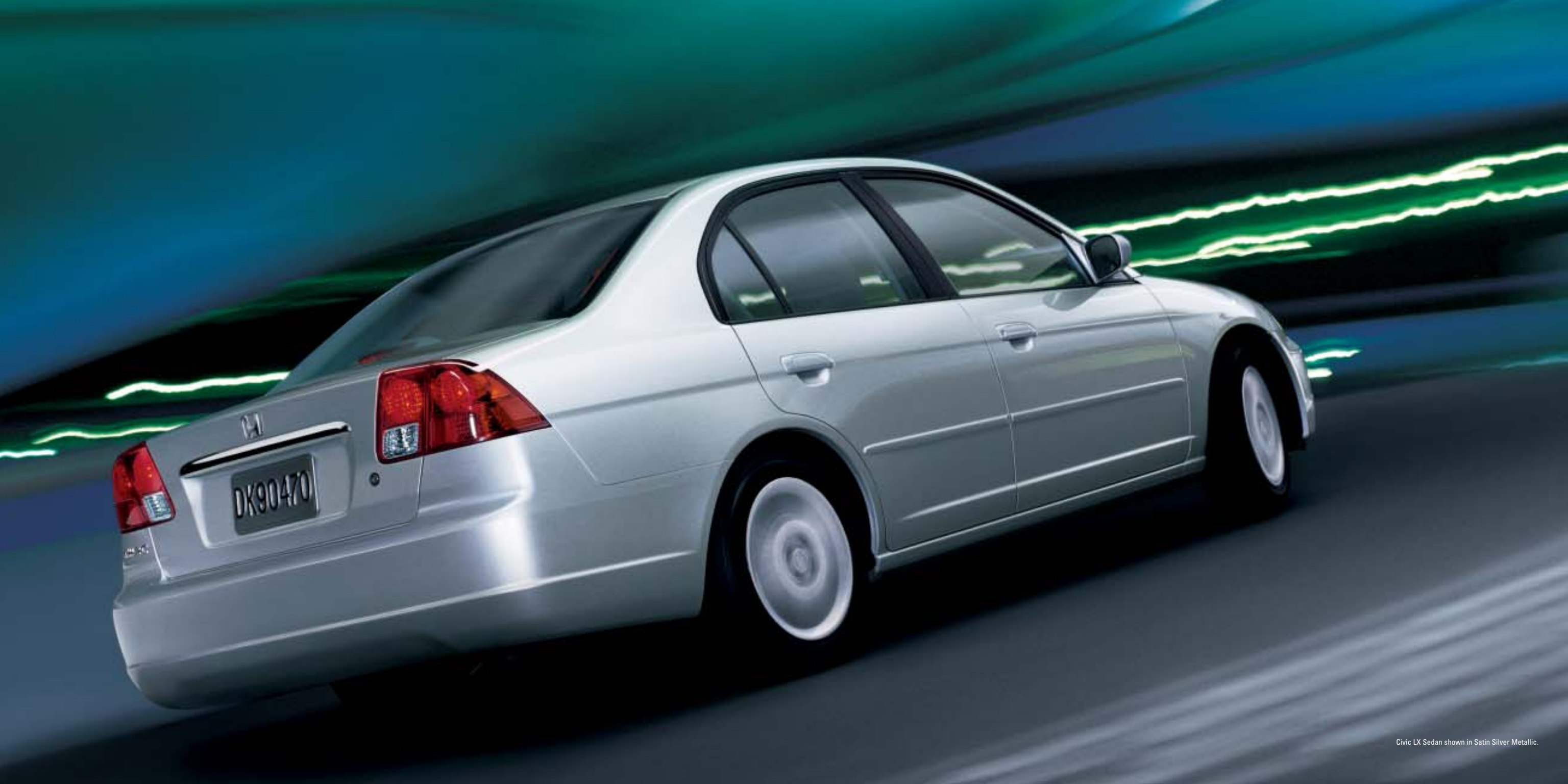
Civic LX Sedan shown in Satin Silver Metallic.