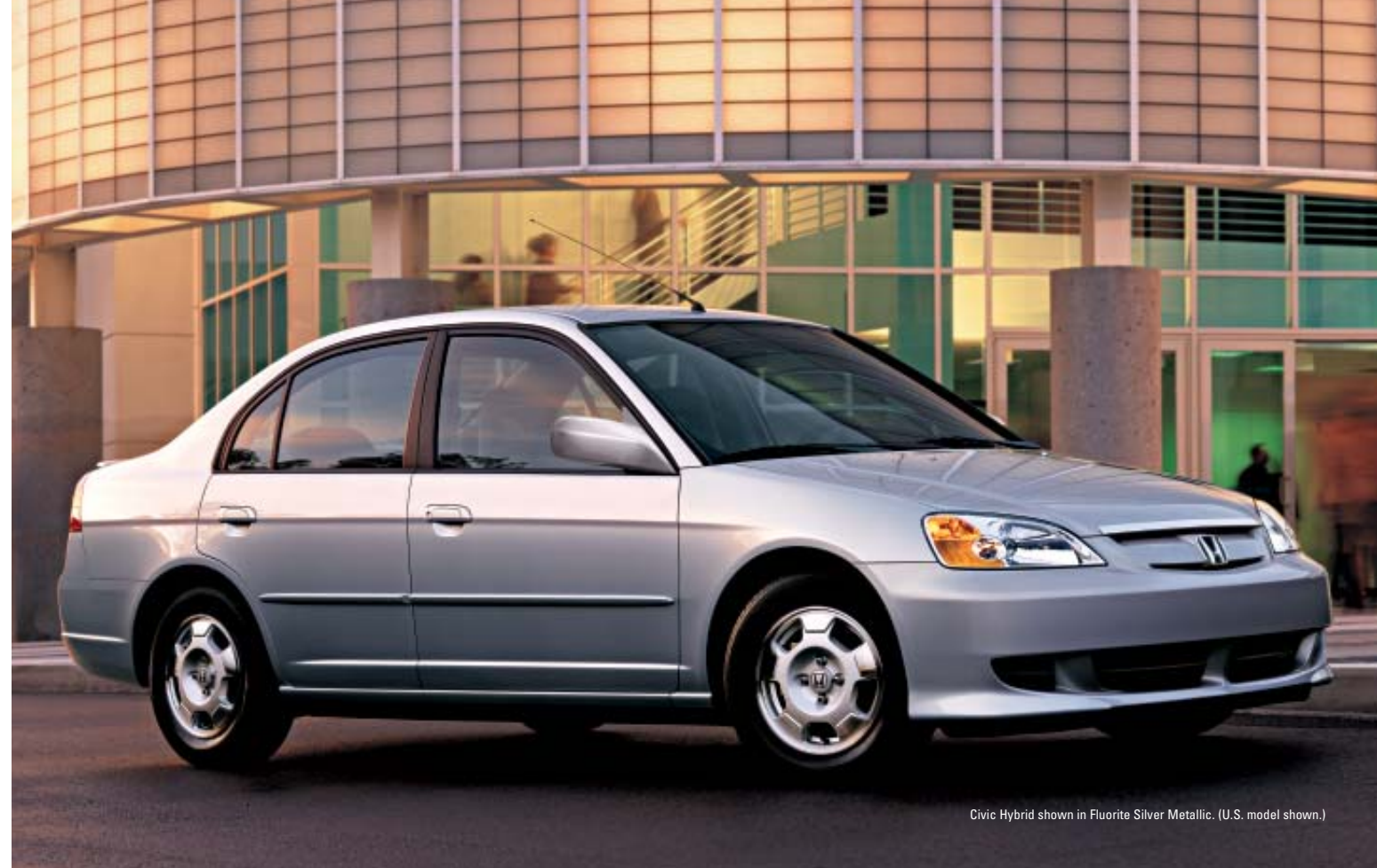
Civic Hybrid shown in Fluorite Silver Metallic. (U.S. model shown.)