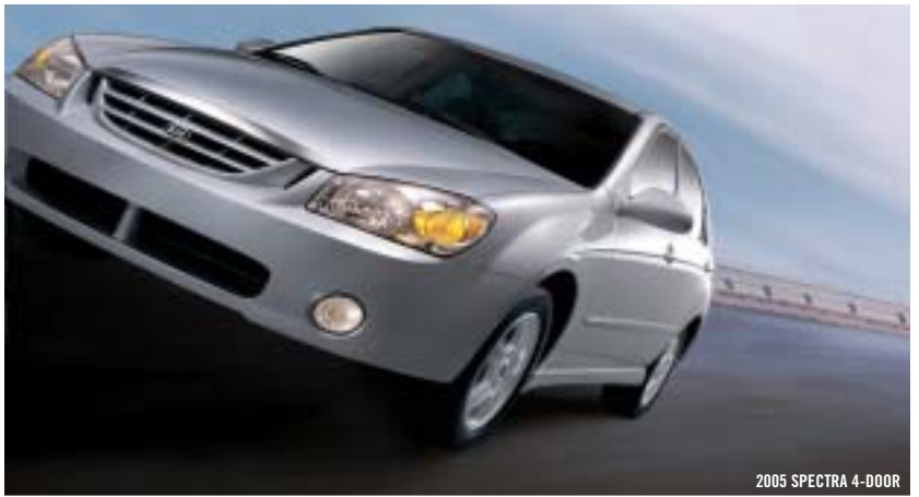
2005 SPECTRA 4-DOOR