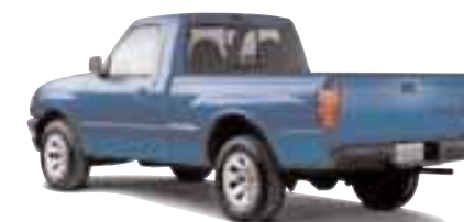
SONIC BLUE METALLIC