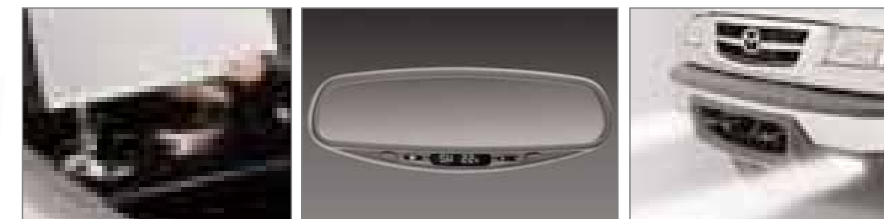
Pictured above from left to right: foldable storage box, electrochromatic mirror w/ compass & temperature, fog lights.