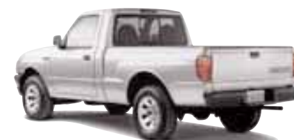
LIGHT SILVER METALLIC