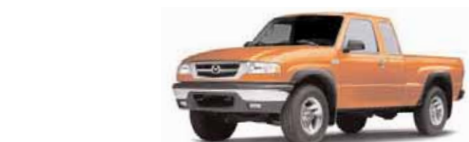
BURNT ORANGE METALLIC*