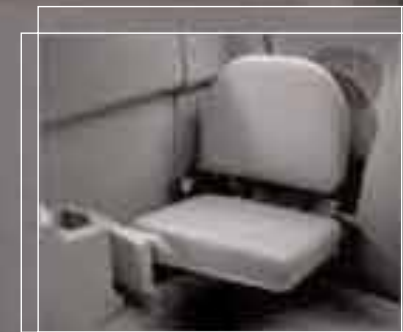
SITTING PRETTY. The Mazda Cab Plus configuration provides a pair of handy, fold-away jump seats that make it easy to accommodate extra passengers or extra gear.

A Mazda B-Series Truck cab gives new meaning to the term “living room.” A CD sound system is standard, as well as tinted glass and a sliding rear window. And to help keep your guests from feeling the summer heat, there’s CFC-free air conditioning (standard on 4.0L models) that’s not only friendly to passengers, but the environment as well. Other thoughtful appointments include: A floor console with dual cup holders. Passenger-assist handles mounted on the A-pillars. Plus a supportive, well-contoured 60/40 split-bench seat that offers quick access to a cargo area big enough to hold weekend luggage. (Contoured bucket seats with a centre console (as shown) are available on the Mazda B4000 SE 4x4.) With accommoda-