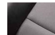
MEDIUM DARK FLINT (SE)