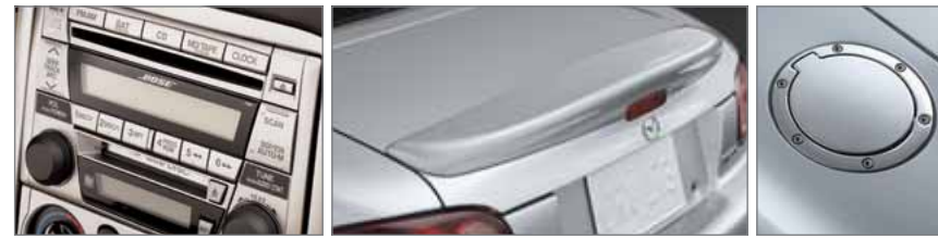
Pictured above from left to right: In-dash 6-disc CD changer, rear lip spoiler, chrome fuel-filler door.