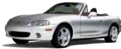
SUNLIGHT SILVER METALLIC