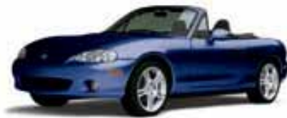
INDIGO BLUE MICA