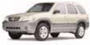
Gold Ash Metallic