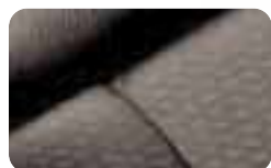
Dark Grey Cloth DX