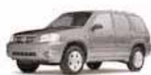
Dark Titanium Metallic