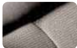
Dark Grey Cloth LX