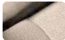
Beige Cloth LX