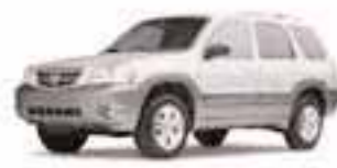
Glacier Silver Metallic