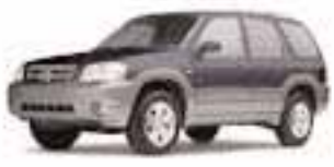
Calypso Blue Metallic