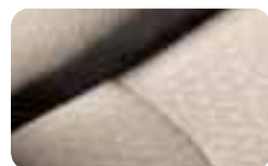
Beige Cloth DX