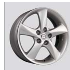
17" alloy wheels