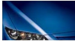
SONIC BLUE METALLIC