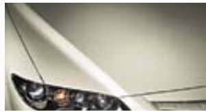
GOLD ASH METALLIC