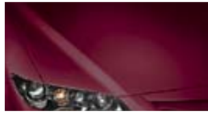
DARK CHERRY MICA