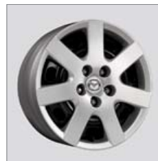
16" steel wheels