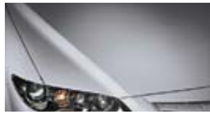
TUNGSTEN GREY METALLIC