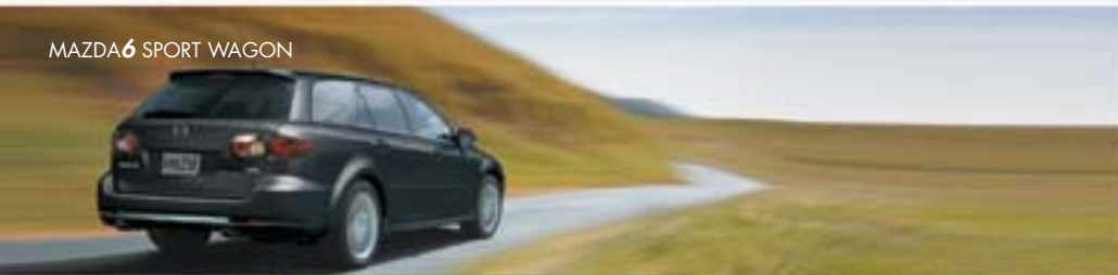
MAZDA6 SPORT WAGON