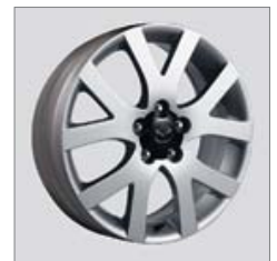
18" alloy wheels