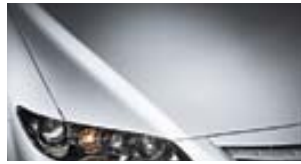
GLACIER SILVER METALLIC