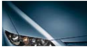
SEA BLUE METALLIC