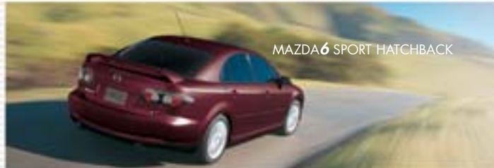
MAZDA6 SPORT HATCHBACK