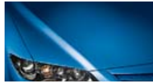
BRIGHT ISLAND BLUE METALLIC