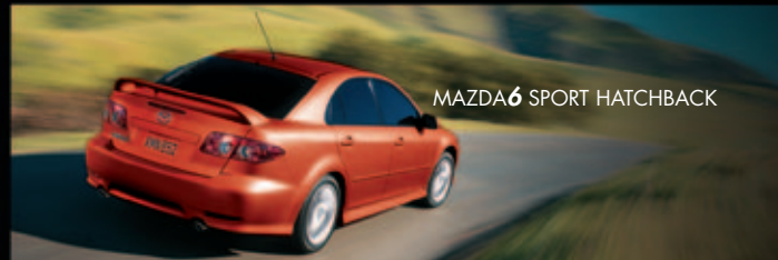
MAZDA6 SPORT HATCHBACK