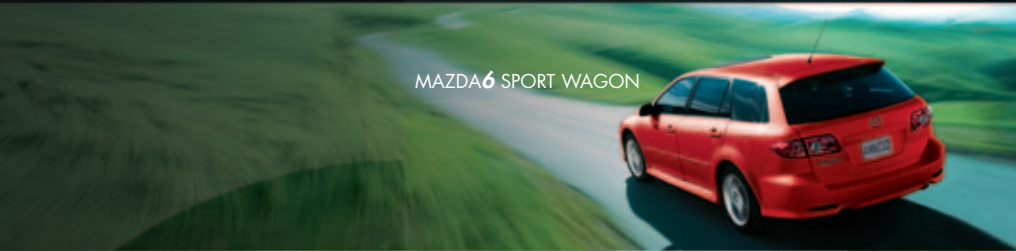
MAZDA6 SPORT WAGON