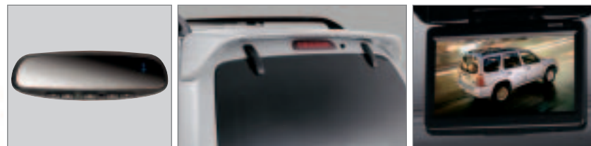
Pictured above from left to right: Auto-dimming mirror with compass, temperature and Homelink®, rear spoiler and DVD entertainment system.