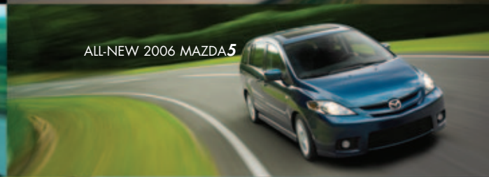
ALL-NEW 2006 MAZDA5