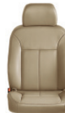
Front bucket seats with leather-appointed seating available in Extended Cab and Crew Cab LT models only. Shown in 313 – Cashmere. Available in 193 – Very Dark Pewter (1).