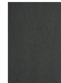
1. 193 – Very Dark Pewter Leather.