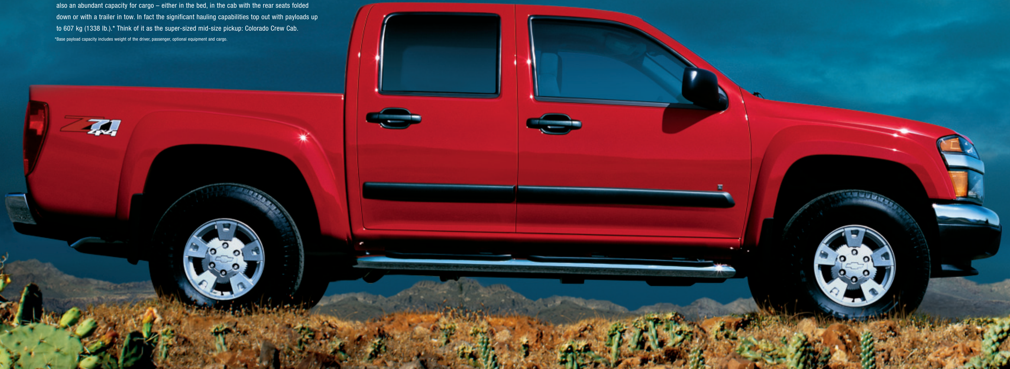
Colorado LT Crew Cab 4x4, shown in Victory Red with available Z71 Off-Road Suspension.

*Base payload capacity includes weight of the driver, passenger, optional equipment and cargo.