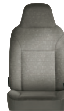
LS cloth 60/40 front split-bench seat included in all LS models. Shown in 92D – Medium Pewter.