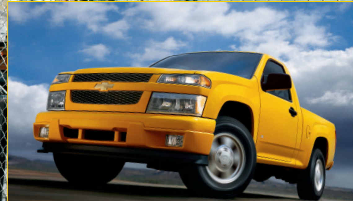
Colorado LT Regular Cab, shown in Flame Yellow with available Body-Coloured Appearance Package.