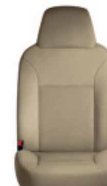
Deluxe cloth 60/40 front split-bench seat included in all LT Regular and Extended Cab models with Z85 or Z71 suspension. Shown in 31J – Cashmere. Also available in 19J – Very Dark Pewter.