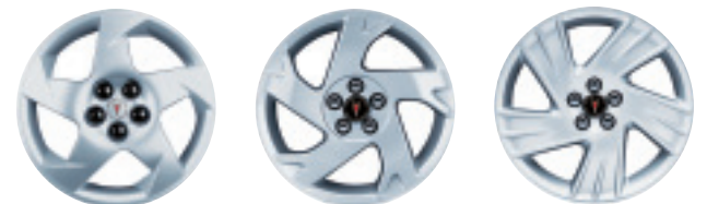
A – 16" steel, bolt-on wheel cover B – 16" aluminum wheel C – 17" aluminum wheel