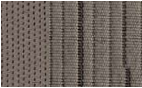
Medium Stone Cloth Standard on SES