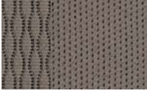
Medium Stone Cloth Standard on S, SE and Sport Appearance Package