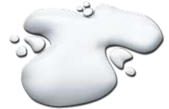
Cloud 9 White