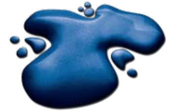
Vista Blue Metallic