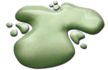
Kiwi Green Metallic