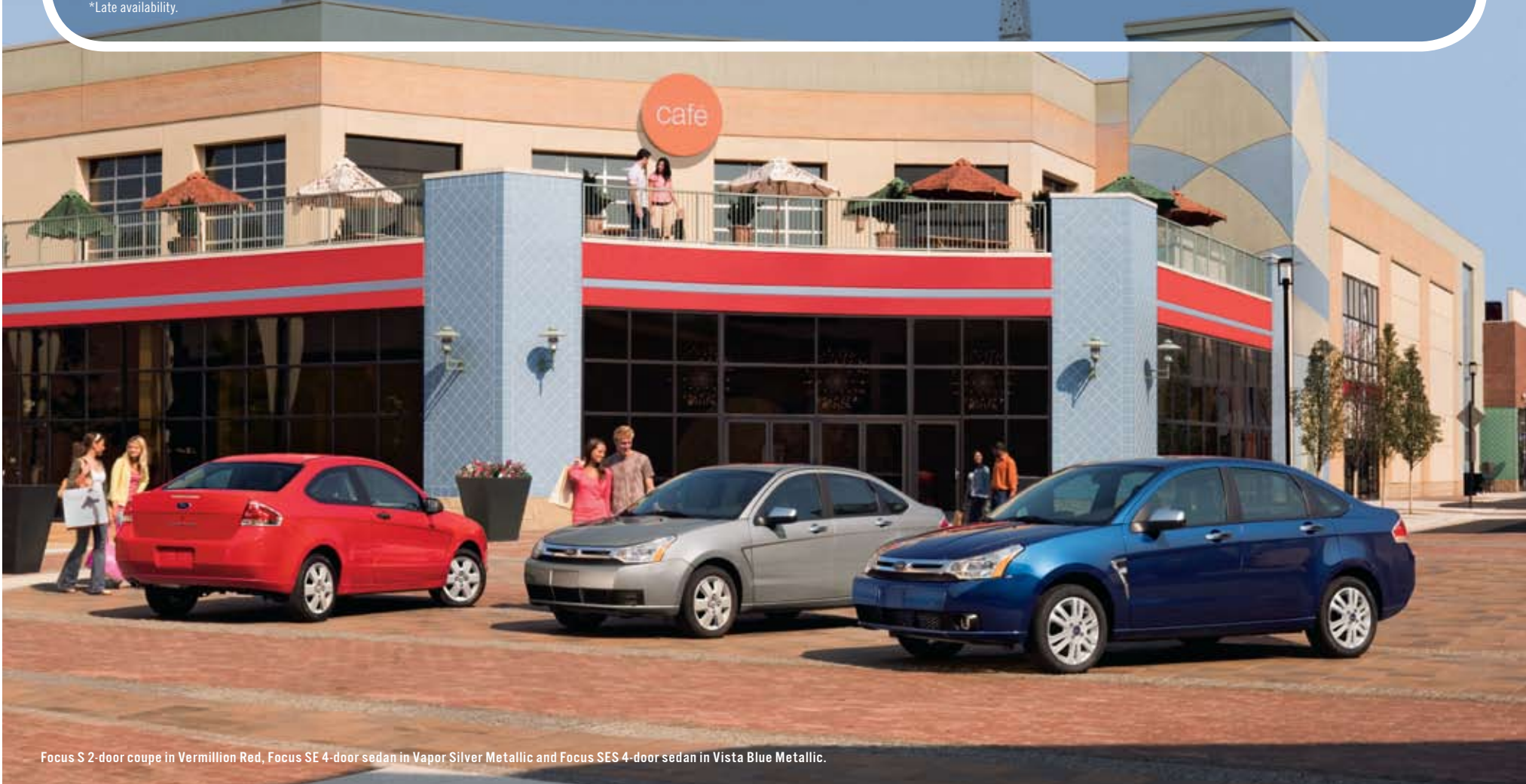
Focus S 2-door coupe in Vermillion Red, Focus SE 4-door sedan in Vapor Silver Metallic and Focus SES 4-door sedan in Vista Blue Metallic.