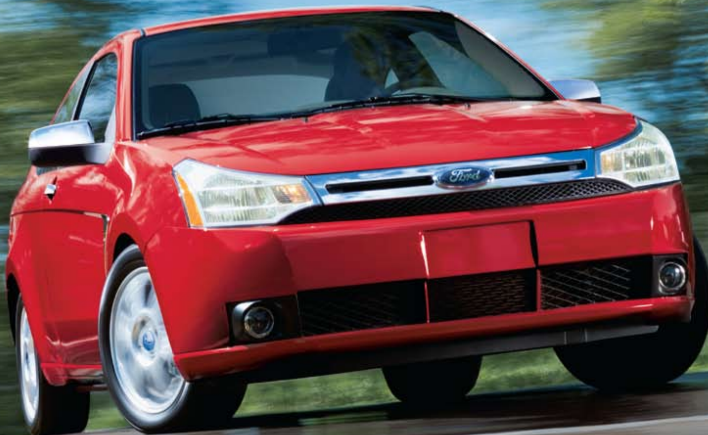
Focus SES 2-door coupe in Vermillion Red.

Since its debut, Focus has been widely hailed for its impressive response and impeccable road manners that put it in a league by itself. Now it's leaner, with sharper steering and handling. The European-inspired suspensions – both standard and enhanced – were optimized. Re-tuned springs and shocks, new jounce bumpers and a bigger front stabilizer bar combine for a dynamic driving treat.