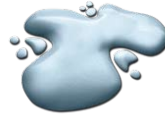
Light Ice Blue Metallic