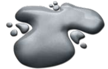
Vapor Silver Metallic