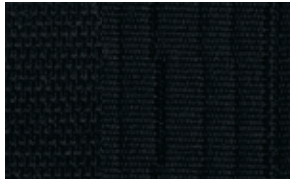
Charcoal Black Cloth Standard on SES