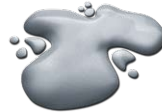
Silver Frost Metallic