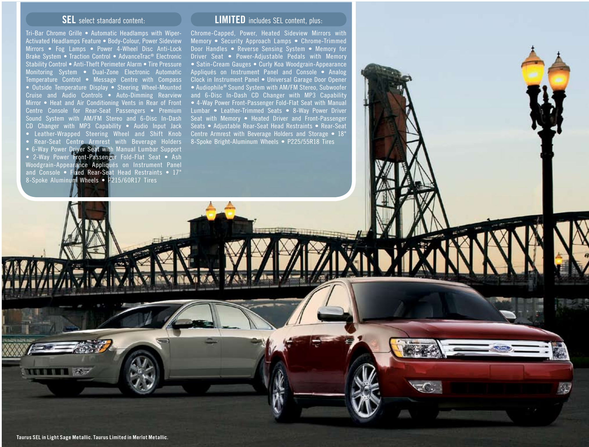
Taurus SEL in Light Sage Metallic. Taurus Limited in Merlot Metallic.

Chrome-Capped, Power, Heated Sideview Mirrors with Memory • Security Approach Lamps • Chrome-Trimmed Door Handles • Reverse Sensing System • Memory for Driver Seat • Power-Adjustable Pedals with Memory • Satin-Cream Gauges • Curly Koa Woodgrain-Appearance Appliqués on Instrument Panel and Console • Analog Clock in Instrument Panel • Universal Garage Door Opener • Audiophile® Sound System with AM/FM Stereo, Subwoofer and 6-Disc In-Dash CD Changer with MP3 Capability • 4-Way Power Front-Passenger Fold-Flat Seat with Manual Lumbar • Leather-Trimmed Seats • 8-Way Power Driver Seat with Memory • Heated Driver and Front-Passenger Seats • Adjustable Rear-Seat Head Restraints • Rear-Seat Centre Armrest with Beverage Holders and Storage • 18" 8-Spoke Bright-Aluminum Wheels • P225/55R18 Tires