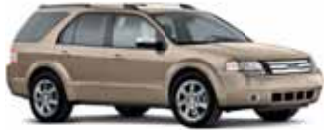
Dune Pearl Metallic