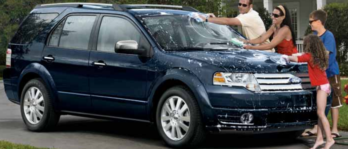
Taurus X Limited in Dark Ink Blue Metallic.