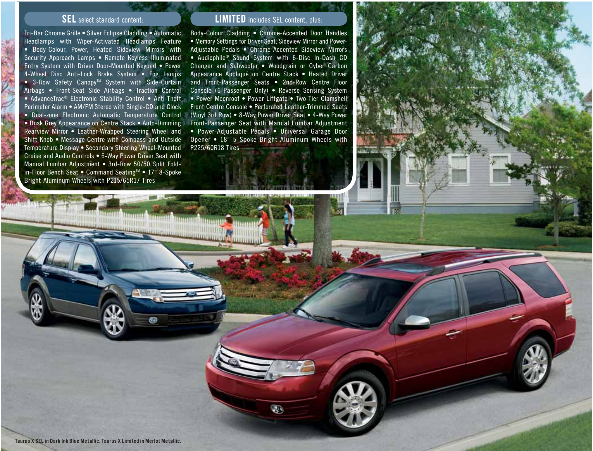
Taurus X SEL in Dark Ink Blue Metallic. Taurus X Limited in Merlot Metallic.

Body-Colour Cladding • Chrome-Accented Door Handles • Memory Settings for Driver Seat, Sideview Mirror and Power-Adjustable Pedals • Chrome-Accented Sideview Mirrors • Audiophile® Sound System with 6-Disc In-Dash CD Changer and Subwoofer • Woodgrain or Cyber Carbon Appearance Appliqué on Centre Stack • Heated Driver and Front-Passenger Seats • 2nd-Row Centre Floor Console (6-Passenger Only) • Reverse Sensing System • Power Moonroof • Power Liftgate • Two-Tier Clamshell Front Centre Console • Perforated Leather-Trimmed Seats (Vinyl 3rd Row) • 8-Way Power Driver Seat • 4-Way Power Front-Passenger Seat with Manual Lumbar Adjustment • Power-Adjustable Pedals • Universal Garage Door Opener • 18" 5-Spoke Bright-Aluminum Wheels with P225/60R18 Tires