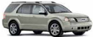
Light Sage Metallic