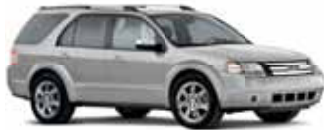
Silver Birch Metallic