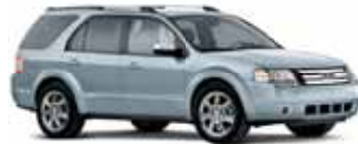
Light Ice Blue Metallic