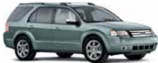
Titanium Green Metallic