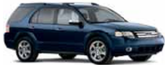
Dark Ink Blue Metallic