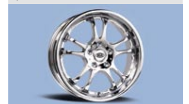
Jazz Chrome Finish Alloy Wheel