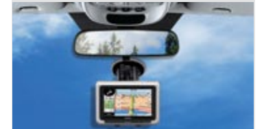
Clarion N.I.C.E 430 GPS