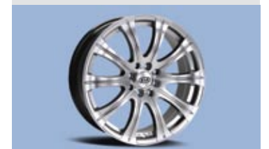
Panic Titanium Finish Alloy Wheel