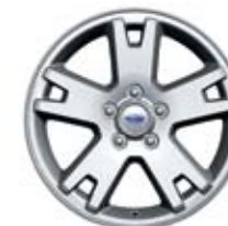
17-in. Machined-Aluminum Optional on XLT