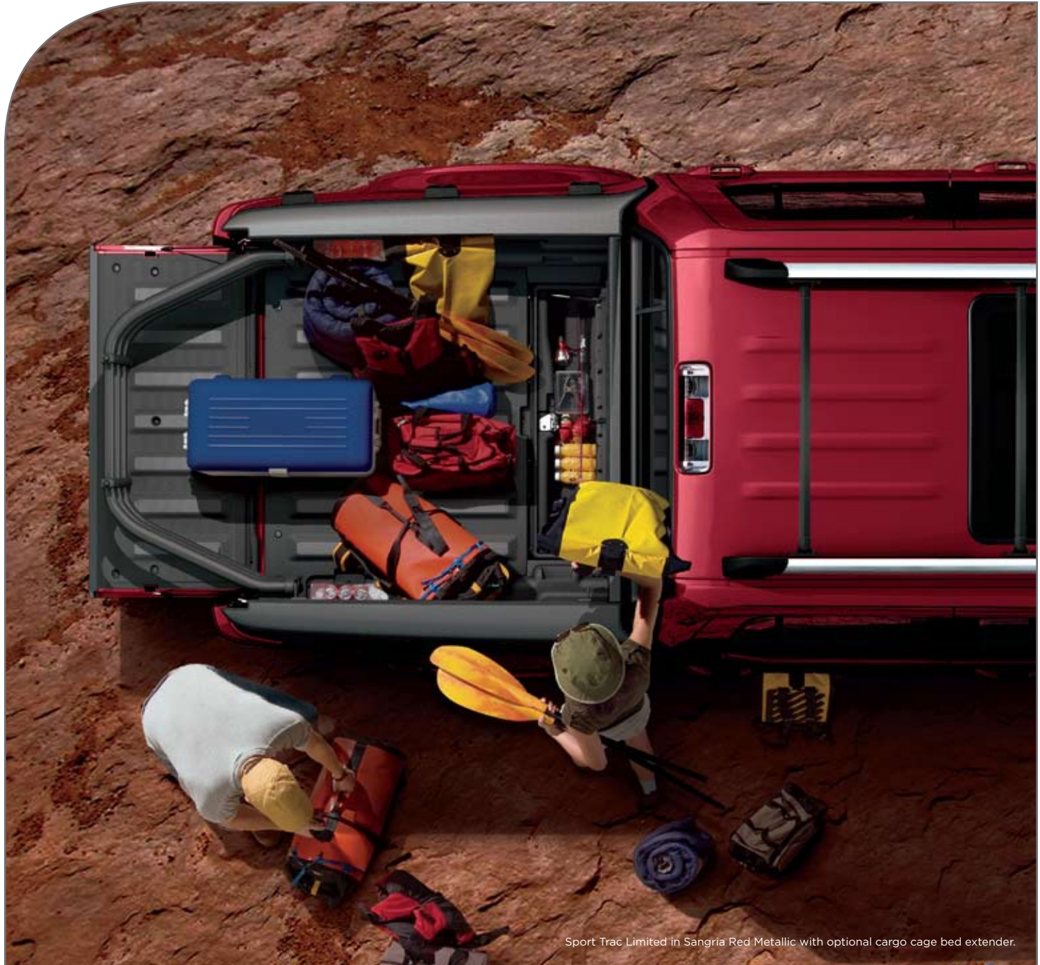
Sport Trac Limited in Sangria Red Metallic with optional cargo cage bed extender.