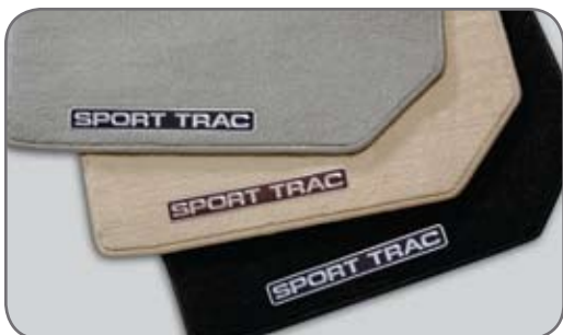
Premium carpeted floor mats

Ford ESP PremiumCare Plan. Depending on the Ford ESP Plan you select, some Dealer-installed Genuine Ford Accessories can be covered up to 7 years or 150,000 km. See your Ford of Canada Dealer for details.