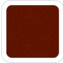
Dark Copper Metallic