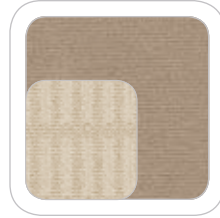
Camel Cloth with Sand Inserts Standard on XLT