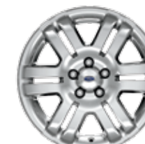
18-in. Chrome-Clad Aluminum Included in Limited Chrome Package