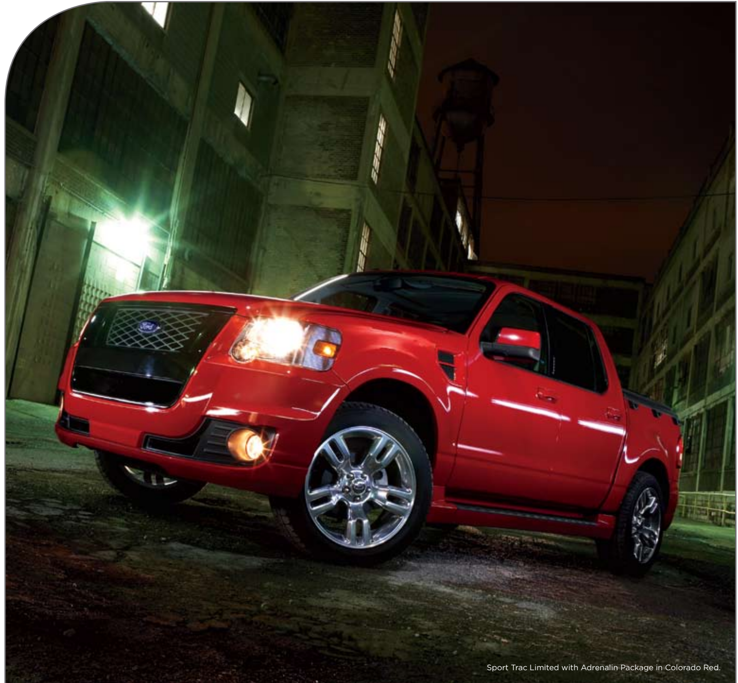
Sport Trac Limited with Adrenalin Package in Colorado Red.

The available V8 engine provides an impressive 292 hp and 300 lb.-ft. of torque. It's mated to a 6-speed automatic transmission that keeps you in the right gear at the right time for towing or carrying big loads.