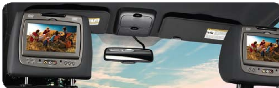
Dual INVISION DVD Headrests 1