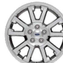
18-in. Machined-Aluminum Standard on Limited