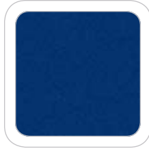
Sport Blue Metallic