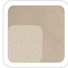
Camel Leather with Sand Inserts Standard on Limited