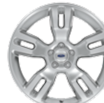
20-in. Polished-Aluminum Included in Adrenalin Package