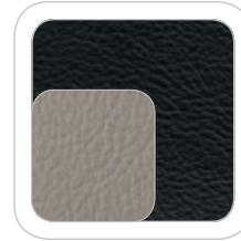
Dark Charcoal Leather with Medium Light Stone Inserts Standard on Limited