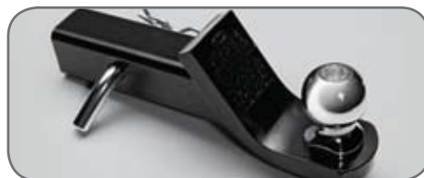
Trailer hitch balls/draw bars