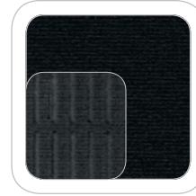
Dark Charcoal Cloth Standard on XLT