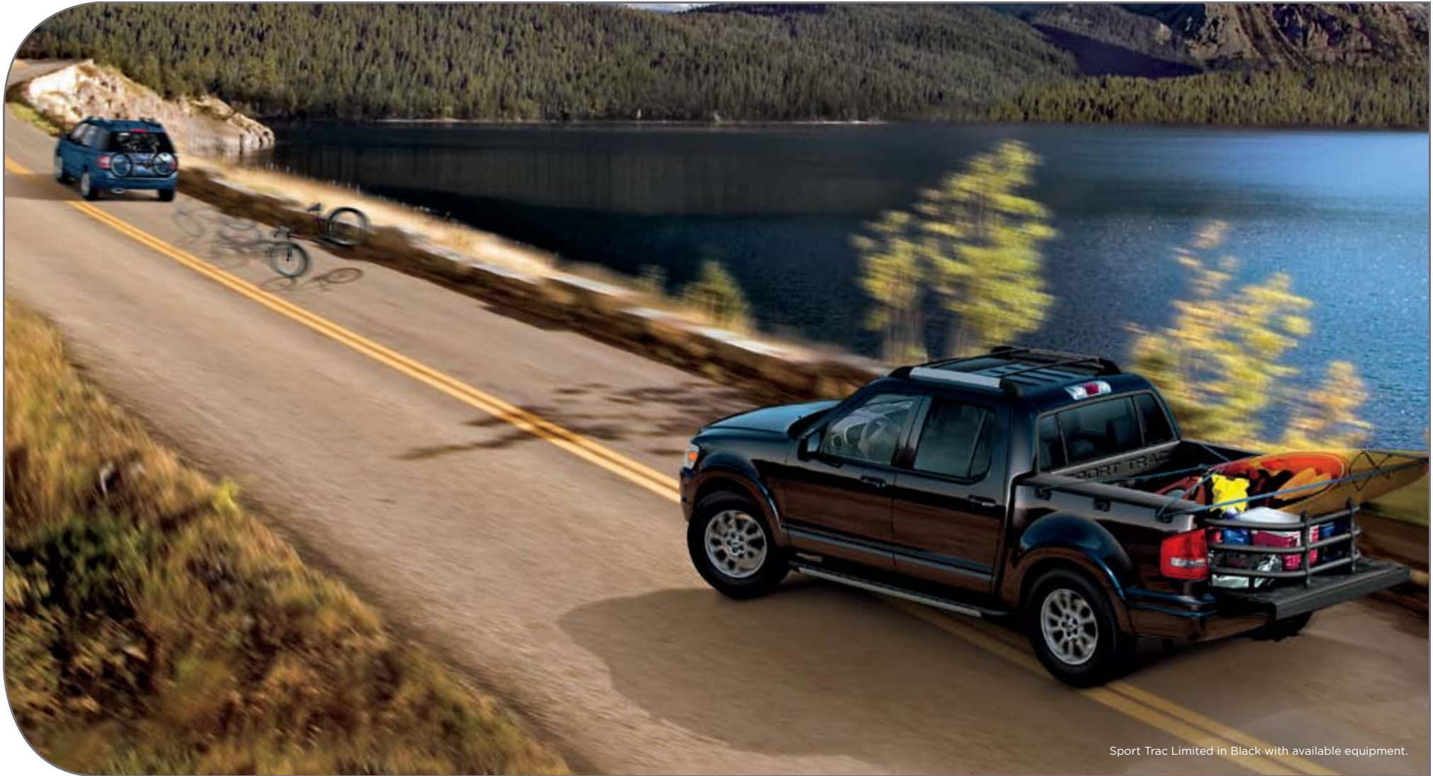
Sport Trac Limited in Black with available equipment.

Driving to your adventure shouldn't be one.