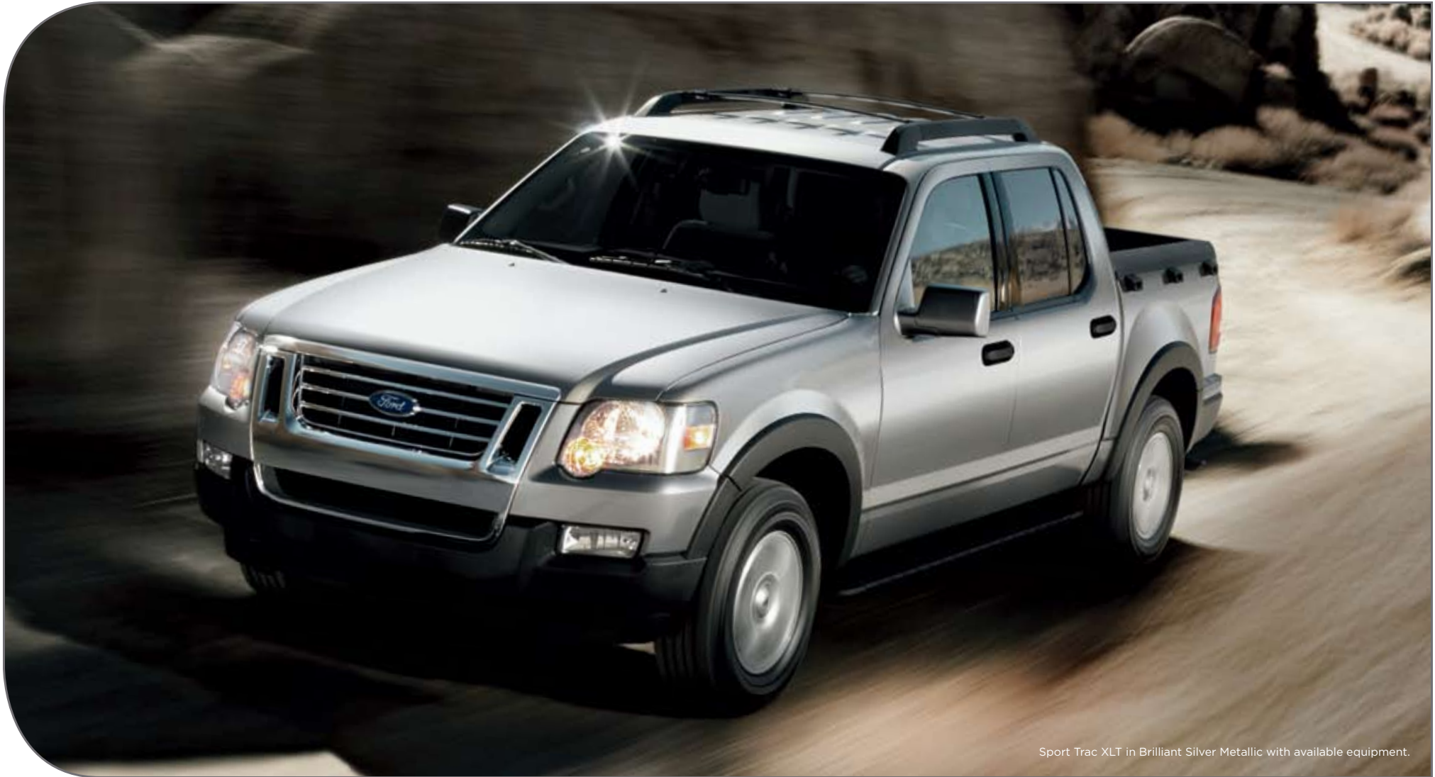
Sport Trac XLT in Brilliant Silver Metallic with available equipment.

The unique design of Sport Trac makes it ideal for taking your bikes to the trail or jet skis to the lake, and you'll get there in total comfort. Of course, it's a Ford SUV, so it's built to handle whatever lies ahead.