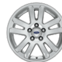
17-in. Painted Cast-Aluminum Standard on XLT