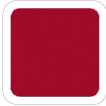
Sangria Red Metallic