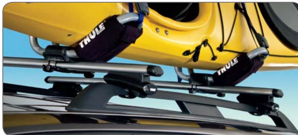
Thule racks 1