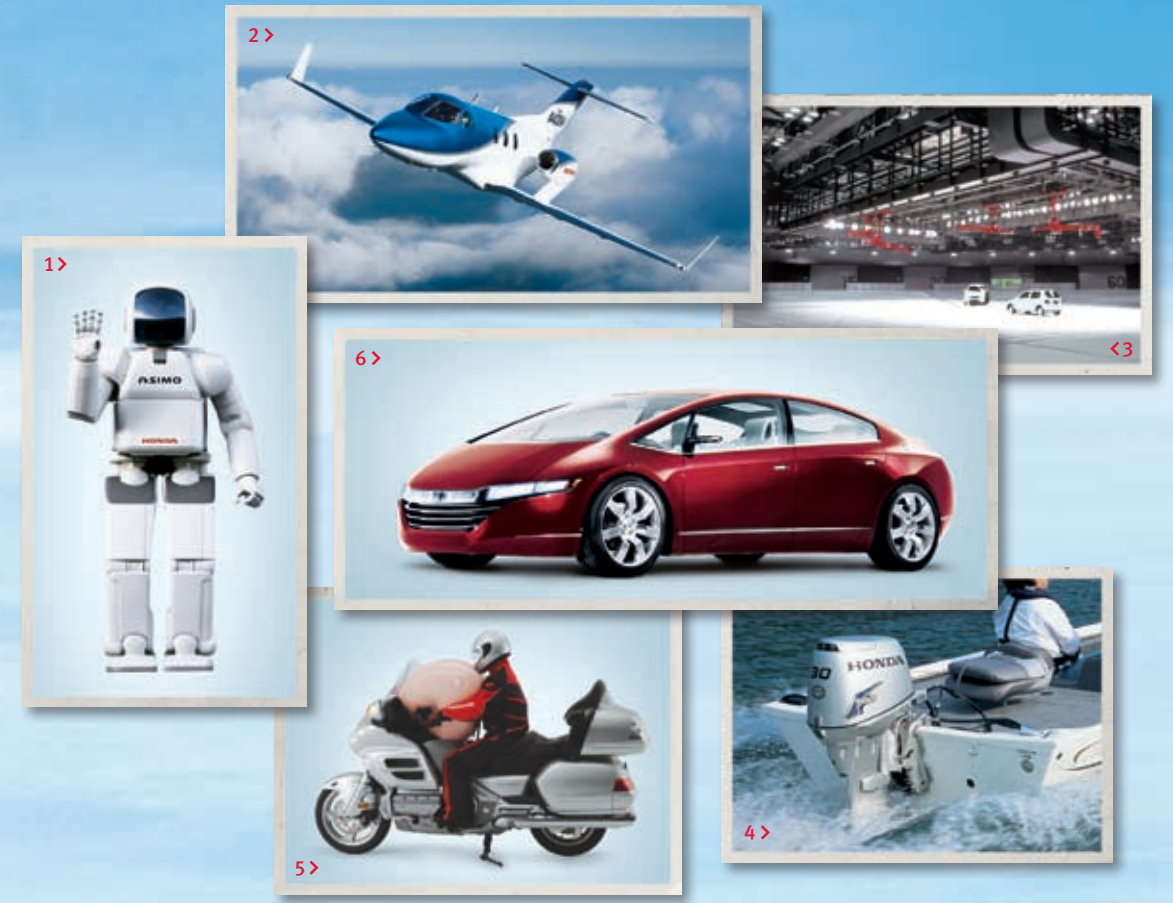
1> ASIMO™, the advanced life-assisting humanoid robot 2> The high-speed, fuel-efficient HondaJet 3> Honda's advanced safety research and development facility in Tochigi, Japan 4> First manufacturer of a full line of cleaner 4-stroke outboard motors 5> The world's first motorcycle safety airbag 6> The Zero-Emission Honda FCX™ Clarity

As the world's largest engine manufacturer, Honda has a tradition of turning innovative ideas into products that help make our world greener, safer and a little more fun. These products are equipped with some of the cleanest, most fuel-efficient engines you'll find on the road, in the water or high above the clouds. And as technically ingenious as these products are, they are all brought to life by The Power of Dreams.