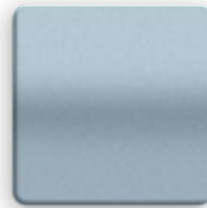
MOONLIGHT BLUE Interior: Black cloth or Black Leather (Not available on Sport Model)

Our vivid palette of exterior colours is the perfect way to complete your Elantra. Explore the options and choose the one that best reflects your personal style.