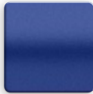
INDIGO BLUE Interior: Black cloth or Black Leather