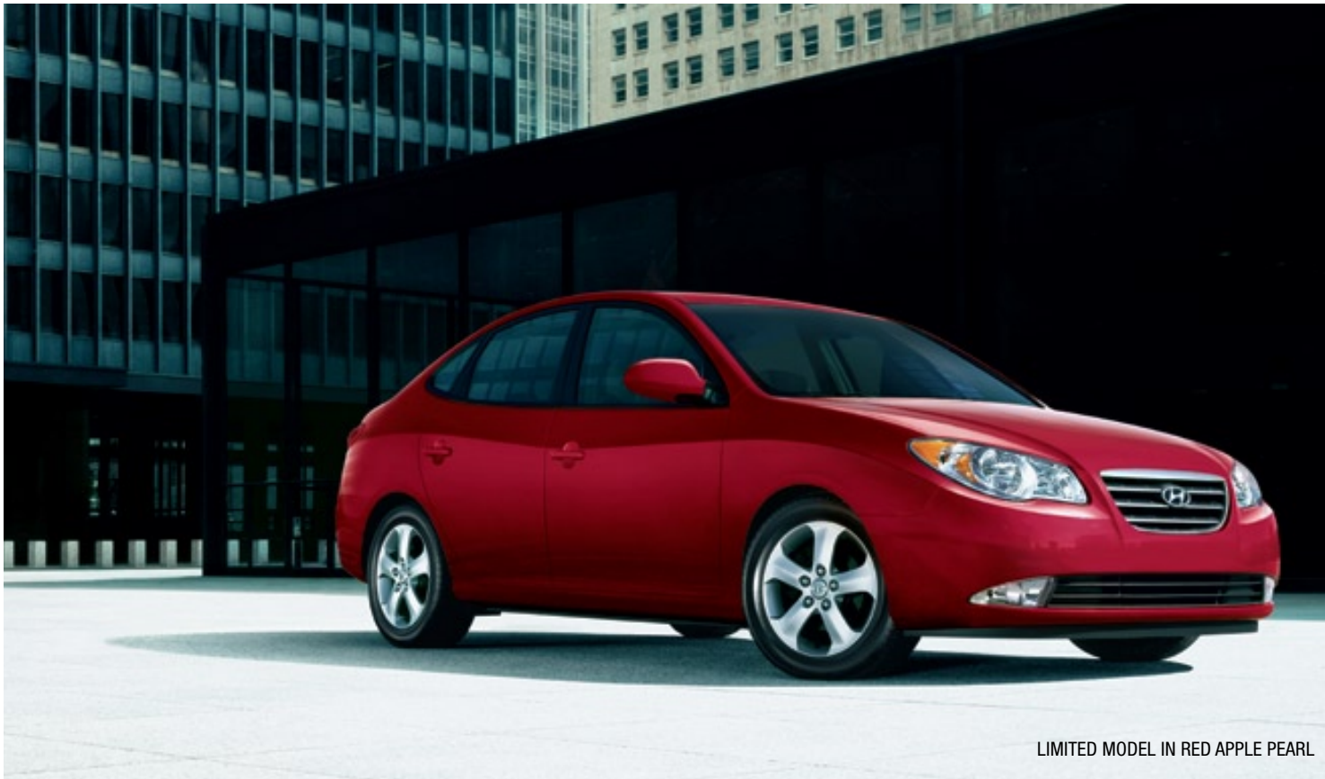
LIMITED MODEL IN RED APPLE PEARL