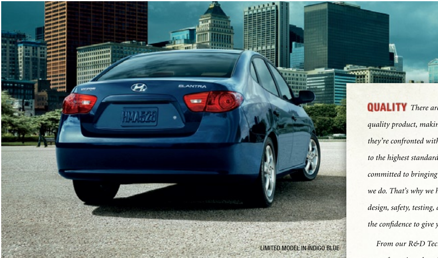
LIMITED MODEL IN INDIGO BLUE

QUALITY There are a lot of companies that claim to build a quality product, making it hard for consumers to know when they're confronted with the real thing. By definition, quality refers to the highest standards. At Hyundai Auto Canada Corp., we are committed to bringing you the highest standards in everything we do. That's why we have invested billions of dollars into research, design, safety, testing, and manufacturing. And it's how we have the confidence to give you one of the best warranties in the industry.