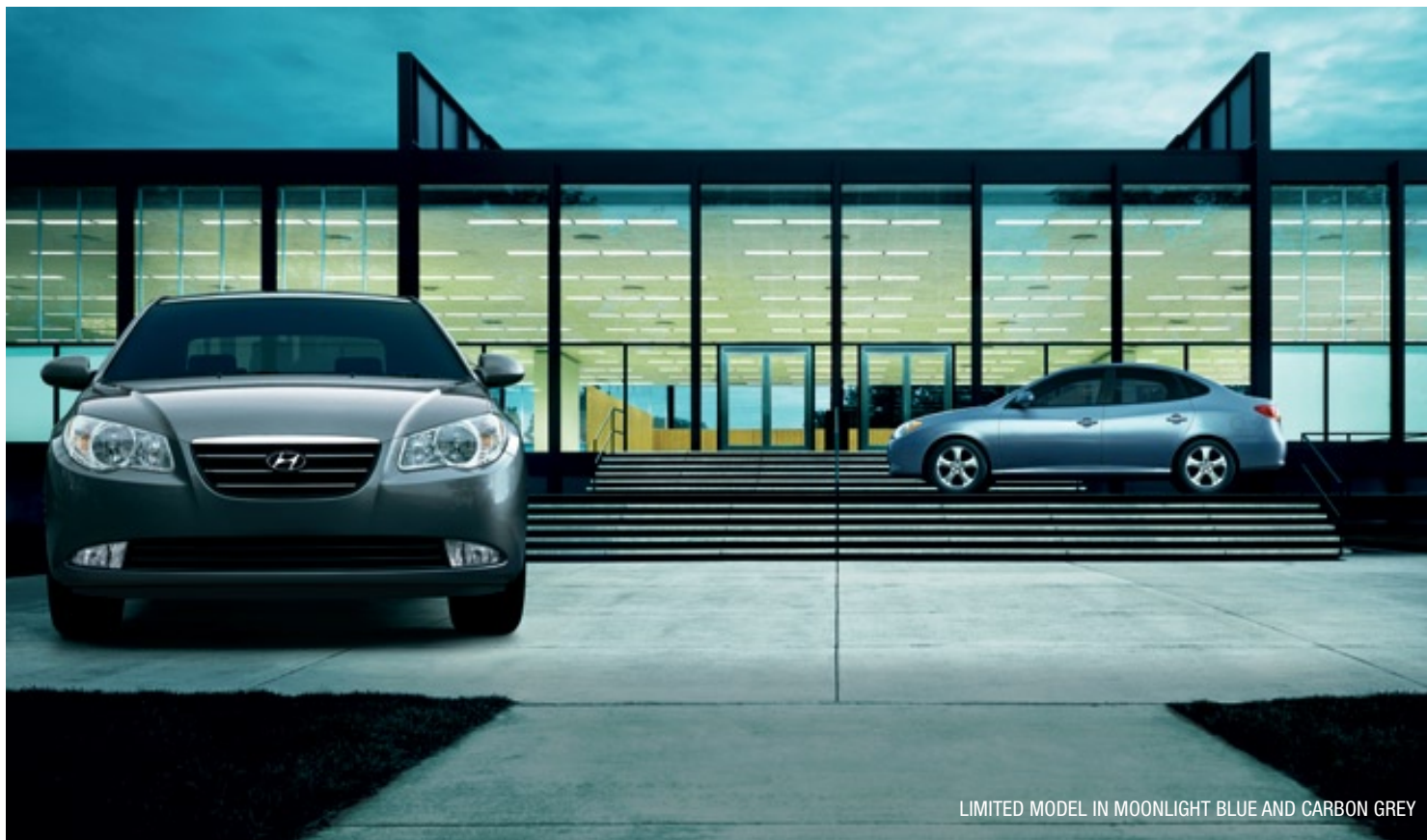
LIMITED MODEL IN MOONLIGHT BLUE AND CARBON GREY