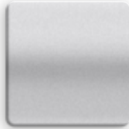
CONTINENTAL SILVER Interior: Black cloth or Black Leather