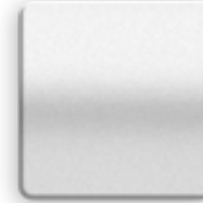
CAPTIVA WHITE Interior: Black cloth or Black Leather