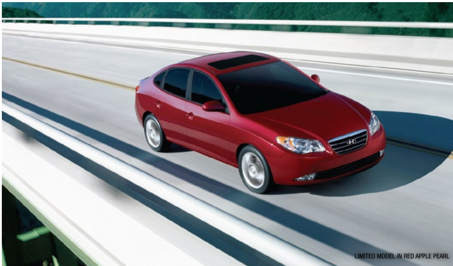
LIMITED MODEL IN RED APPLE PEARL