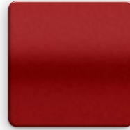
RED APPLE PEARL Interior: Black cloth or Black Leather