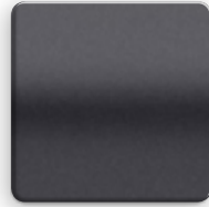
CARBON GREY Interior: Black cloth or Black Leather

Our vivid palette of exterior colours is the perfect way to complete your Elantra. Explore the options and choose the one that best reflects your personal style.