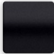
BLACK PEARL Interior: Black cloth or Black Leather