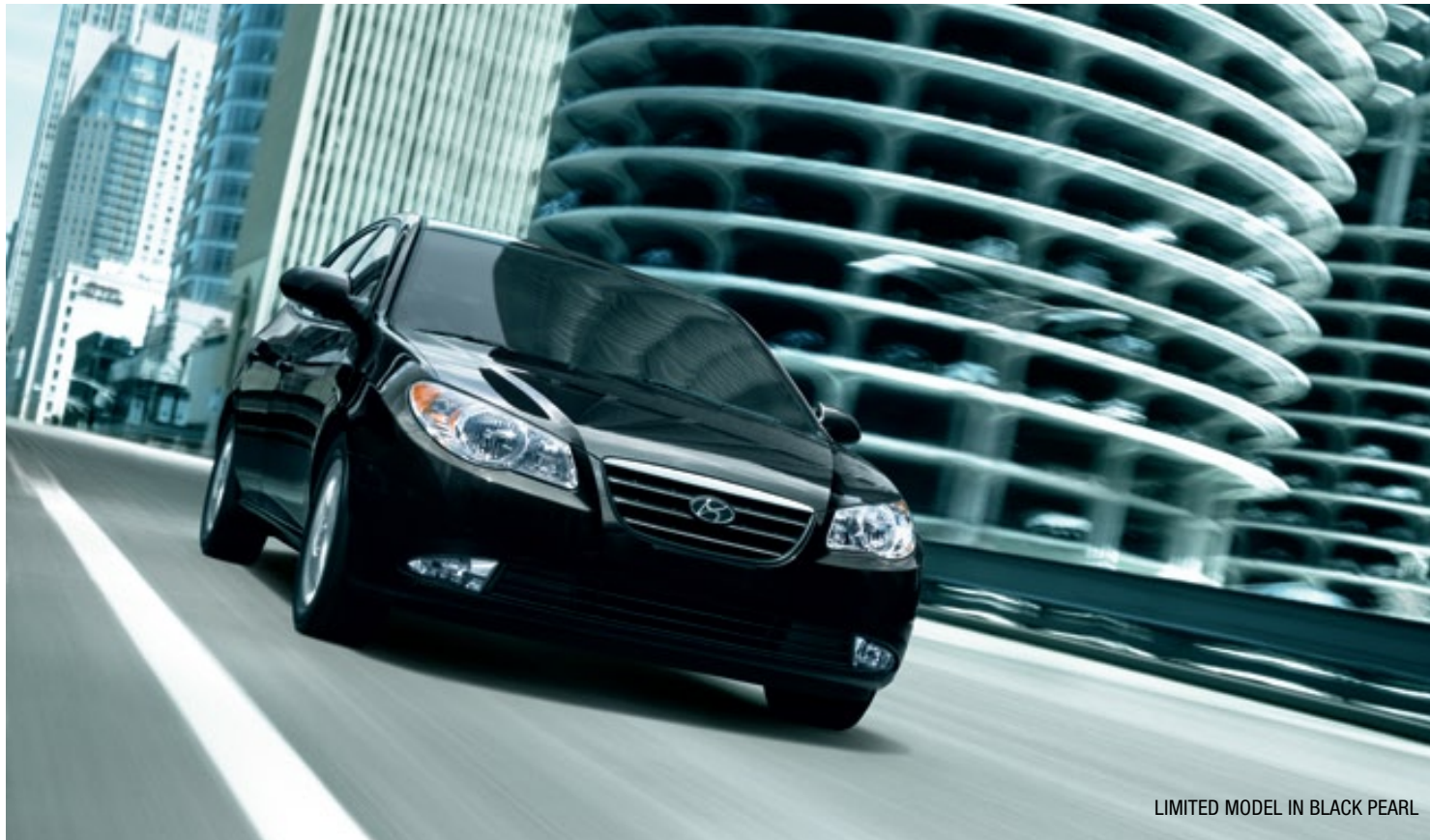
LIMITED MODEL IN BLACK PEARL