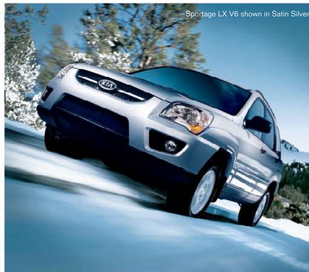
Sportage LX V6 shown in Satin Silver

STEPTRONIC SEQUENTIAL SHIFTING The available 4-speed automatic transmission comes with a sequential shift mode for sporty, on-the-fly shifting.