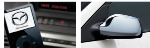
Pictured above from left to right: iPod® adapter2, Door mirror garnish - Chrome.