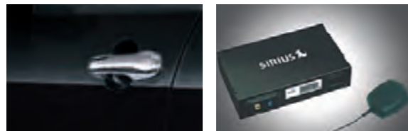
Pictured above from left to right: Door handle cover - Chrome, SIRIUS Satellite Radio.