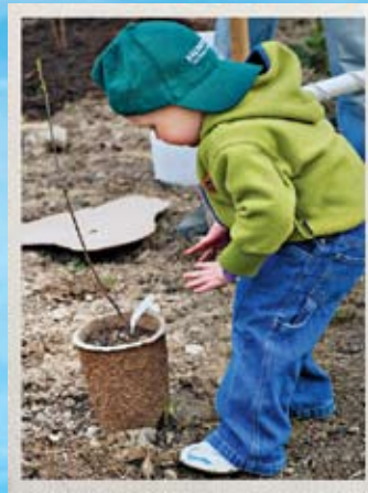
Honda associates and families have helped plant more than 71,000 trees in Canada over the last 5 years.

As the world's largest engine manufacturer, Honda has a proud tradition of turning innovative ideas into products that help make Canada and the world around us brighter and a little more fun. These products are equipped with some of the cleanest, most fuel-efficient engines you'll find on the road, in the water or high above the clouds. And as technically ingenious as these products are, they are all brought to life by The Power of Dreams®.