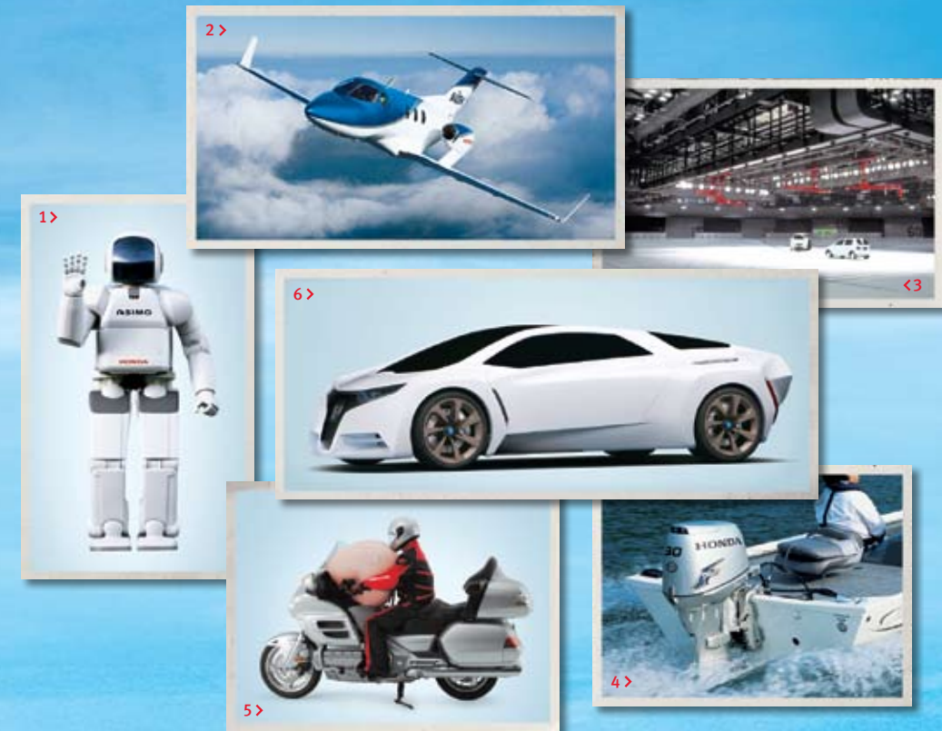
1> ASIMO™, the advanced life-assisting humanoid robot 2> The high-speed, fuel-efficient HondaJet™ 3> Honda's advanced safety research and development facility in Tochigi, Japan 4> First manufacturer of a full line of cleaner 4-stroke outboard motors 5> The world's first motorcycle safety airbag 6> The Honda FC Sport, our advanced hydrogen fuel-cell concept vehicle

As the world's largest engine manufacturer, Honda has a proud tradition of turning innovative ideas into products that help make Canada and the world around us brighter and a little more fun. These products are equipped with some of the cleanest, most fuel-efficient engines you'll find on the road, in the water or high above the clouds. And as technically ingenious as these products are, they are all brought to life by The Power of Dreams®.