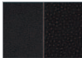
Cocoa Black Cloth/Leather*