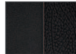
Cocoa Black Leather