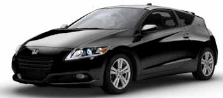
CR-Z PREMIUM PACKAGE