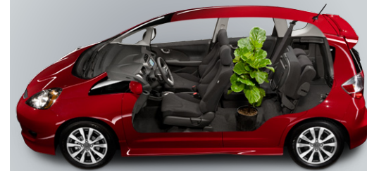
U.S. model shown.