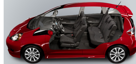
U.S. model shown.