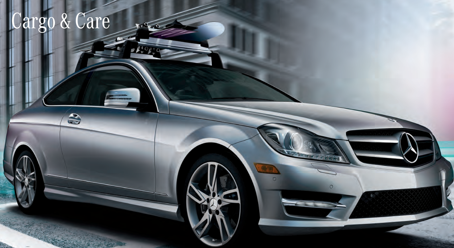
Roof Rack Basic Carrier (Ski Holder configuration shown)