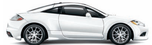
Eclipse GT-P Coupe with optional equipment and accessories.