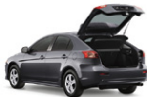
Titanium Grey Metallic Black Interior