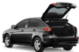
Tarmac Black Pearl Black Interior