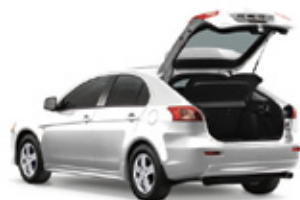
Wicked White Black Interior