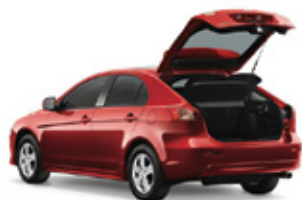
Rally Red Metallic Black Interior