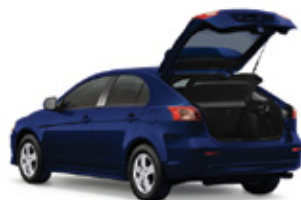
Cosmic Blue Metallic Black Interior