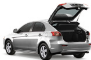
Apex Silver Metallic Black Interior