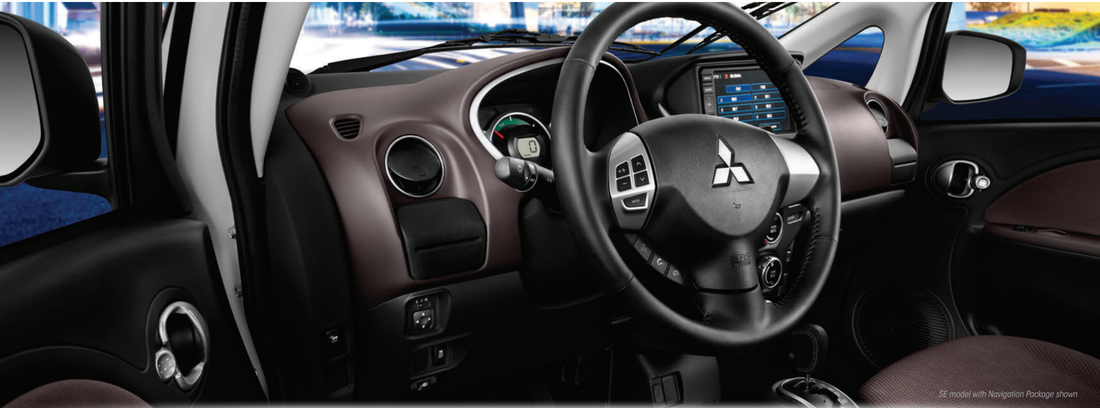
SE model with Navigation Package shown

Thanks to the arched roof and long wheelbase created by the i-MiEV's rearmidship layout, four adults can easily ride in comfort. Even with four passengers, there is plenty of cargo room to spare, so you can share the fun and take it all with you.