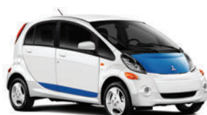
Diamond White/Ocean Blue