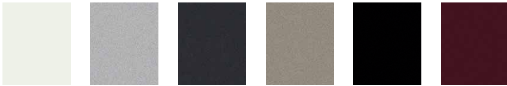
BELLANOVA WHITE PEARL