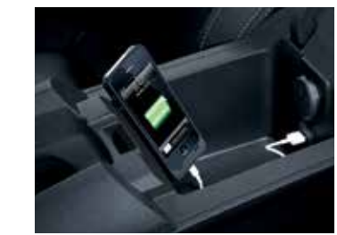
Available USB port.9

1 MyLink functionality varies by model. Full functionality requires compatible Bluetooth and smartphone, and USB connectivity for some devices MyLink on Camaro does not include CD player. Visit MyLink.Chevrolet.ca for more details. 2 Requires available Chevrolet MyLink and compatible iPhone running iOS 6. 3 Data plan rates apply. 4 Available in 10 Canadian provinces and the 48 contiguous United States. Subscription sold separately after trial period. Visit siriusxm.ca for details. 5 Requires iPhone or Android platform. 6 Available on select Apple, Android and BlackBerry devices. Services vary by device, vehicle and conditions. Requires active OnStar service plan. 7 Requires automatic transmission and factory-installed remote vehicle starter system. 8 Visit onstar.ca for coverage map, details and system limitations. Services vary by model and conditions. After the complimentary trial period, an active OnStar service plan is required. 9 Not compatible with all devices.