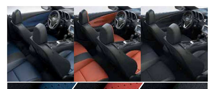
Blue-Accented Leather Appointments<sup>4</sup> Inferno Orange-Accented Leather