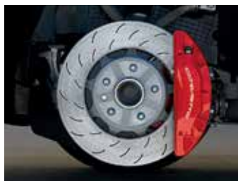
Available Red calipers shown with Brembo slotted brakes for Stingray with available Z51 Performance Package.