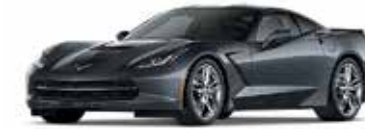
GBV - CYBER GREY METALLIC