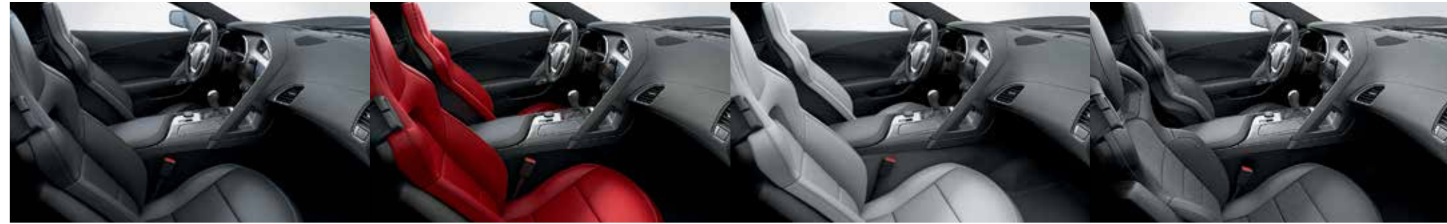
Black Leather (1LT)