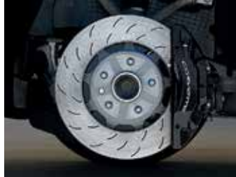
Black calipers shown with Brembo® slotted brakes for Stingray with available Z51 Performance Package.