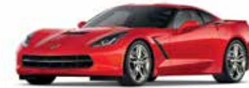
GKZ - TORCH RED