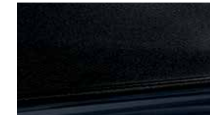
41T - Black