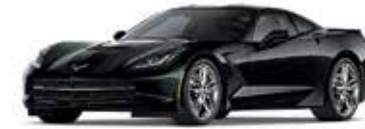
G8A - BLACK