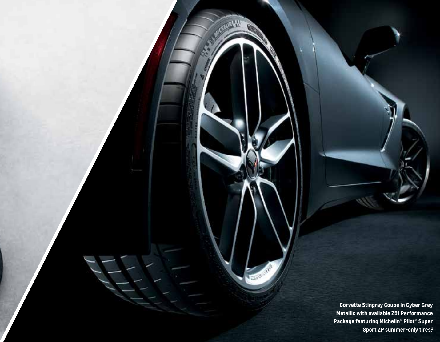
Corvette Stingray Coupe in Cyber Grey Metallic with available Z51 Performance Package featuring Michelin® Pilot® Super Sport ZP summer-only tires 2

06 Available with Z51 Performance Package, split 5-spoke aluminum wheel 1 in chrome (Q7E).