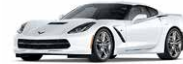
G8G - ARCTIC WHITE