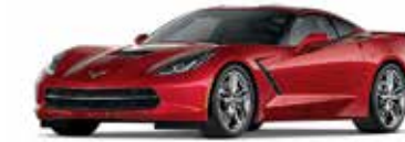
G8E - CRYSTAL RED TINTCOAT 1