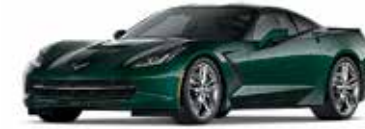
G7J - LIME ROCK GREEN METALLIC 1