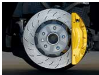
Available Yellow calipers shown with Brembo slotted brakes for Stingray with available Z51 Performance Package.

1 These wheels are paired with summer-only tires. Do not use summer-only tires in winter conditions, as it would adversely affect vehicle safety, performance and durability. Use only GM-approved tire and wheel combinations. Unapproved combinations may change the vehicle's performance characteristics. For important tire and wheel information, see your dealer for details. 2 Do not use summer-only tires in winter conditions, as it would adversely affect vehicle safety, performance and durability. Use only GM-approved tire and wheel combinations. Unapproved combinations may change the vehicle's performance characteristics. For important tire and wheel information, see your dealer for details.