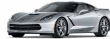
GAN - BLADE SILVER METALLIC