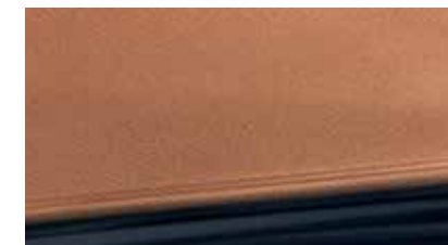
21T - Kalahari