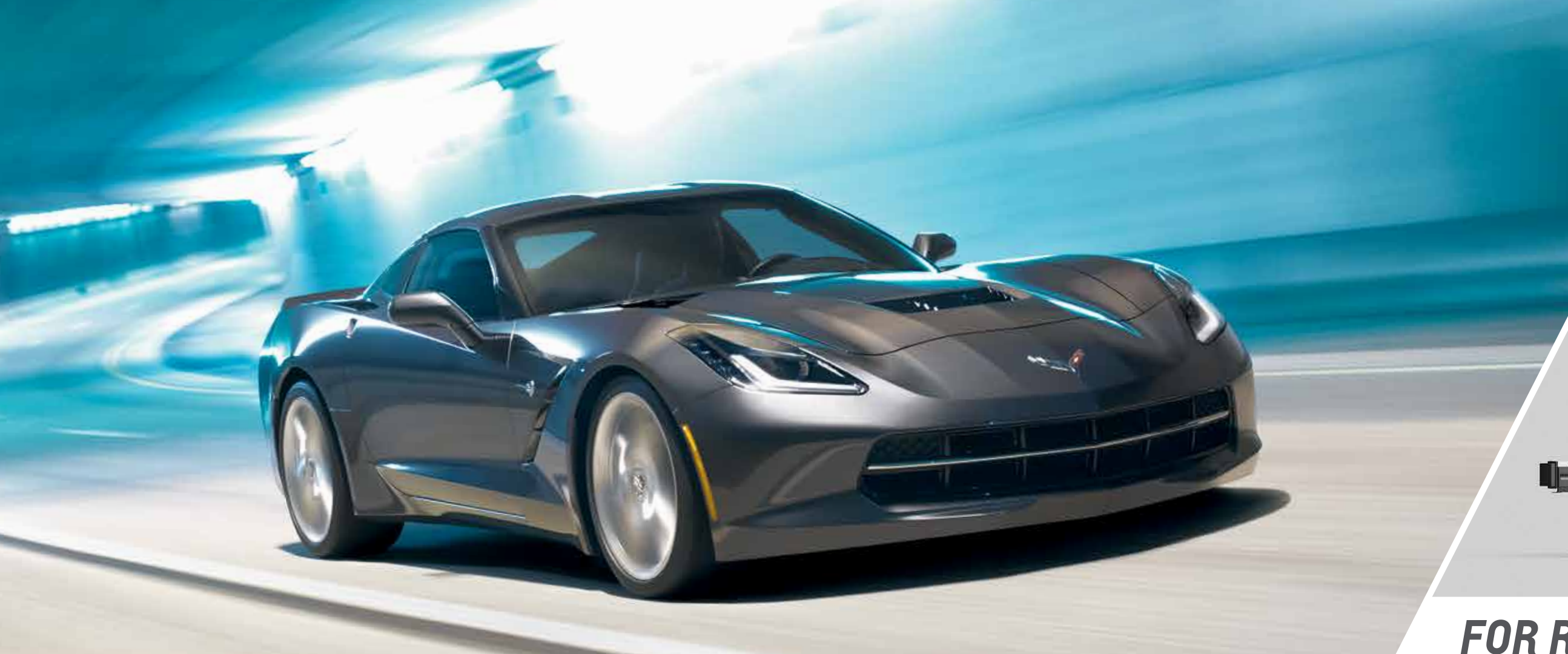
Corvette Stingray Coupe in Cyber Grey Metallic with available Z51 Performance Package and available visible carbon-fibre roof panel.

SURFACE-TO-AIR PRECISION “The 2014 Corvette Stingray integrates more high-performance aerodynamic features than ever before, many taken directly from Corvette Racing,” says Corvette Chief Engineer Tadge Juechter. “The front grille and radiator flow paths reduce lift, improving vehicle stability at high speeds by keeping the car pressed to the pavement. In addition, functional vents increase track capability by channelling air to the brakes, as well as heat exchangers for the transmission and differential.”