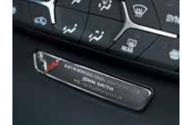
Available personalized interior plaque.