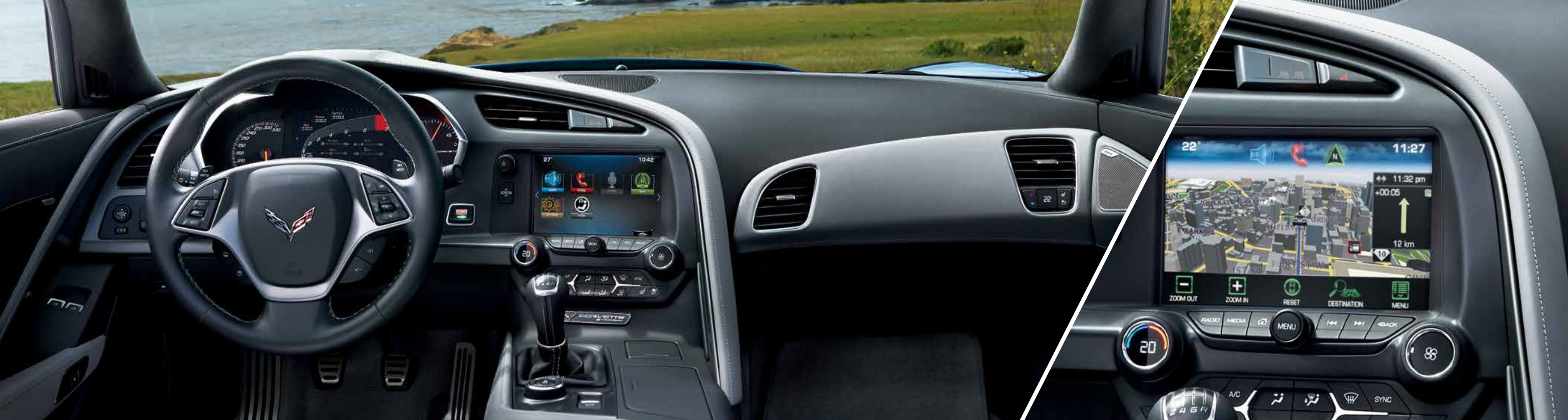
Corvette Stingray 3LT interior in Grey with available carbon-fibre interior trim and available Sueded Microfibre-Wrapped Upper Interior Trim Package.

BRIGHTER THAN THE SUN The intuitive instrument cluster bears two ultra-bright 203 mm (8-in.) diagonal high-resolution LED screens – screens so bright they can even be read with the Convertible top down in direct sunlight. The motorized drop-down faceplate beneath the tablet-inspired centre stack touch-screen display reveals a concealed storage area with USB port. 1 And an ingenious colour Head-Up Display (HUD) on 2LT and 3LT complements the dual display, projecting critical data into the driver's line of vision on the windshield.