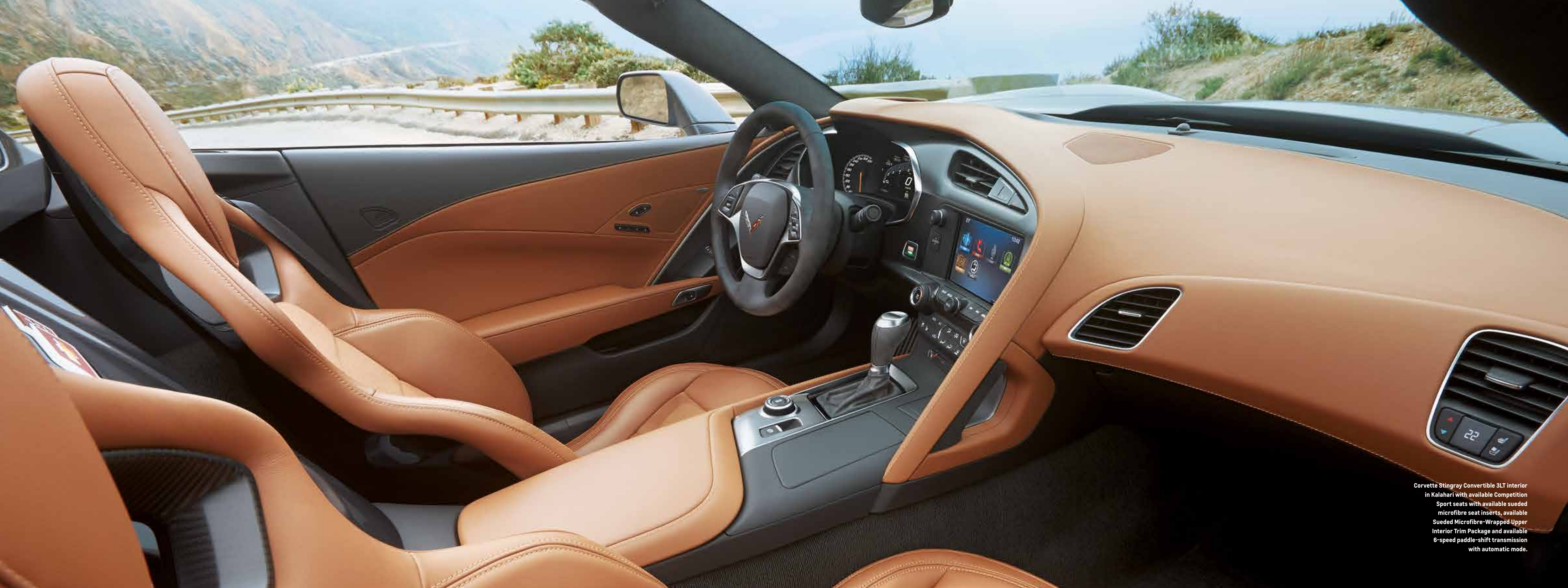
Corvette Stingray Convertible 3LT interior in Kalahari with available Competition Sport seats with available sueded microfiber seat inserts, available Sueded Microfiber-Wrapped Upper Interior Trim Package and available 6-speed paddle-shift transmission with automatic mode.