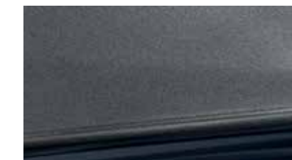
37T - Grey