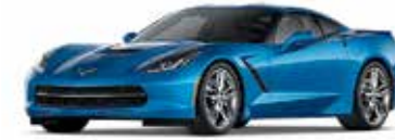
G7H - LAGUNA BLUE TINTCOAT 1