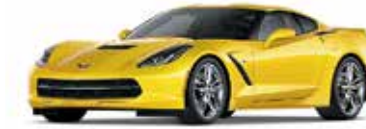
G8A - VELOCITY YELLOW TINTCOAT 1