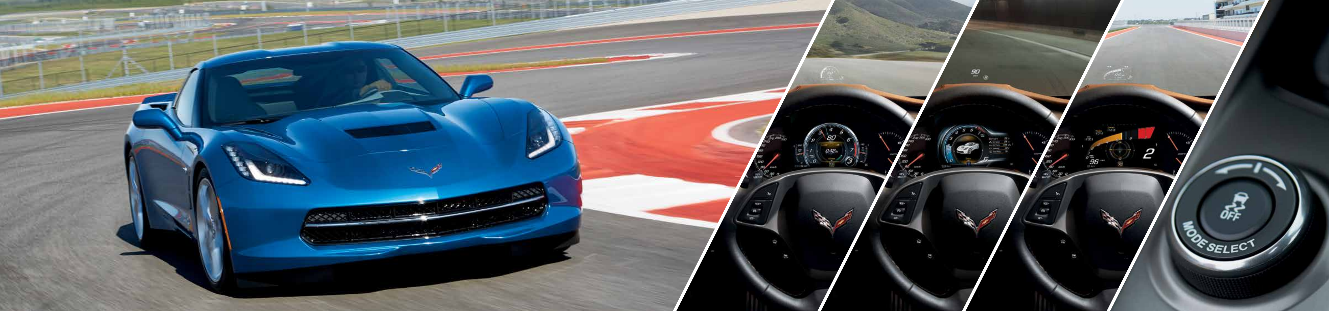
Corvette Stingray Coupe in Laguna Blue Tintcoat (extra-cost colour) with available Z51 Performance Package.