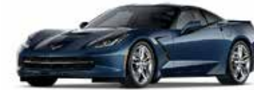
GXH - NIGHT RACE BLUE METALLIC