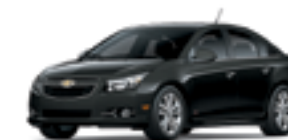
GAR - BLACK GRANITE METALLIC**