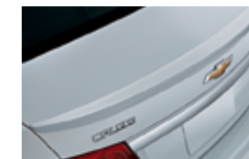
Spoiler (All Body Colours)

1 Standard on LS. 2 Standard on 1LT and Eco (1LT shown). 3 Standard on 2LT, 2.0TD and LTZ (2LT shown). 4 Standard on 2LT and LTZ (2LT shown).