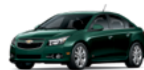
G7J - RAINFOREST GREEN METALLIC*