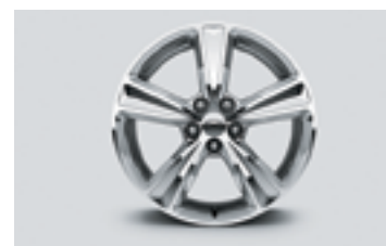
17" Chrome Wheels