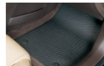
All-Weather Floor Mats