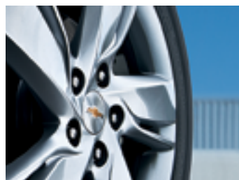
17" Aluminum Wheel.

INTERNATIONAL-CLASS PERFORMANCE It all starts with a 2.0L turbocharged clean diesel engine designed in Italy, built in Germany and installed at the Chevrolet assembly plant in Lordstown, Ohio. But this clean diesel doesn't sacrifice power. Cruze Clean Turbo Diesel boasts 151 horsepower and 264 lb.-ft. of low-end torque. 2 An overboost feature can increase torque to 280 lb.-ft. 2 for approximately 10 seconds when increased performance is necessary, such as passing on the highway.