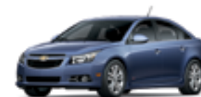
GWY - ATLANTIS BLUE METALLIC