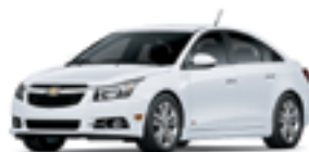
GAZ - SUMMIT WHITE