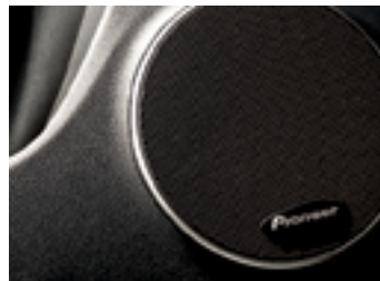
Premium 9-speaker Pioneer audio system.