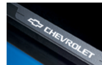
Door Sill Plates