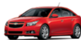
G7C - RED HOT