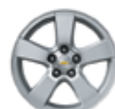
16" 5-Spoke Machined-Face Aluminum (Standard on 2LT)