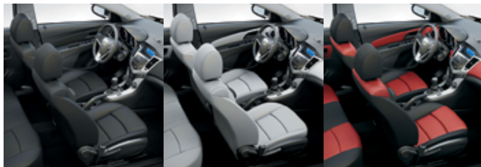
Jet Black Premium Cloth 2