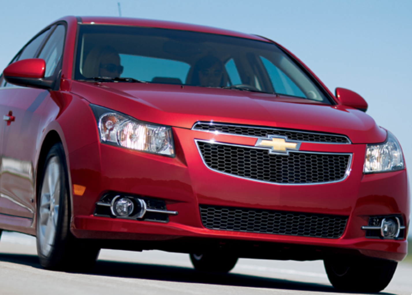
Cruze LTZ in Crystal Red Tintcoat (extra-cost colour) with available RS Package.