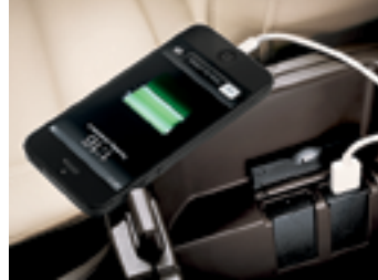
USB connectivity. 5

MYCHEVROLET ® MOBILE APP Here's another way to conveniently connect to your Cruze: Schedule a service appointment online. View the Owner's Manual. Even create a reminder of where you parked – with a mark on the map and a photo to jog your memory.