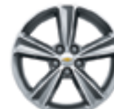
17" 5-Spoke Flangeless Aluminum (Standard on LTZ)