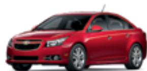
GBE - CRYSTAL RED TINTCOAT***†