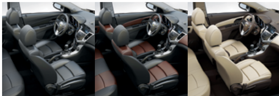
Jet Black Leather Appointments 3