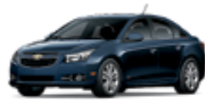
GXH - BLUE RAY METALLIC

* Available at extra cost, except Clean Turbo Diesel model. ** Available at extra cost. † Not available on LS.