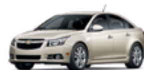
GWT - CHAMPAGNE SILVER METALLIC