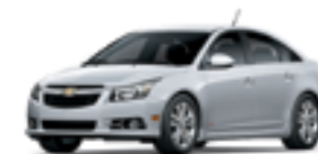
GAN - SILVER ICE METALLIC