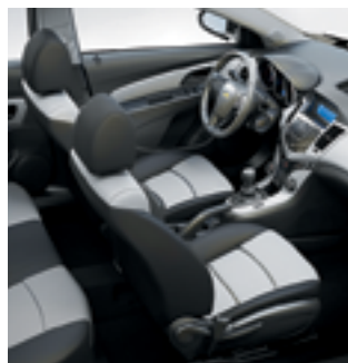
Jet Black/Medium Titanium-Colour Premium Cloth 1