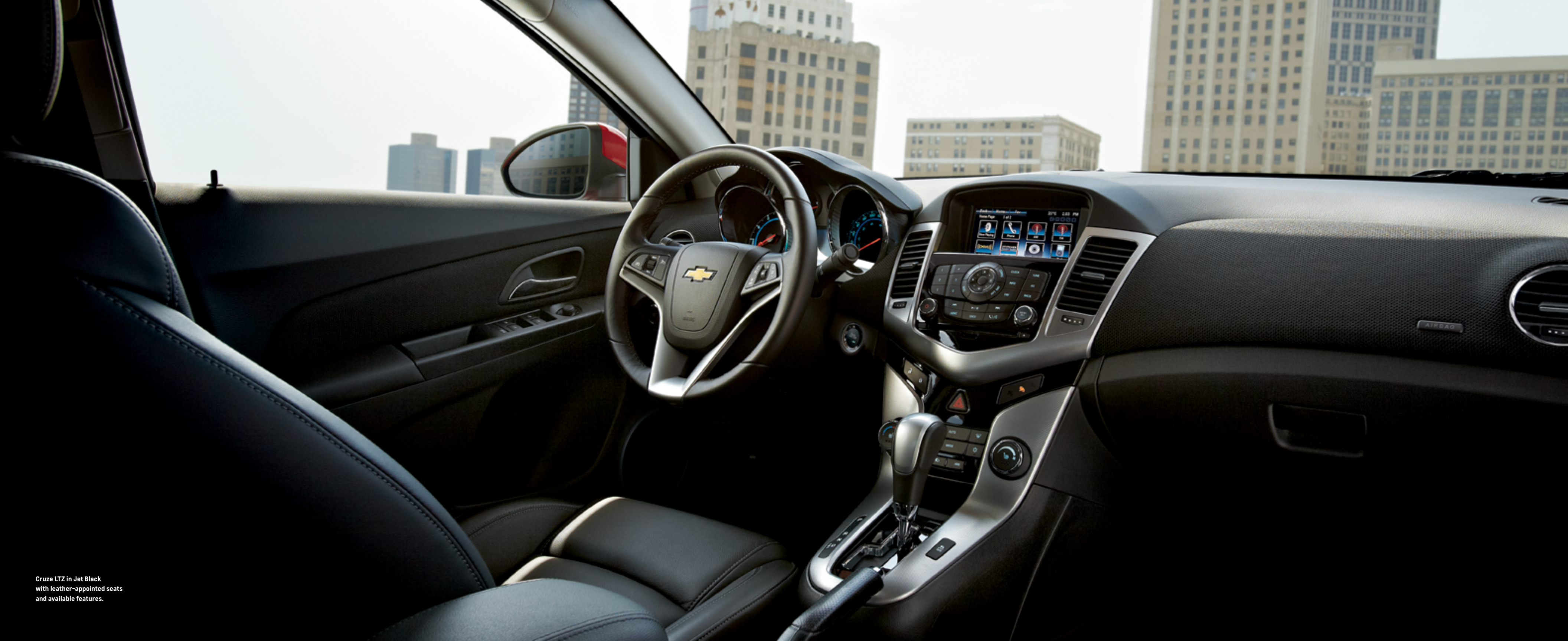
Cruze LTZ in Jet Black with leather-appointed seats and available features.