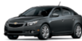
GXG - TUNGSTEN METALLIC*