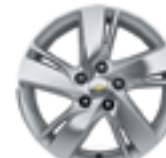
17" Split 5-Spoke Aluminum (Standard on 2.0TD)