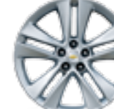
18" Split 5-Spoke Silver-Painted Flangeless Aluminum (Included with available RS Appearance Package)