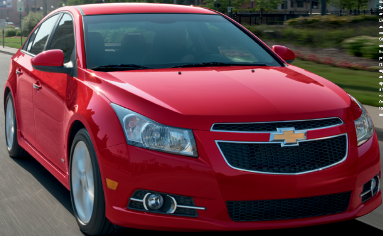
Cruze LTZ in Red Hot with available RS Package.

WHO SAYS YOU CAN'T HAVE IT ALL? With expressive styling, outstanding fuel efficiency and standout safety technology, Chevrolet Cruze is redefining the compact sedan. The ingenious Cruze Eco offers a highway fuel efficiency rating of 4.6 L/100 km 1 —better than Honda Civic and Hyundai Elantra. 2 The all-new Cruze Turbo Diesel offers the best highway fuel efficiency of any gas-only or diesel engine in Canada. 3 And Cruze was the first car in its class with 10 standard airbags. 4 Cruze—it's way beyond the everyday drive.