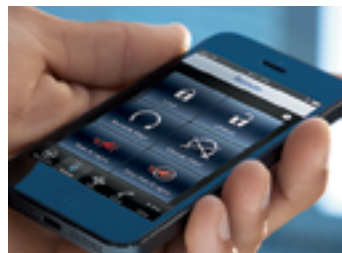
OnStar RemoteLink mobile app. 8