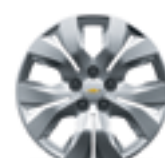
16" Steel with Silver-Painted Wheel Cover (Standard on LS and 1LT)