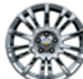
17" 15-Spoke Forged Polished Aluminum (Standard on Eco)