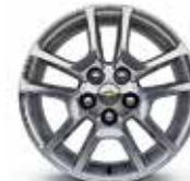
17" Split 5-Spoke Painted Lightweight Aluminum (Available on 1LT 3 )