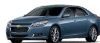
GWY - ATLANTIS BLUE METALLIC

* Available at extra cost. ** Not available on LTZ. † Not available on LS. †† Requires available Power Convenience Package and power sunroof on 1LT.