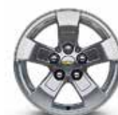
16" 5-Spoke Painted Aluminum (Standard on LS and 1LT)