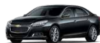
GAR - BLACK GRANITE METALLIC †