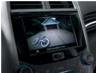
Available rear vision camera.