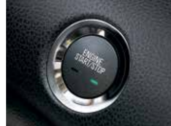
Available push-button start system.