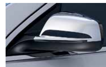
Chrome Mirror Caps