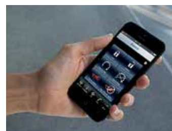
Available OnStar RemoteLink 7 mobile app.