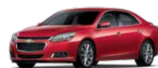
GBE - CRYSTAL RED TINTCOAT †,††