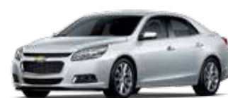
GAN - SILVER ICE METALLIC