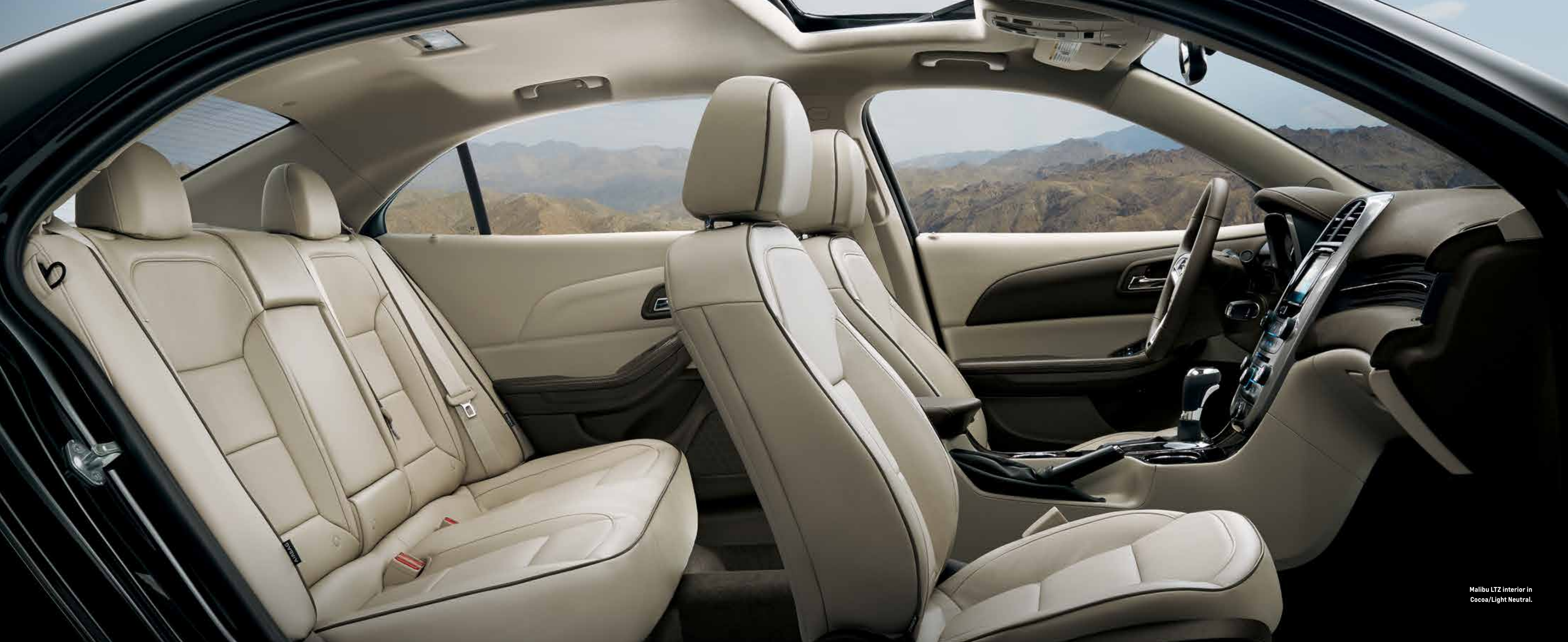
Malibu LTZ interior in Cocoa/Light Neutral.