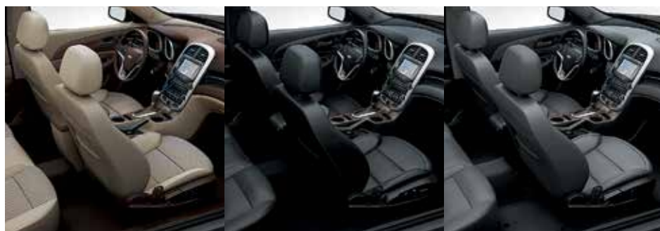
Cocoa/Light Neutral Premium Cloth/Leatherette Bolsters 2