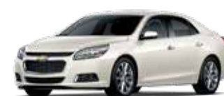
GWT - CHAMPAGNE SILVER METALLIC