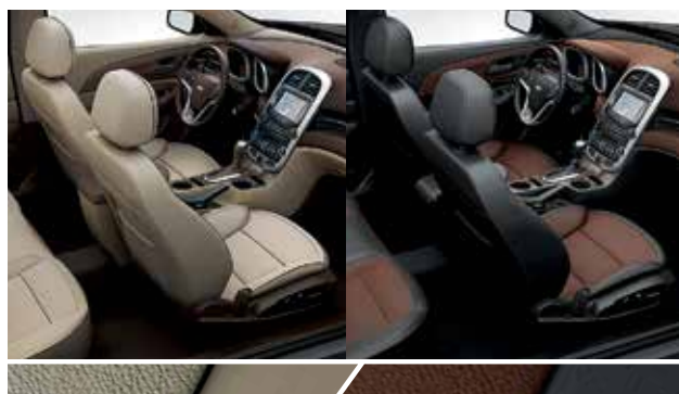
Cocoa/Light Neutral Leather Appointments/Vinyl Perimeter Accents 3,4