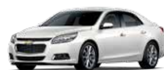
GBN - WHITE DIAMOND TRICOAT †,††