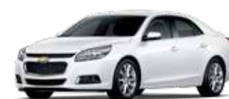
GAZ - SUMMIT WHITE ††