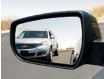
Available Side Blind Zone Alert 1