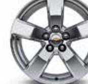
19" 5-Spoke Machined-Face Aluminum (Available on LTZ 4 )