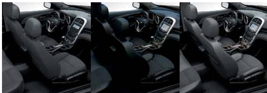
Jet Black/Titanium-Colour Cloth 1