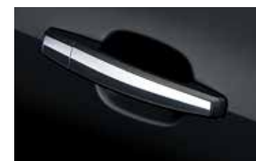
Chrome Door Handles