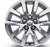
18" 10-Spoke Painted Aluminum (Standard on 2LT and 3LT, shown), Machined-Face with Painted Pockets (Standard on LTZ)