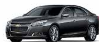
GLJ - ASHEN GREY METALLIC