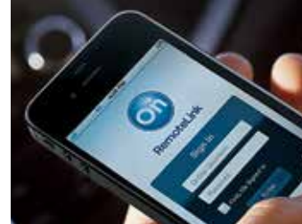
OnStar RemoteLink 7 mobile app.