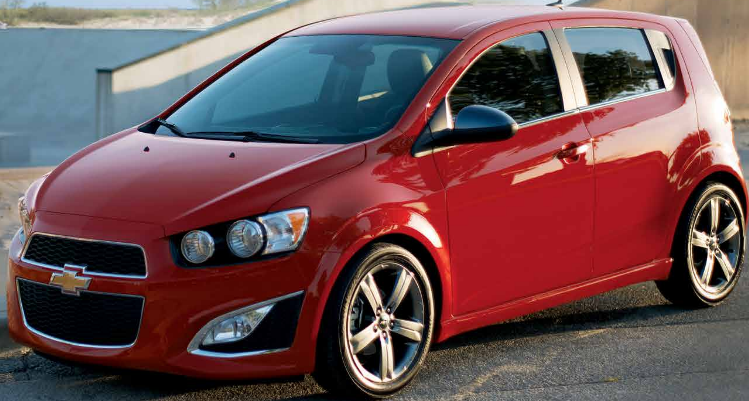
Sonic RS Hatchback in Red Hot.

A CAR FOR FIRSTS Chevrolet Sonic is the first and only car in its class to receive a 5-Star Overall Vehicle Score for Safety from NHTSA 2 . With its available turbocharged engine, Sonic has a highway fuel consumption rating of only 5.1 L/100 km. 3 And for the second year in a row, Sonic was recognized by the J.D. Power APEAL Study as the "Highest Ranked Vehicle Appeal among Sub-Compact Cars in the U.S." 1 Sonic invites everyone to experience life with three words: Let's do this!