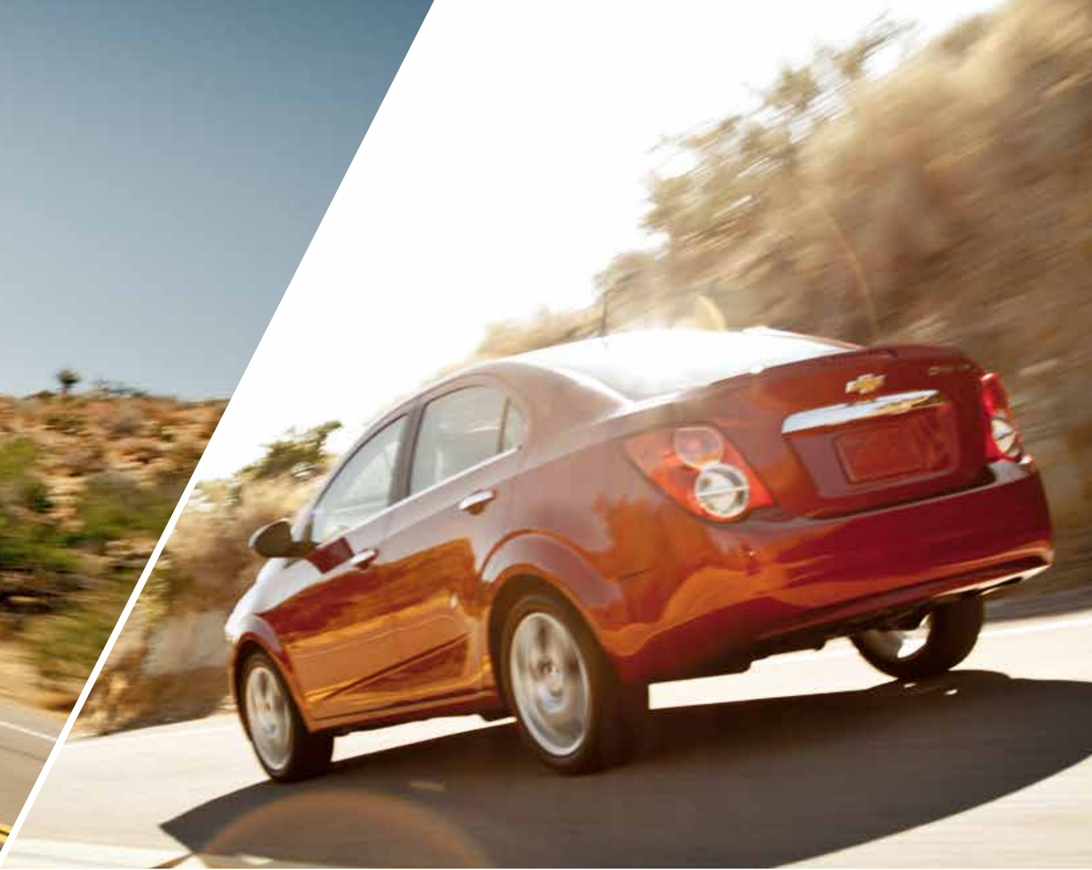
Far Left: Sonic LTZ Hatchback in Silver Ice Metallic. Left: Sonic LTZ Sedan in Crystal Red Tintcoat (extra-cost colour).

1 Achieved on a test track with turbocharged engine and 6-speed manual transmission. 2 Sonic with available 1.4L turbocharged engine and 6-speed manual transmission. Fuel consumption ratings based on GM testing in accordance with approved Transport Canada test methods. Your actual fuel consumption may vary.