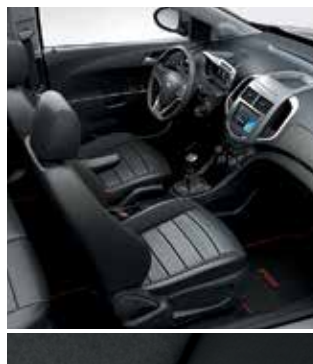
Jet Black Leather-Appointed Seats with Sueded Microfibre Inserts 4

1 Standard on LS. 2 Standard on LT. 3 Standard on LTZ. 4 Standard on RS.