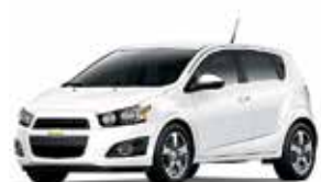
GAZ - SUMMIT WHITE