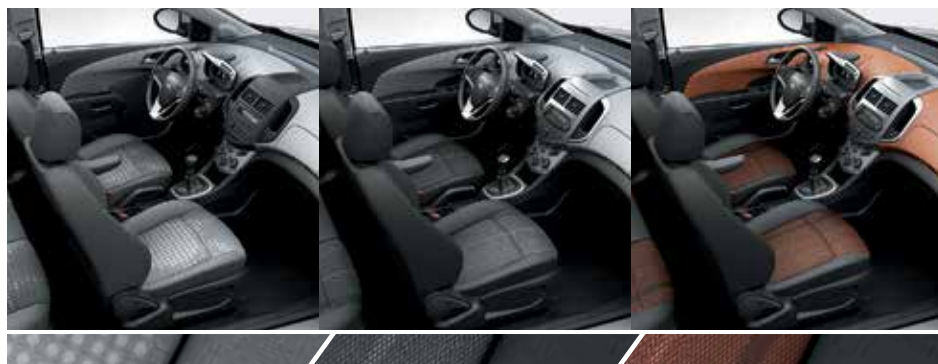
Jet Black/Dark Titanium-Colour Cloth 1