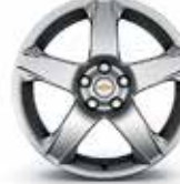
17" Painted Aluminum (Standard on LTZ; available on LT)