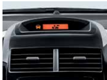
Available Forward Collision Alert.