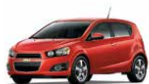
G7C - RED HOT