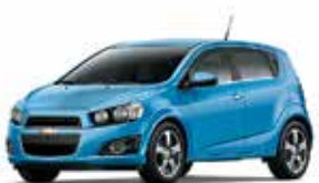
G7X - COOL BLUE 1