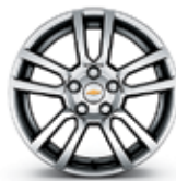
16" Painted Aluminum (Available on LT)