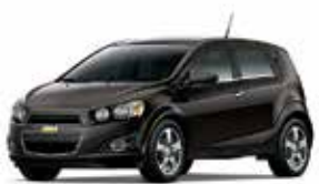
GVU - MOCHA BRONZE METALLIC 1

* Not available on RS. ** Available at extra cost. † Not available on LS and LT.