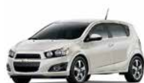
GBN - WHITE DIAMOND TRICOAT 1 †