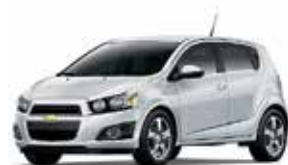
GAN - SILVER ICE METALLIC