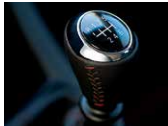
RS sport shift knob.