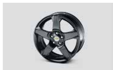
17" Black-Painted 5-Spoke Wheel (Also available in White)