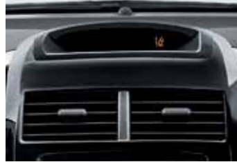
Available Lane Departure Warning.