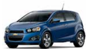
GTS - BLUE TOPAZ METALLIC