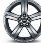
17" Midnight Silver-Painted Aluminum (Standard on RS)