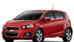
GBE - CRYSTAL RED TINTCOAT 1 **