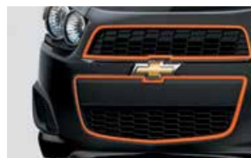
Z-Spec Orange-Flash Grille Surround (Also available in Black, Silver and White)