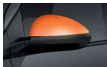
Z-Spec Orange-Flash Mirror Cap (Also available in Black, Silver and White)