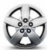
15" Steel with Bolt-On Wheel Cover (Standard on LS and LT Sedan)