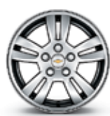
15" Painted Aluminum (Standard on LT Hatchback)