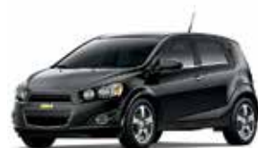
GAR - BLACK GRANITE METALLIC 1