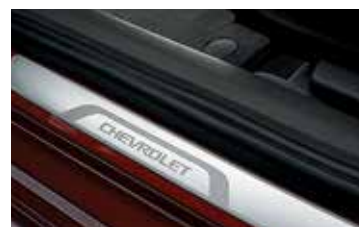
Door Sill Plate