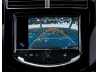
Available rear vision camera. 3

1 MyLink functionality varies by model. Full functionality requires compatible Bluetooth and smartphone, and USB connectivity for some devices. MyLink on Sonic does not include functionality such as enhanced voice recognition, Gracenote and CD player. Visit MyLink.Chevrolet.ca for more details. 2 Not compatible with all devices. 3 Requires available Chevrolet MyLink. 4 Standard on LT, LTZ and RS. Available in 10 Canadian provinces and the 48 contiguous United States. Subscription sold separately after trial period. Visit siriusxm.ca for details. 5 Data plan rates apply.