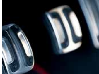
RS aluminum sport pedals.