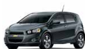
GLJ - ASHEN GREY METALLIC