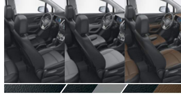
Jet Black Leatherette4