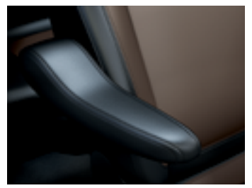
Standard driver inside armrest.