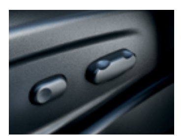
Available power 6-way driver sea