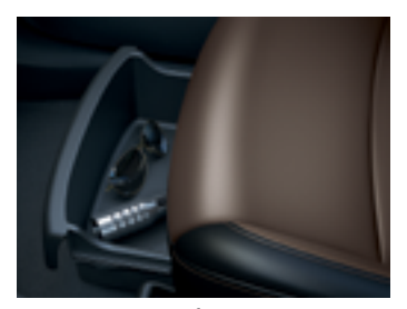
Front passenger under-seat storage tray.

1 MyLink functionality varies by model. Full functionality requires compatible Bluetooth and smartphone, and USB connectivity for some devices. MyLink on Trax does not include functionality such as enhanced voice recognition, Gracenote and CD player. Visit MyLink.Chevrolet.ca for more details.