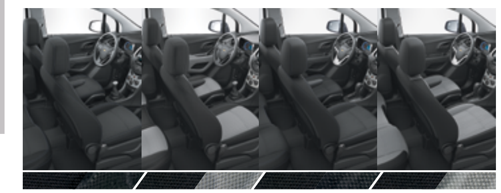
Jet Black Cloth<sup>1</sup>