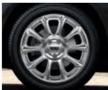
17-INCH POLISHED ALUMINUM Available on Limited