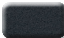
GRANITE CRYSTAL METALLIC