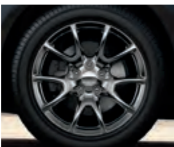
17-INCH HYPER BLACK ALUMINUM Included in Rallye Appearance Group on SXT