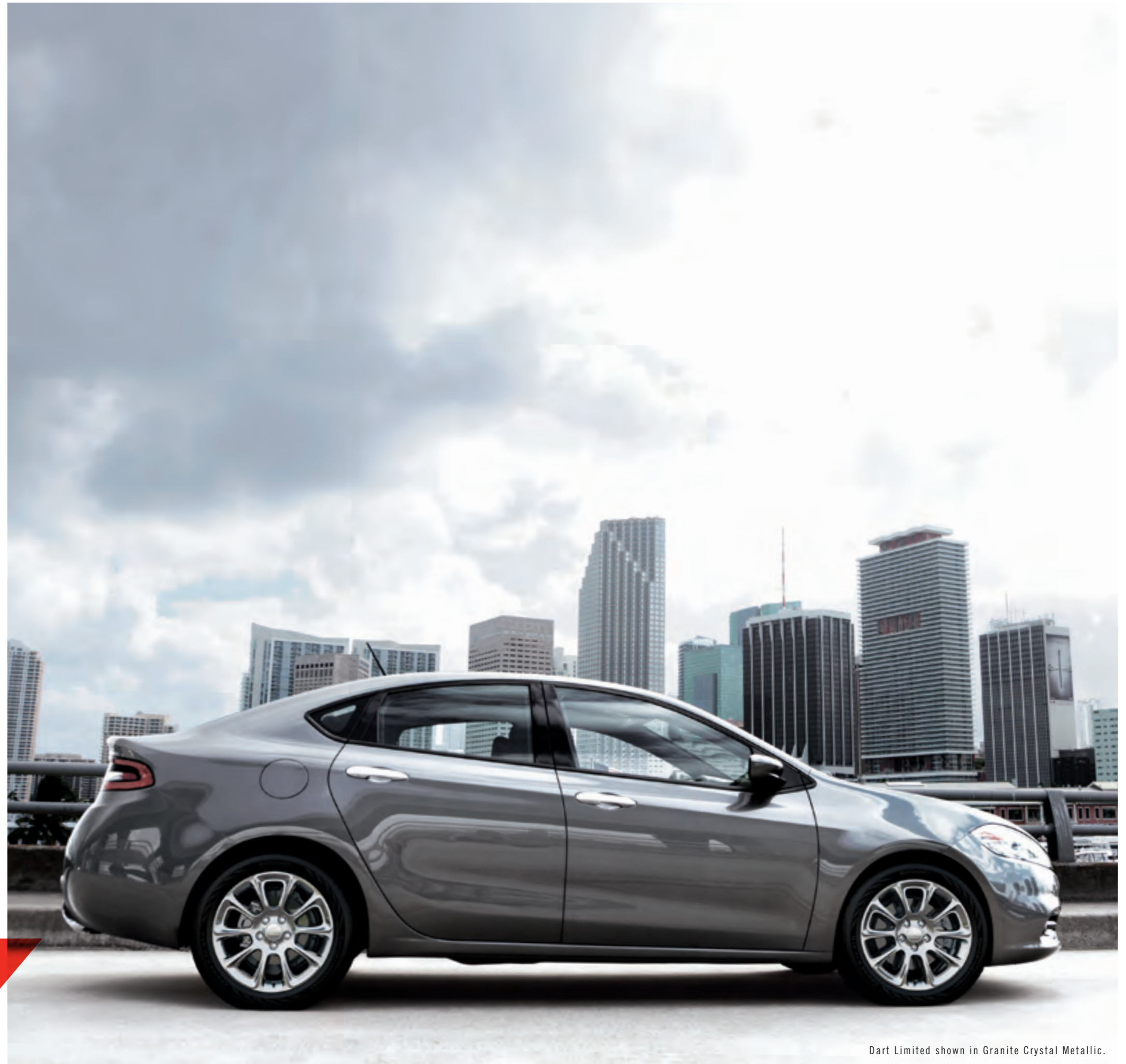
Dart Limited shown in Granite Crystal Metallic.

If you're looking for a more refined ride, check out Dart Limited. Bright grille and door handles, projector fog lamps and 17-inch Satin Silver aluminum wheels give this trim level its polished good looks. The interior is filled with must-have amenities like Nappa leather-faced seating, a power 10-way driver's seat, and heated leather-wrapped steering wheel with cruise and audio controls.