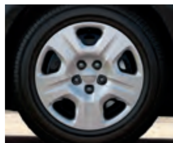
16-INCH WHEEL COVER Standard on SE