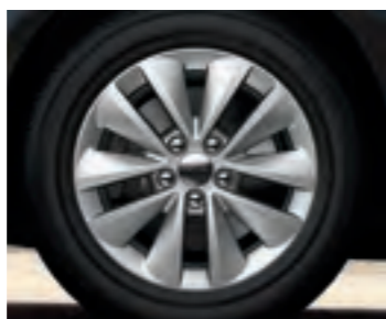
16-INCH TECH SILVER ALUMINUM Standard on SXT and Aero