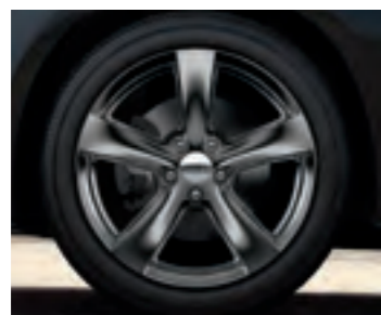
18-INCH HYPER BLACK ALUMINUM Standard on GT