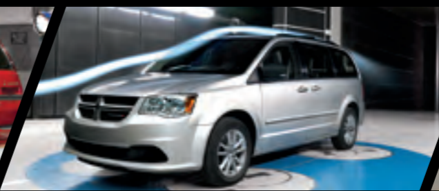
WIND TUNNEL TESTING