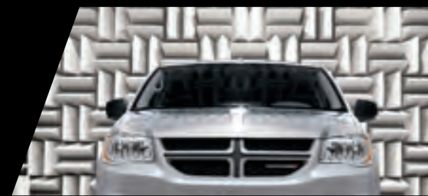
ANECHOIC CHAMBER — NOISE, VIBRATION AND HARSHNESS (NVH) TESTING