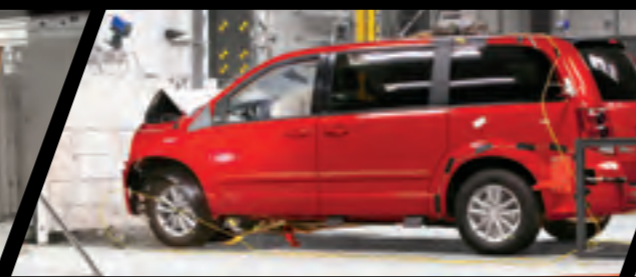
CRUSH ZONE TESTING