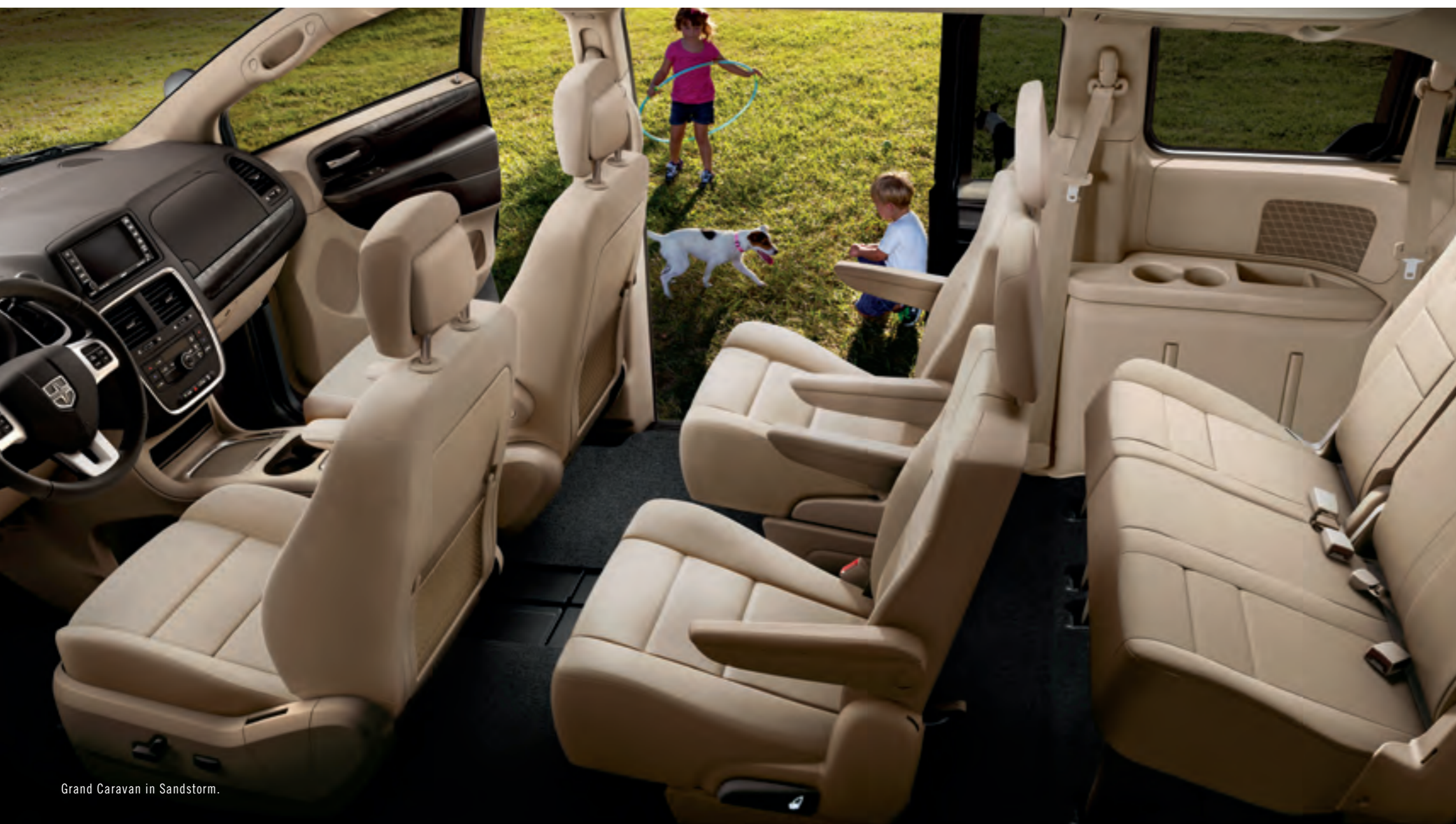
Grand Caravan in Sandstorm.