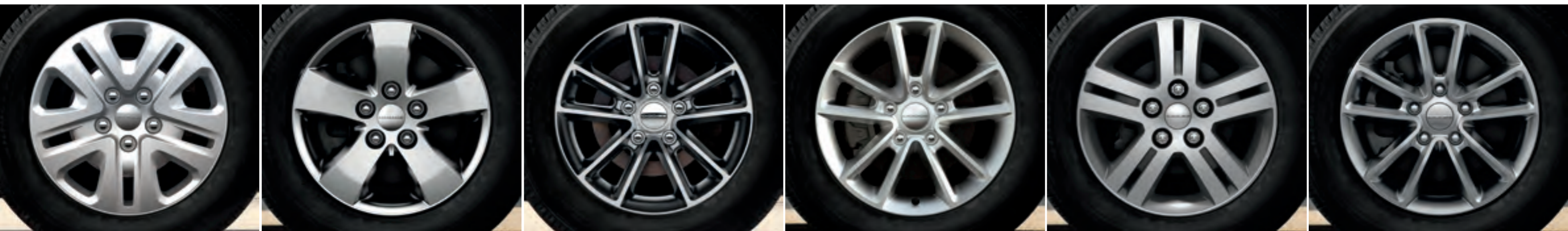
17-INCH STEEL Standard on CVP and SXT (W7A)