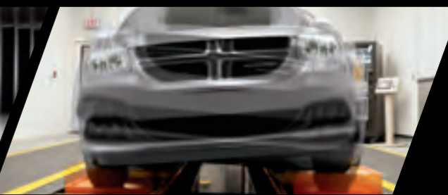
FOUR-POST SHAKER — SUSPENSION TESTING