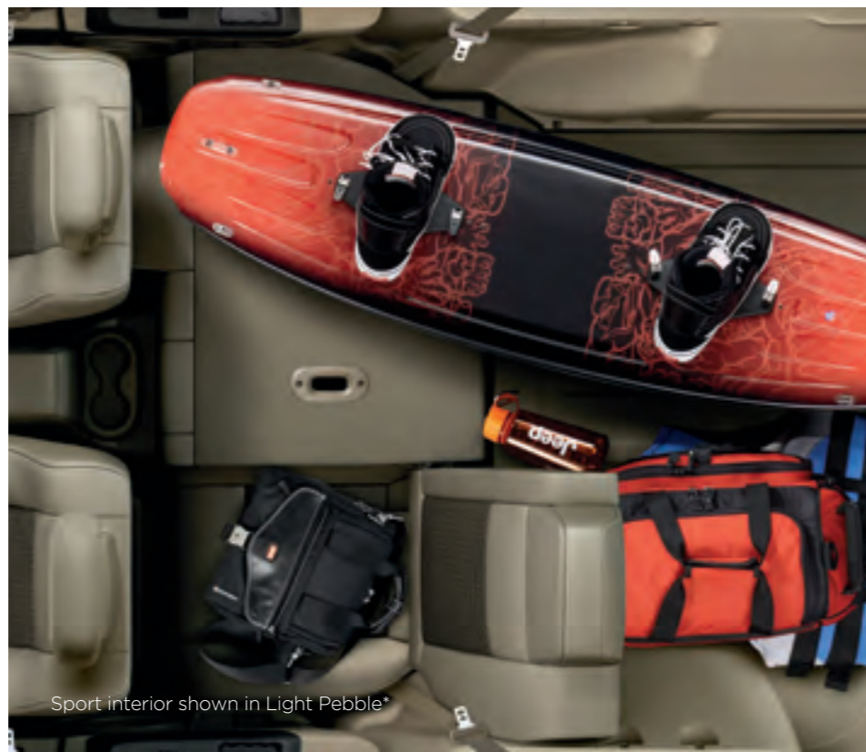
Sport interior shown in Light Pebble*