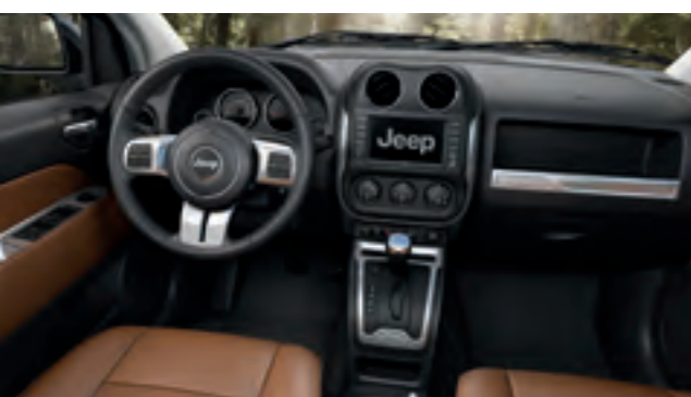
Leather-faced — Light Pebble