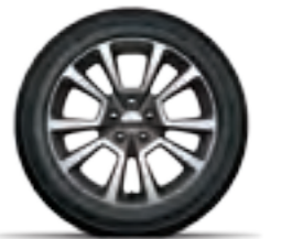
18-inch Aluminum with Painted Pockets Standard on Limited