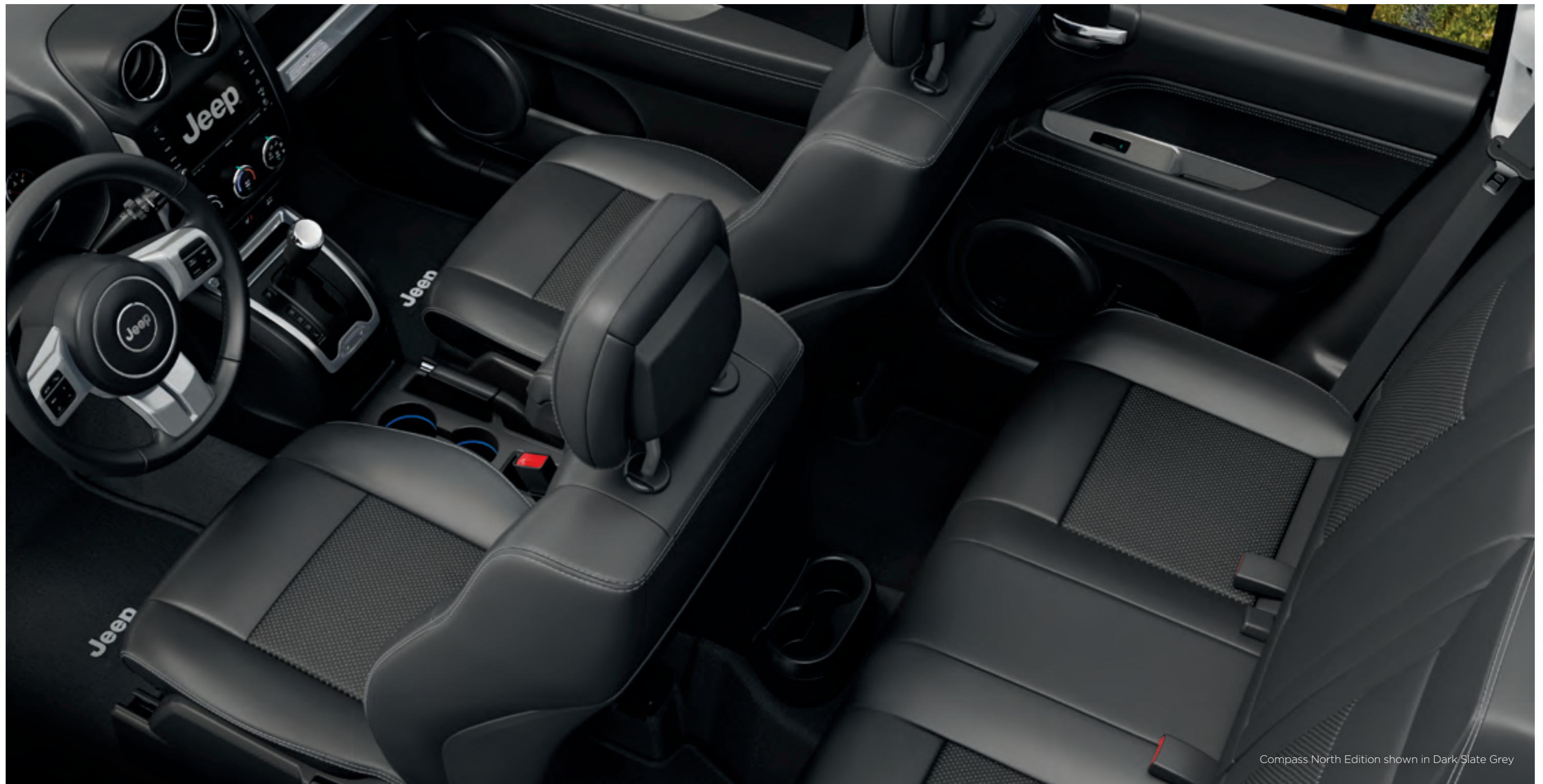
Compass North Edition shown in Dark Slate Grey