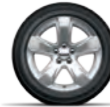
18-inch Chrome-clad Aluminum Available on Limited