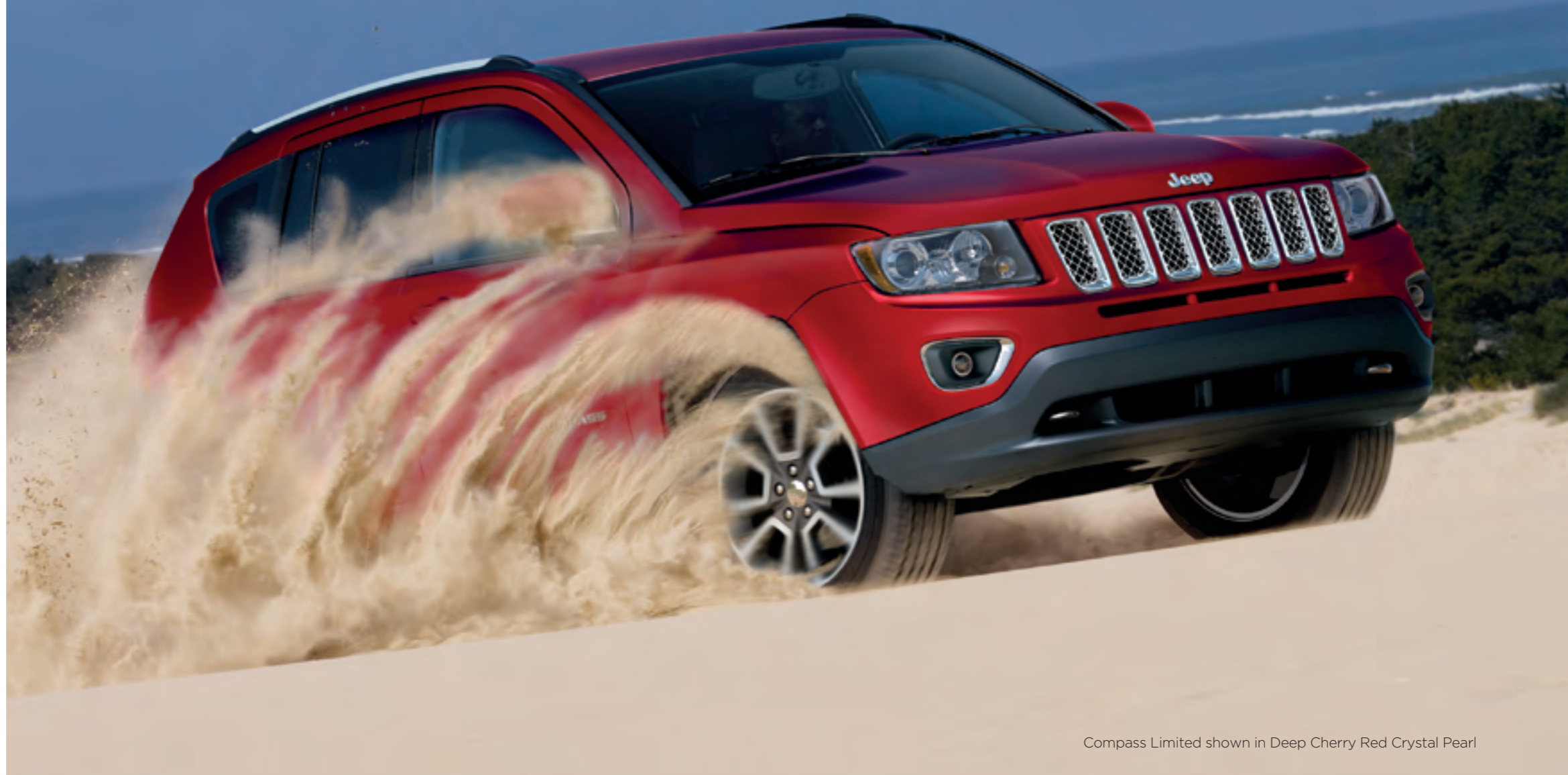
Compass Limited shown in Deep Cherry Red Crystal Pearl

This available system boasts a low range that provides the torque multiplication needed for water fording (3) managing steep grades, and crawling slowly in off-road events. Off-Road mode, included with CVT2, delivers an off-road-capable 19:1 crawl ratio.