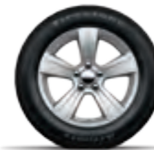
17-inch Aluminum Standard on Sport and North Edition with 2.4L engine. Available on Limited with Freedom Drive II® Off-Road Group