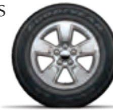
16-inch Machine-faced Aluminum Standard on Sport and North Edition with 2.0L engine