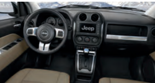
Sport mesh — Dark Slate Grey