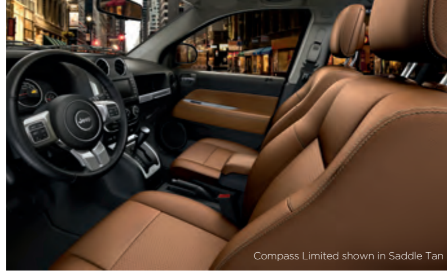
Compass Limited shown in Saddle Tan

Compass' interior is designed to achieve the optimal ratio of guests and gear. Rear-seat passengers will appreciate the Best-in-Class (2) legroom. Everyday necessities easily fit in the cargo space behind the second row. Fold down the two split-folding fold-flat rear seatbacks to reveal a generous 1518 litres (53.6 cu ft) of cargo room, enough to fit everything needed for a week-long camping trip, and utilize the available fold-flat passenger seat for even more cargo space. Since every adventure needs a great soundtrack, opt for the premium system with nine Boston Acoustics® speakers, including a subwoofer and two articulating liftgate speakers.