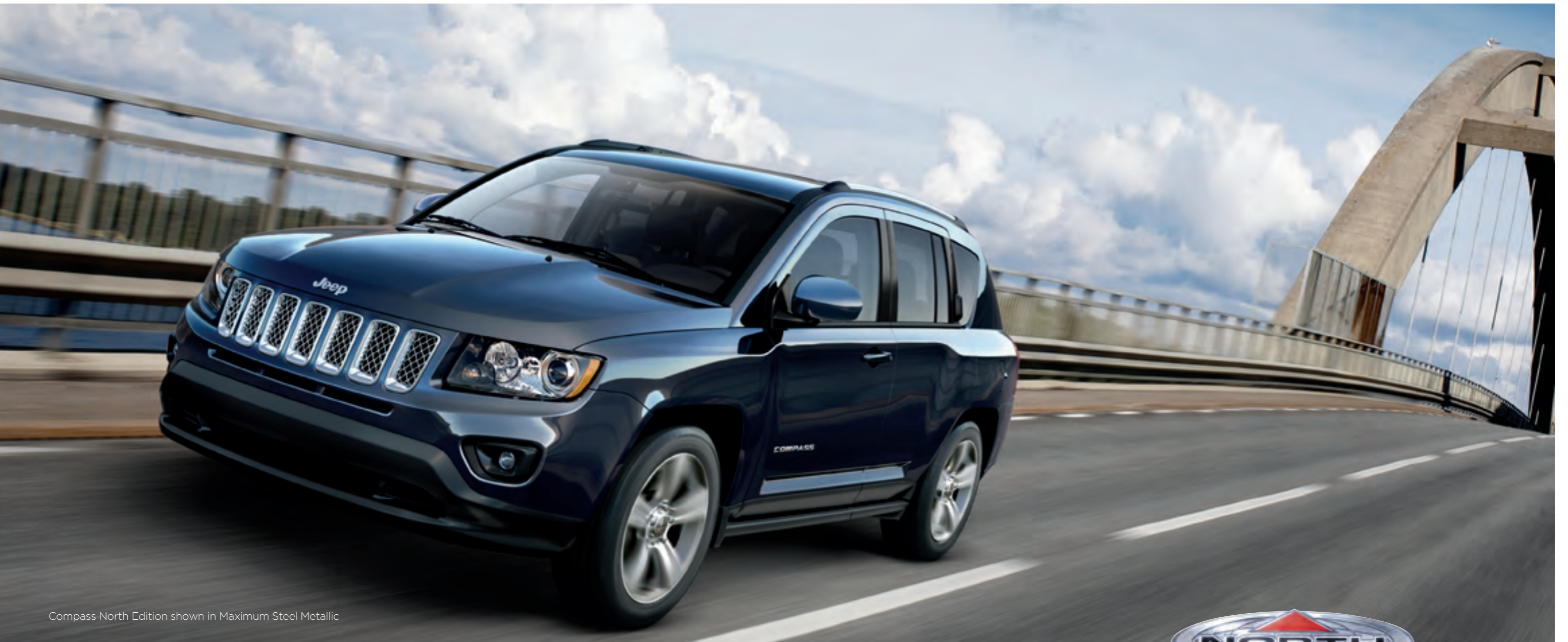
Compass North Edition shown in Maximum Steel Metallic