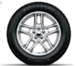
18-inch Aluminum Available on Limited