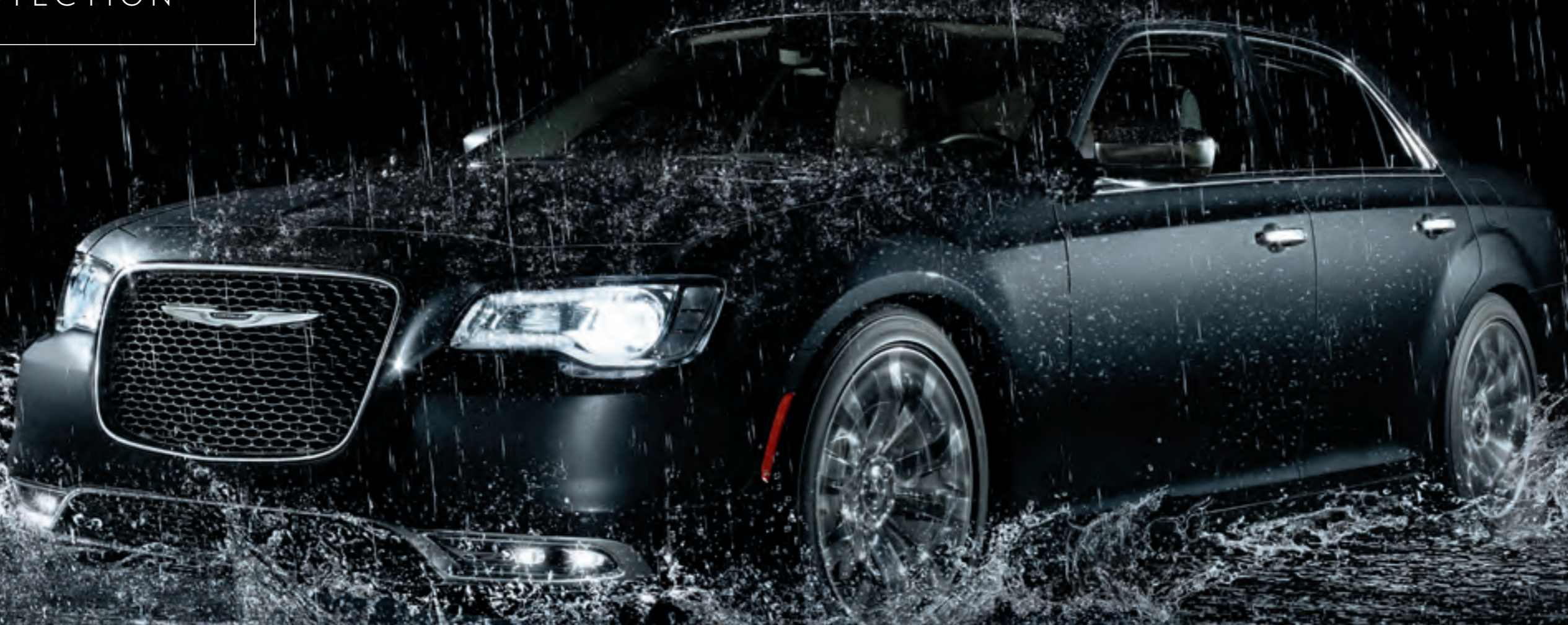
300C Platinum shown in Phantom Black Tri-coat Pearl