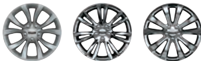
STANDARD 17-INCH TECH SILVER ALUMINUM (WBG)