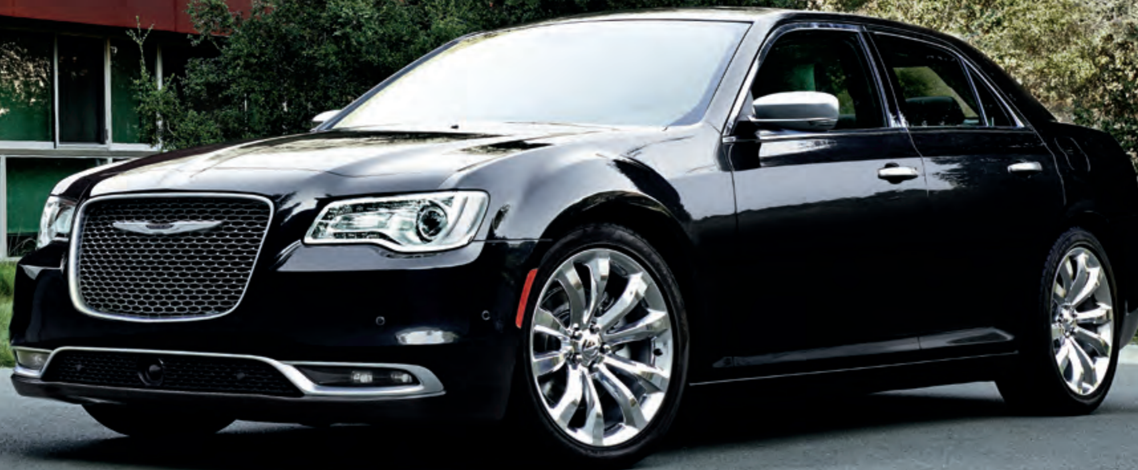
300C Platinum shown in Gloss Black

SIXTY YEARS OF STYLE. A bold redesign of the classic North American sedan, featuring world-class levels of sophistication, craftsmanship and technology. The sleek new Chrysler 300 unveils an expressive, sculpted exterior, bold new grilles and elegant new interior designs. The updated editions are all about performance, efficiency, advanced technology and sculptured styling. Four lifestyle-driven models highlight Chrysler 300's appeal featuring the award-winning 3.6L Pentastar™ Variable Valve Timing (VVT) V6 engine and standard, class-exclusive 1 TorqueFlite® 8-speed automatic transmission, and an available all-wheel drive (AWD) system that is the most technologically advanced in its class. 1 The responsive, available 5.7L HEMI® VVT V8 engine with FuelSaver Multi-Displacement System (MDS), is now paired with the 8-speed transmission for the ultimate combination of power and efficiency.