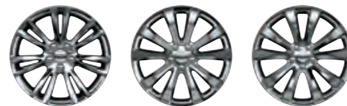
STANDARD 18-INCH POLISHED ALUMINUM (WPC)