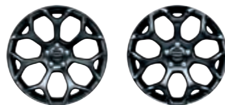
STANDARD 20-INCH HYPER BLACK ALUMINUM (WRS)