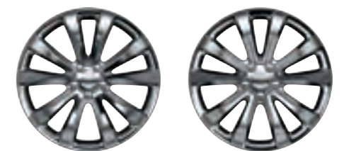
STANDARD 20-INCH POLISHED ALUMINUM (WFY)