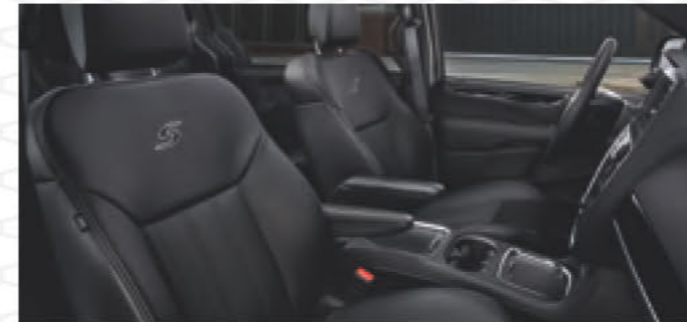
BLACK TORINO LEATHER-FACED WITH CLOTH INSERTS AND SILVER ACCENT STITCHING