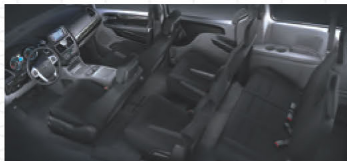
BLACK TORINO LEATHER-FACED