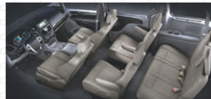
LIGHT GREYSTONE NAPPA LEATHER-FACED