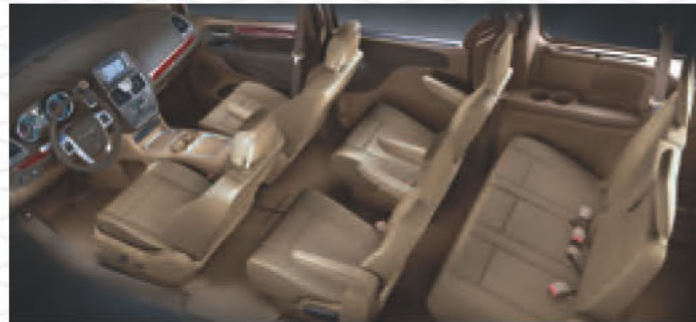
MEDIUM FROST CLOTH