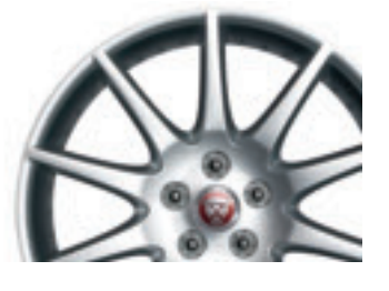
18" WHEEL - MERU