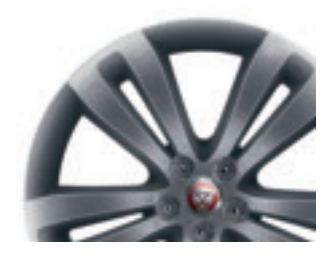
19" WHEEL - TOBA