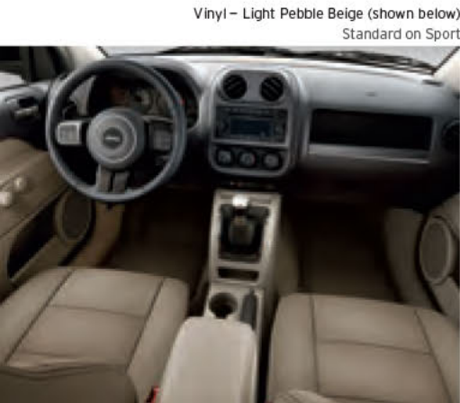
Vinyl – Light Pebble Beige (shown below) Standard on Sport