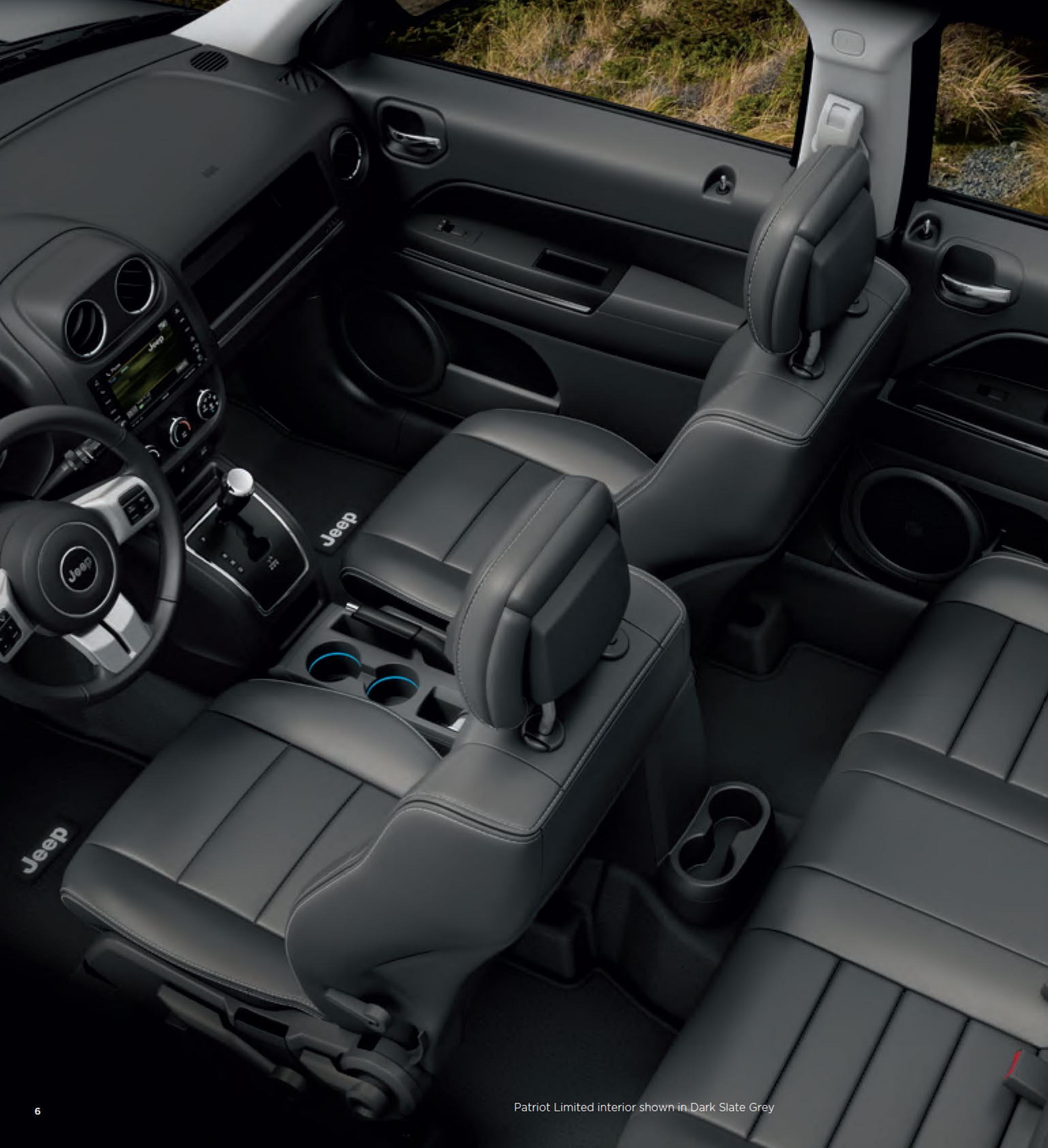
Patriot Limited interior shown in Dark Slate Grey