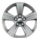
17-inch aluminum Standard on Limited, Available on Sport and North Edition