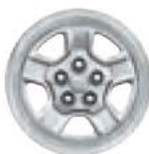
16-inch styled steel Standard on Sport and North Edition