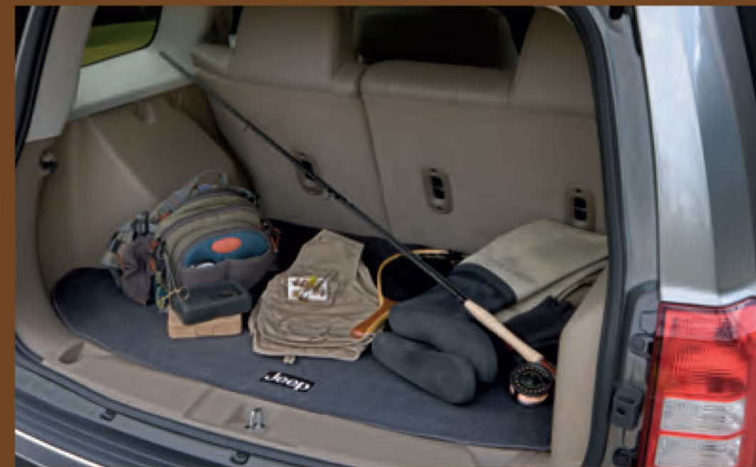
Shown with Mopar® Premium Carpet Cargo Mat, sold separately. See your retailer for genuine Mopar accessories.