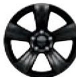
17-inch Mineral Grey Aluminum Available on North Edition with High Altitude Group