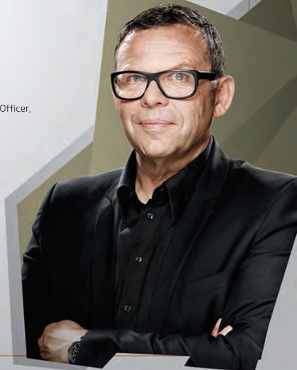
PETER SCHREYER President and Chief Design Officer, Kia Motors Corporation

To ensure that the 2015 Kia Rondo exceeds the highest standards of design, technology and quality, Peter Schreyer — one of the world's top 3 automotive designers — thoroughly oversees every aspect in its design direction. For Schreyer, each element should bear the 'absolute purity' in order to create the design as a whole. The 'simplicity' philosophy is at the core of Kia's creative language.