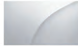
Polar BC / BL / BEL