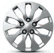
16" steel wheel cover