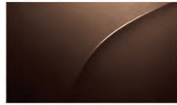
Galaxy Brown (M) BC / BL