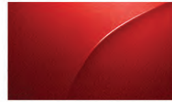
Inferno Red (M) BC / BL