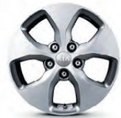
16" alloy wheel