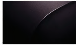
Black Cherry (P) BC / BL / BEL