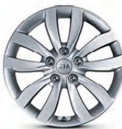
17" alloy wheel