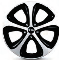
18" alloy wheel