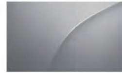
Titanium (M) BC / BL