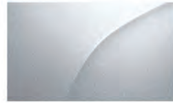
Sterling (M) BC / BL