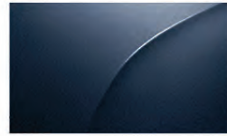
Fathom Blue (P) BC / BL