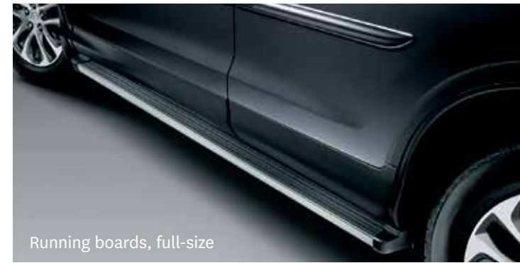
Running boards, full-size