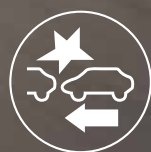
Available Collision Mitigation Braking System™ (CMBS®)

The available FCW system 1 that is integrated with CMBS® is designed to detect the presence of vehicles in front of you and issue alerts if you're approaching with too much speed. If you fail to respond to the alerts, the CMBS® is triggered into operation.