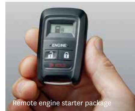
Remote engine starter package