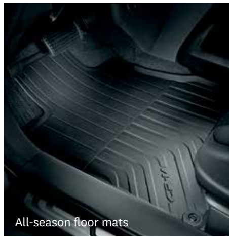
All-season floor mats