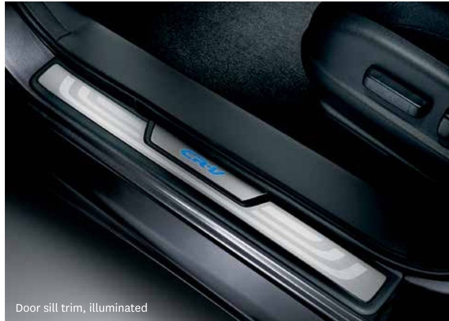
Door sill trim, illuminated