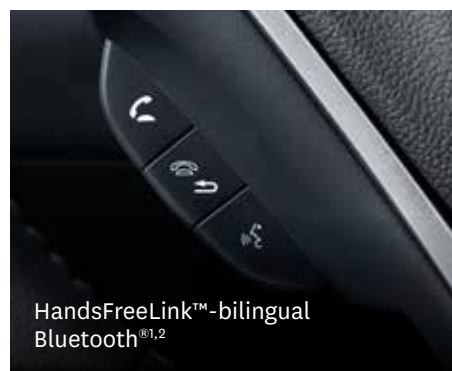
HandsFreeLink™-bilingual Bluetooth® 1,2