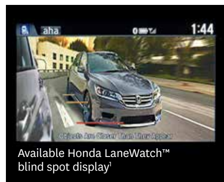
Available Honda LaneWatch™ blind spot display 1