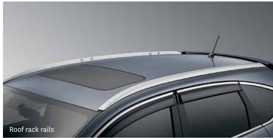
Roof rack rails