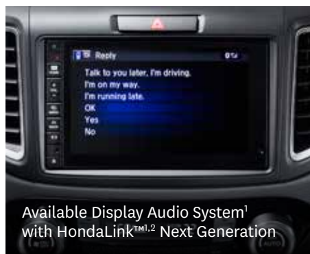
Available Display Audio System 1 with HondaLink™ 1,2 Next Generation