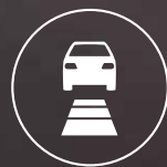
Available Adaptive Cruise Control (ACC)