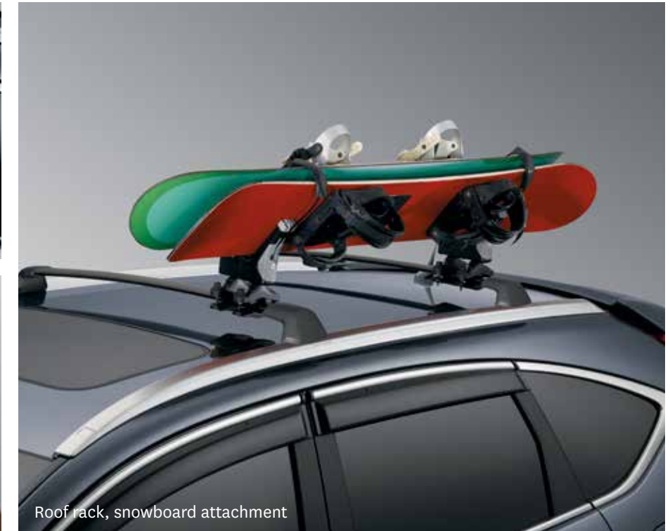
Roof rack, snowboard attachment