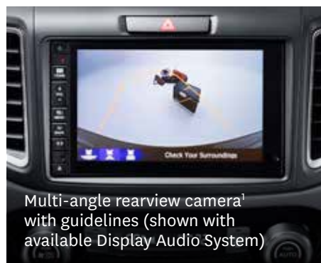
Multi-angle rearview camera 1 with guidelines (shown with available Display Audio System)