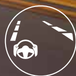
Available Lane Departure Warning (LDW) System