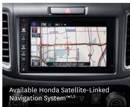
Available Honda Satellite-Linked Navigation System™ 1,3