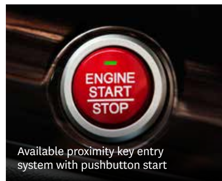
Available proximity key entry system with pushbutton start