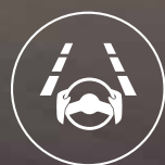
Available Lane Keeping Assist System (LKAS)