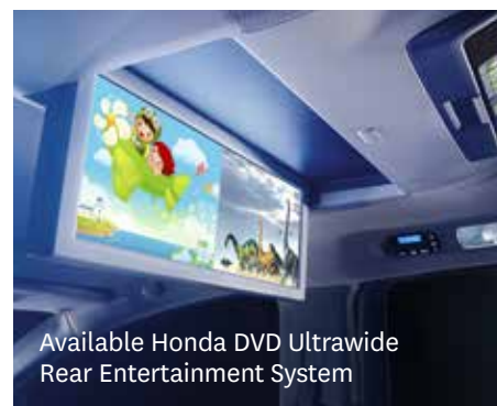
Available Honda DVD Ultrawide Rear Entertainment System