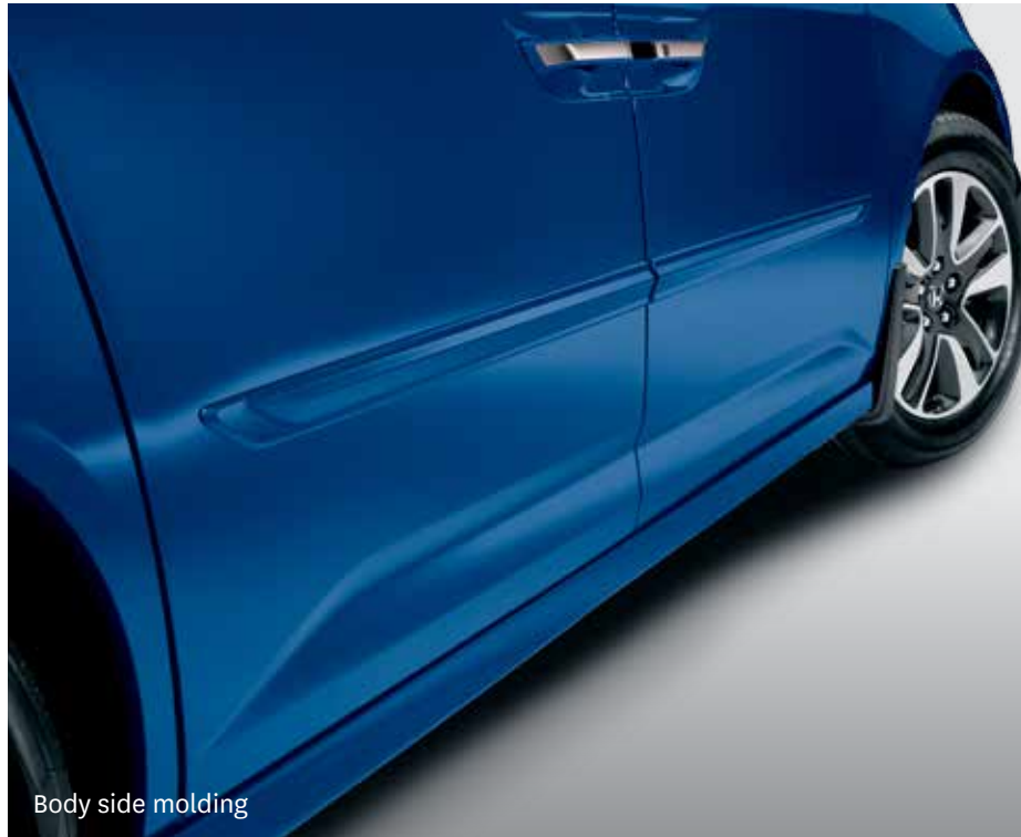
Body side molding