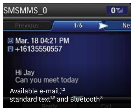
Available e-mail, 1,2 standard text 1,2 and Bluetooth®