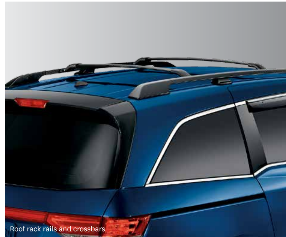
Roof rack rails and crossbars