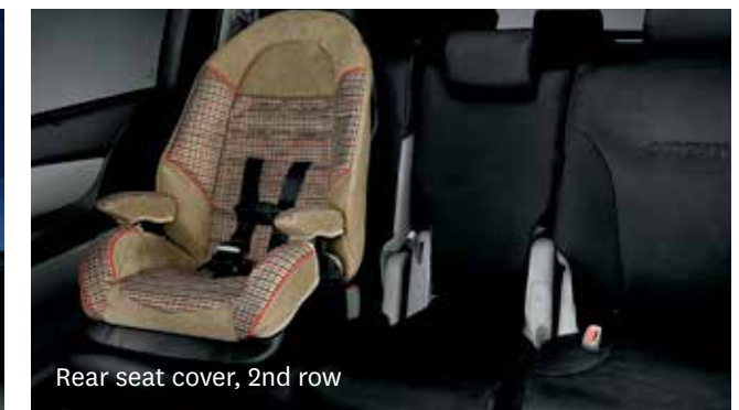
Rear seat cover, 2nd row