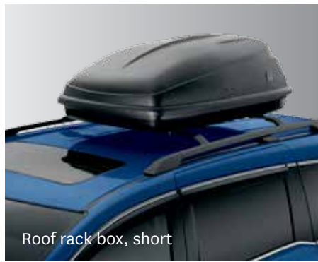
Roof rack box, short