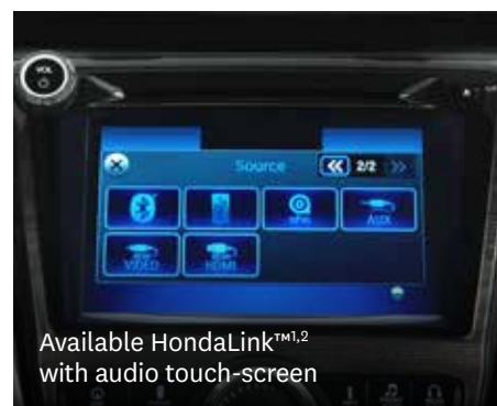
Available HondaLink™ 1,2 with audio touch-screen