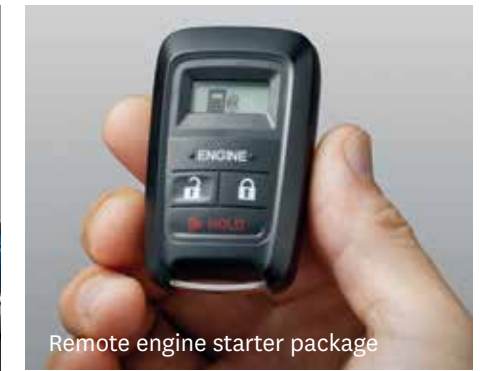
Remote engine starter package