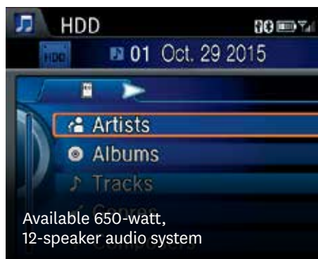
Available 650-watt, 12-speaker audio system