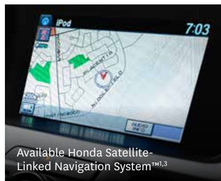
Available Honda Satellite-Linked Navigation System™ 1,3