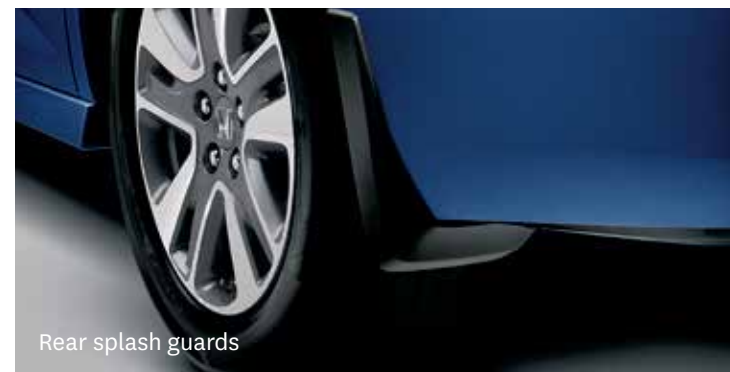
Rear splash guards