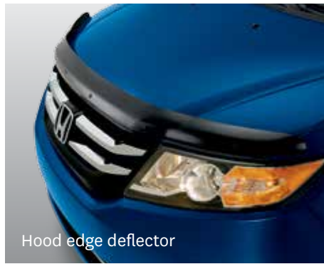
Hood edge deflector