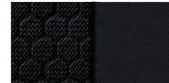
BLACK PREMIUM CLOTH