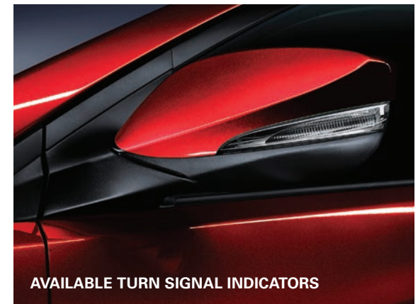
AVAILABLE TURN SIGNAL INDICATORS