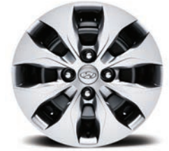
L and GL Wheel