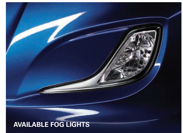
AVAILABLE FOG LIGHTS