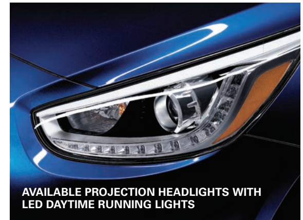
AVAILABLE PROJECTION HEADLIGHTS WITH LED DAYTIME RUNNING LIGHTS