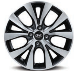
SE and GLS Wheel

Choice of interior colour depends upon exterior colour and/or model selection. Due to the print production process, the colours shown throughout this brochure may vary slightly from the actual hue. Textures may not be exactly as shown. Visit hyundaicanada.com or see your dealer for details.