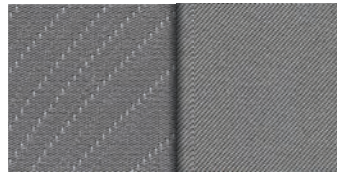
GREY PREMIUM CLOTH