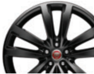
20" VENOM 5-TWIN SPOKE - GLOSS BLACK FINISH