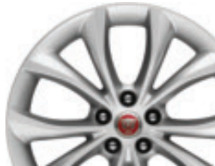
18" HELIX 10 SPOKE - SILVER FINISH