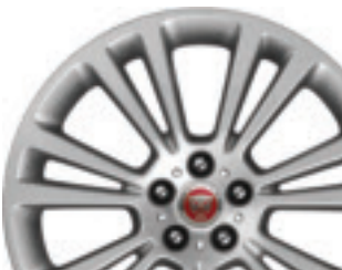
19" AXIS 14 SPOKE - SILVER FINISH