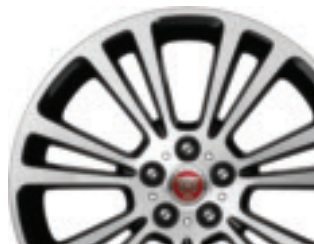
19" AXIS 14 SPOKE - CONTRAST DIAMOND TURNED