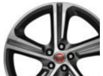
19" BLADE 5 SPOKE - SATIN GREY FINISH, DIAMOND TURNED