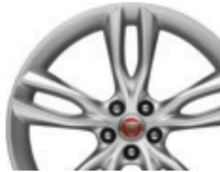
20" STAR 5-TWIN SPOKE - SILVER FINISH