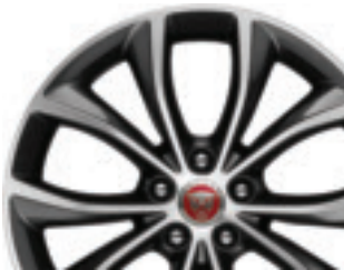
18" HELIX 10 SPOKE - CONTRAST DIAMOND TURNED