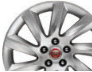
17" TURBINE 9 SPOKE - SILVER FINISH