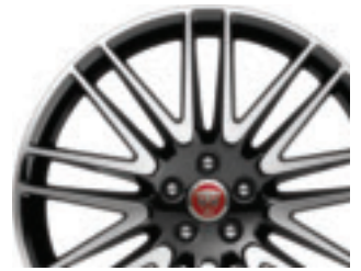
20" MATRIX 9-TWIN SPOKE - CONTRAST DIAMOND TURNED