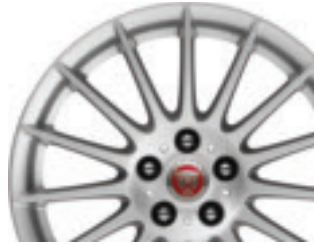
17" LIGHTWEIGHT 15 SPOKE - SILVER FINISH