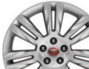
18" CHALICE 7-TWIN SPOKE - SILVER FINISH