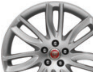
19" RAZOR 7-TWIN SPOKE - SILVER FINISH