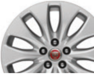
17" AERODYNAMIC 10 SPOKE - SILVER FINISH