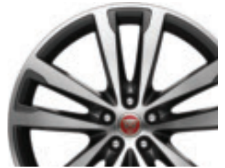
20" VENOM 5-TWIN SPOKE - GLOSS DARK GREY FINISH, DIAMOND TURNED