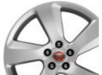
18" FAN 5 SPOKE - SILVER FINISH