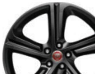
19" BLADE 5 SPOKE - GLOSS BLACK FINISH