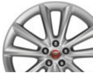
19" VORTEX 10 SPOKE - SILVER FINISH