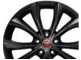
18" HELIX 10 SPOKE - GLOSS BLACK FINISH