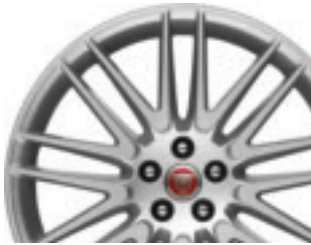
20" MATRIX 9-TWIN SPOKE - SILVER FINISH