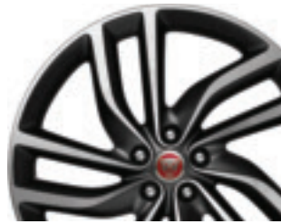
20" LABYRINTH 5-TWIN SPOKE - SATIN DARK GREY FINISH, DIAMOND TURNED